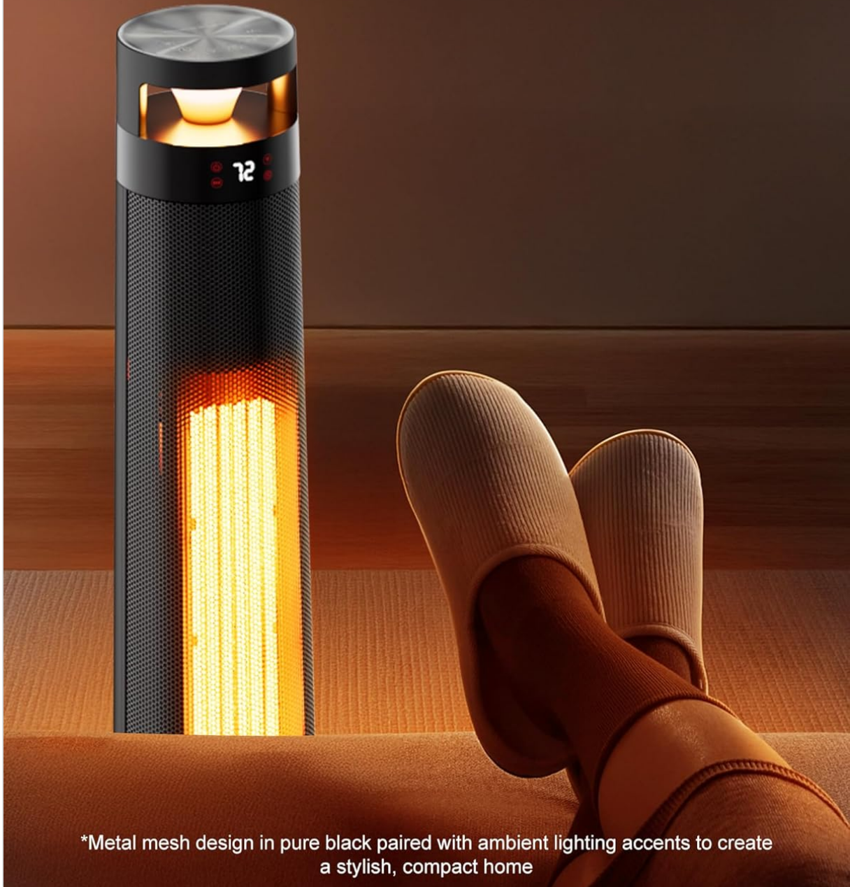
Figure 3: A close-up of the AKIRES heater's top section, highlighting the ambient light. The text 'Luxury Aesthetics' and 'Crafting a Winter Atmosphere Home' are displayed, along with a note about the metal mesh design and lighting accents.