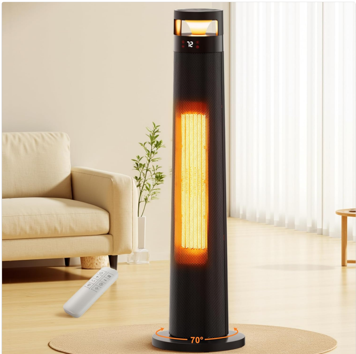
Figure 1: AKIRES 34IN Tower Space Heater. The main unit is black with a mesh design, a digital display at the top, and a remote