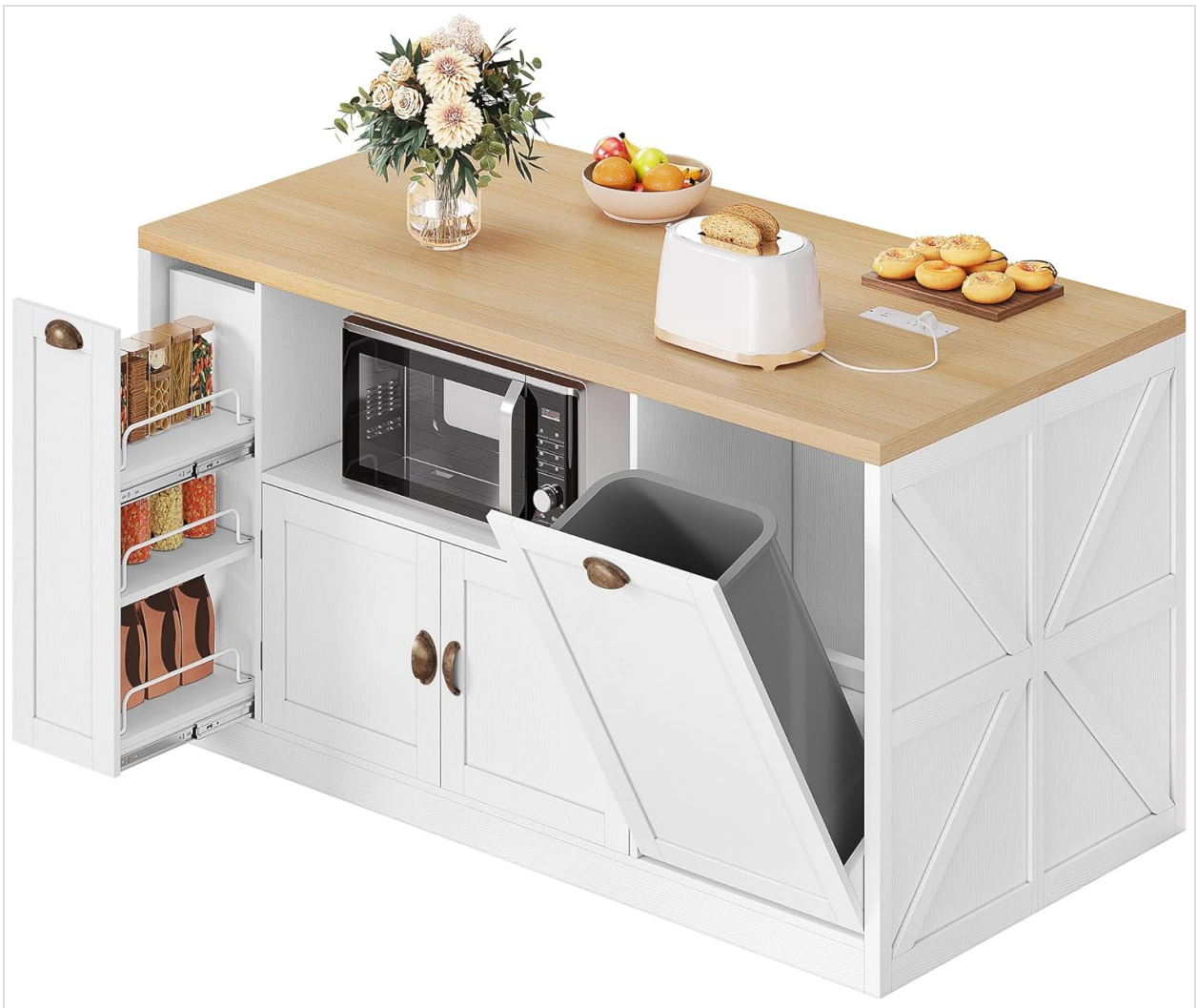
Image: The Homiflex 63-inch Kitchen Island with a microwave, flowers, and food on the countertop.