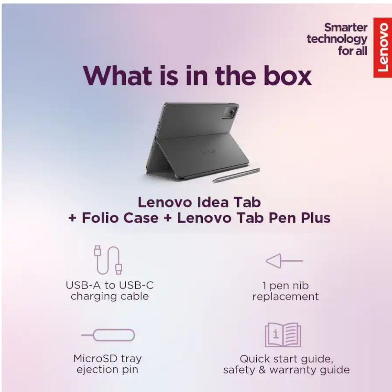
Image: A visual representation of the items included in the Lenovo Idea Tab package, detailing the tablet, folio case, pen, and accessories.