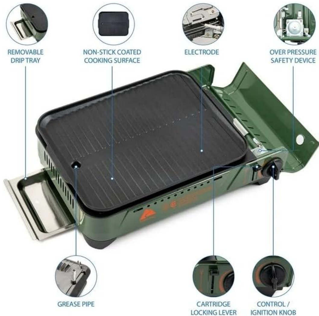
Image 3: Labeled diagram illustrating key components including the removable drip tray, non-stick cooking surface, electrode, over-pressure safety device, grease pipe, cartridge locking lever, and control/ignition knob.