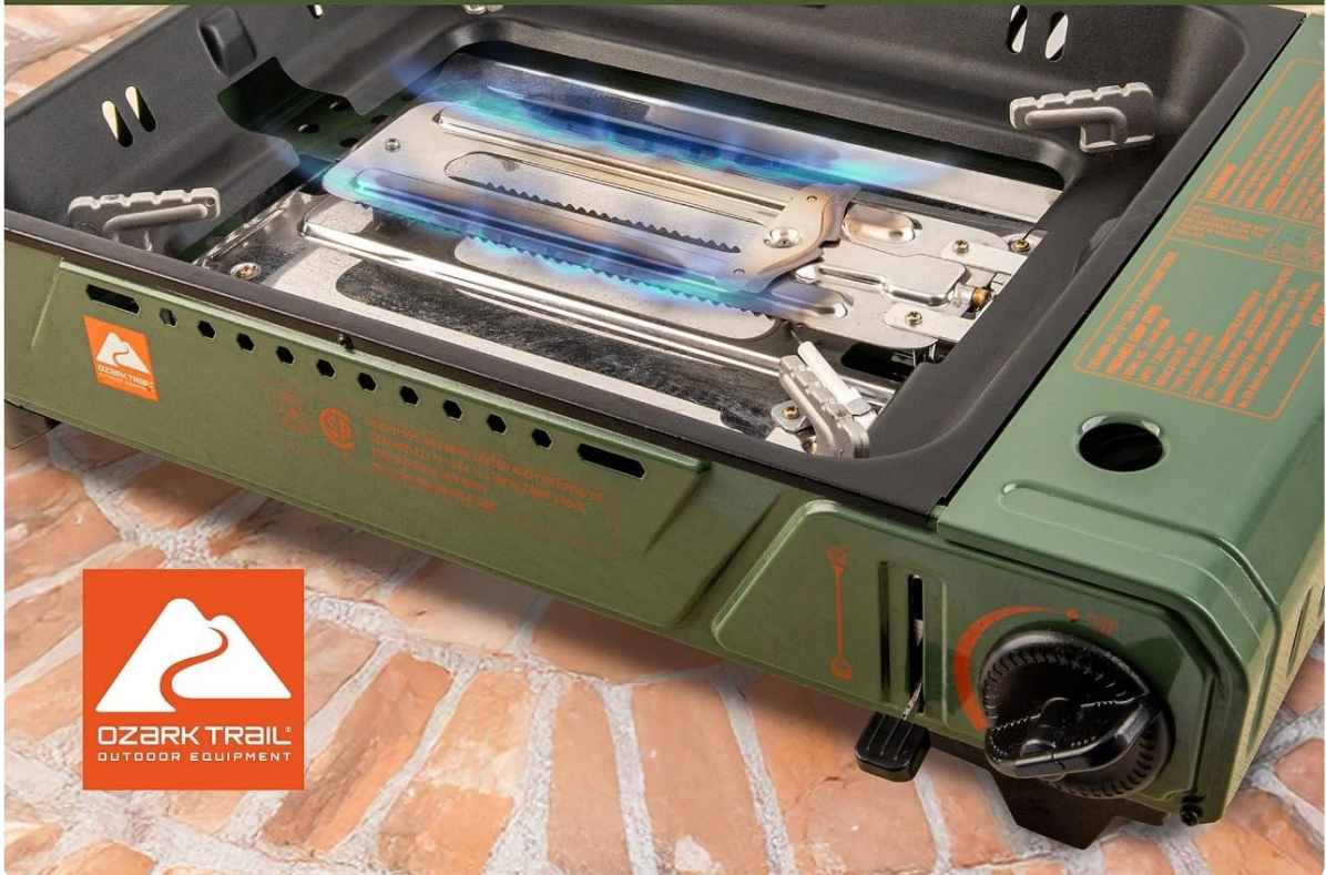
Image 5: A view of the adjustable burner flame, highlighting the 7,650-BTU aluminum burner for controlled heating.