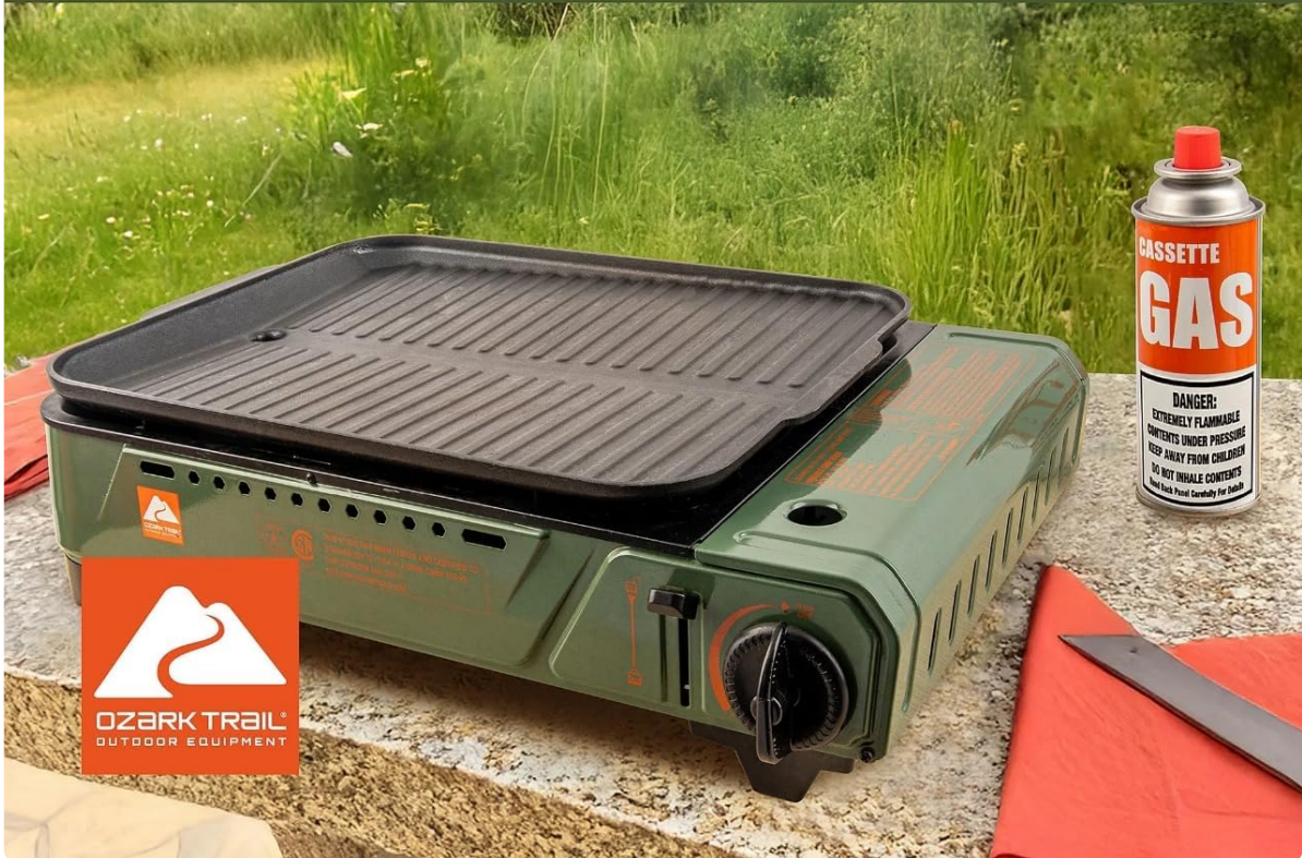
Image 4: The griddle shown with a butane canister, illustrating the type of fuel required for operation.