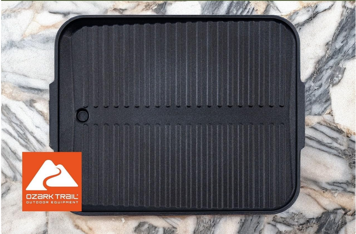
Image 8: A close-up of the 161 square inch non-stick coated cooking surface, designed for easy food release and cleaning.