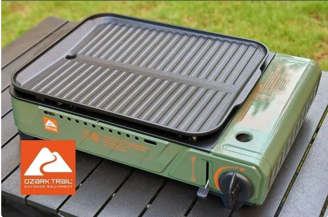
Image 6: The griddle demonstrating its versatile cooking capabilities, suitable for frying, searing, or general cooking.