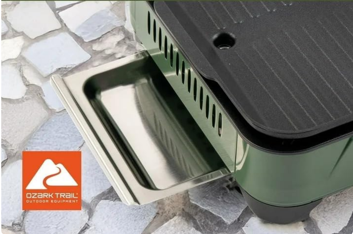
Image 7: The removable drip tray, designed to catch grease and oil for easy cleaning.