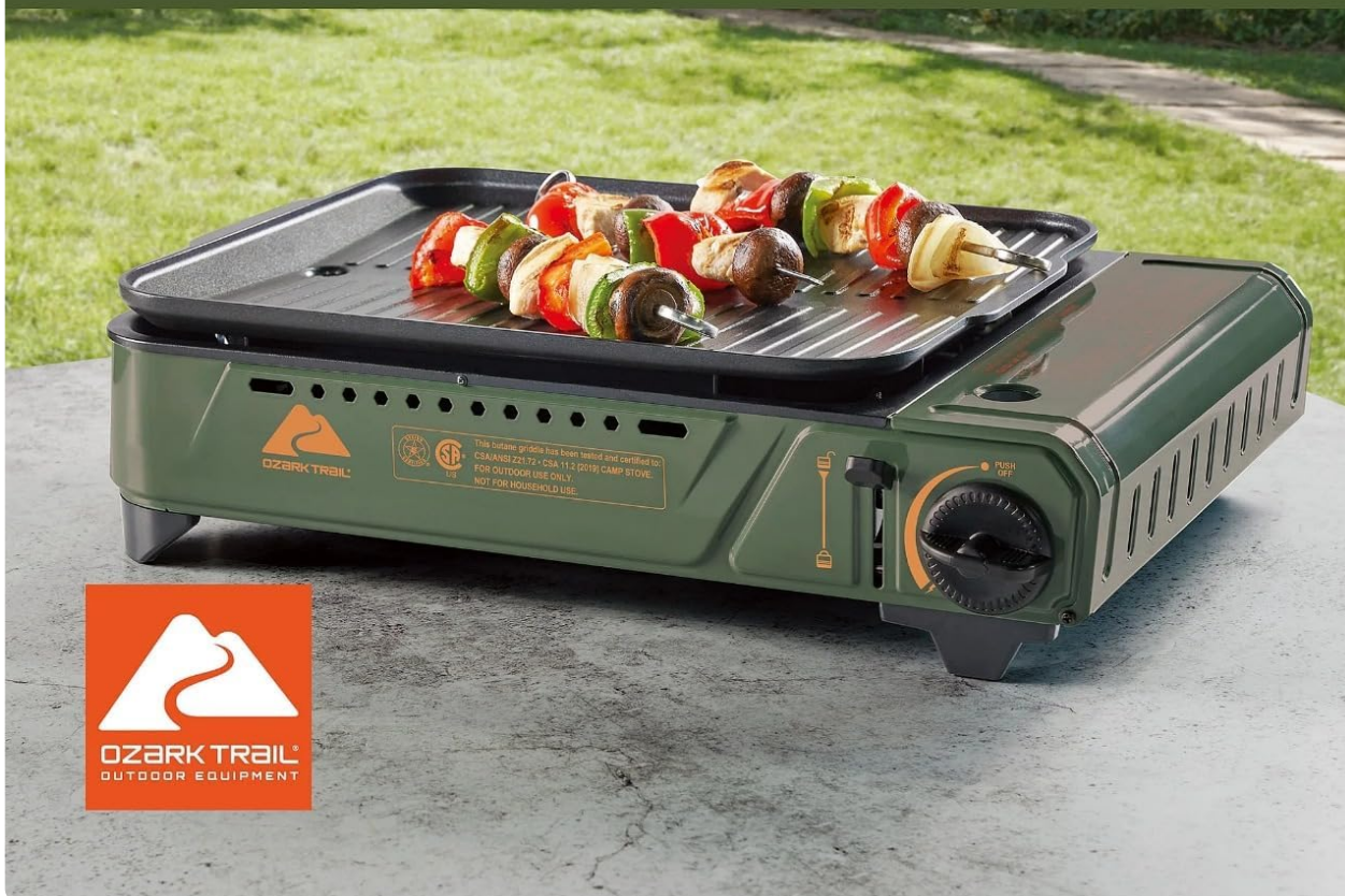
Image 1: The Ozark-Trail Outdoor Butane Griddle Grill in use, demonstrating its compact and sturdy design for outdoor cooking.