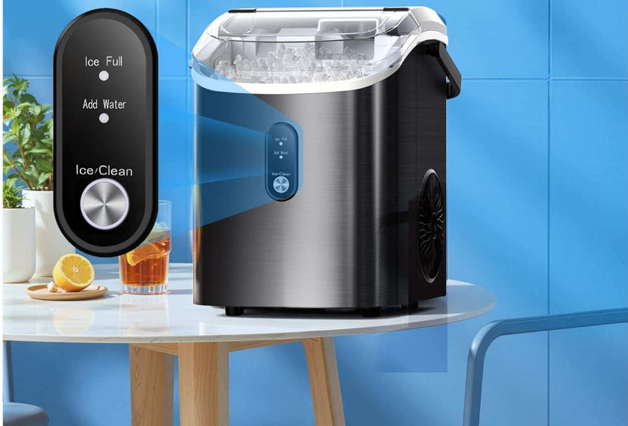
Figure 5.2: The intuitive one-touch control panel.