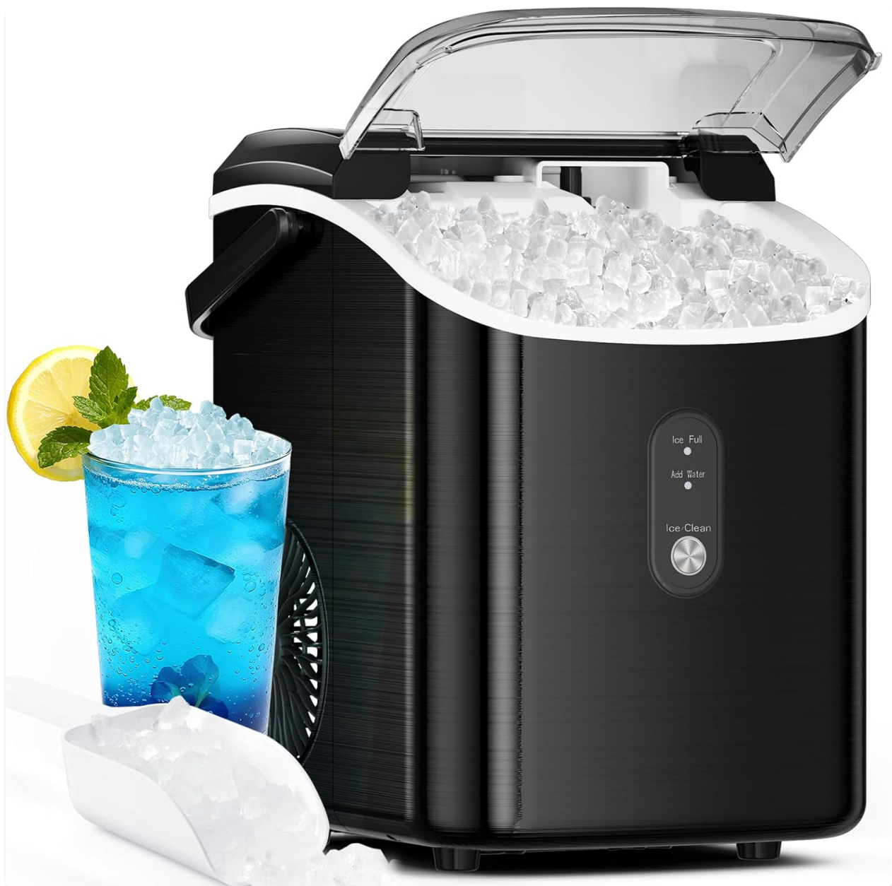
Figure 3.1: Electactic Nugget Ice Maker with its components.