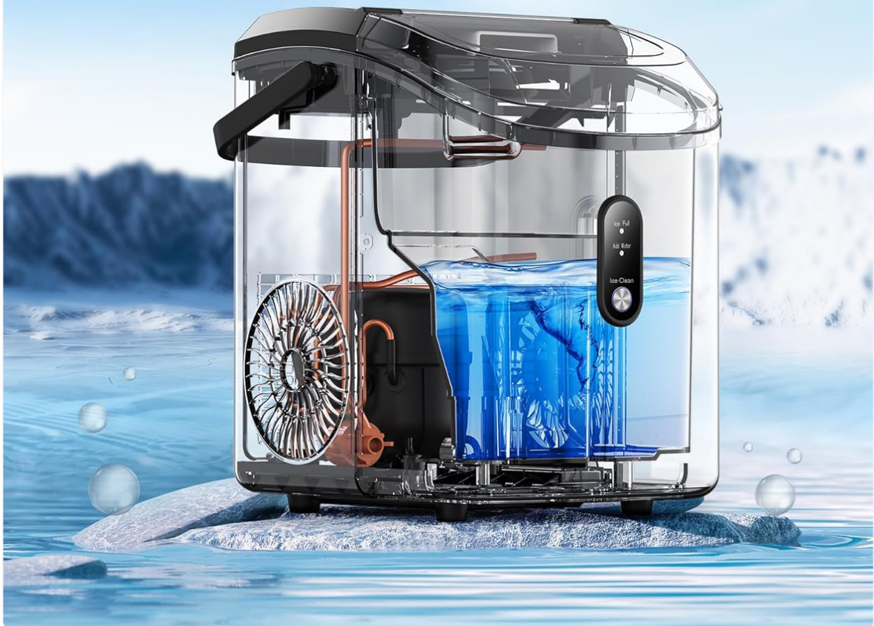
Figure 6.1: The automatic cleaning process in action.