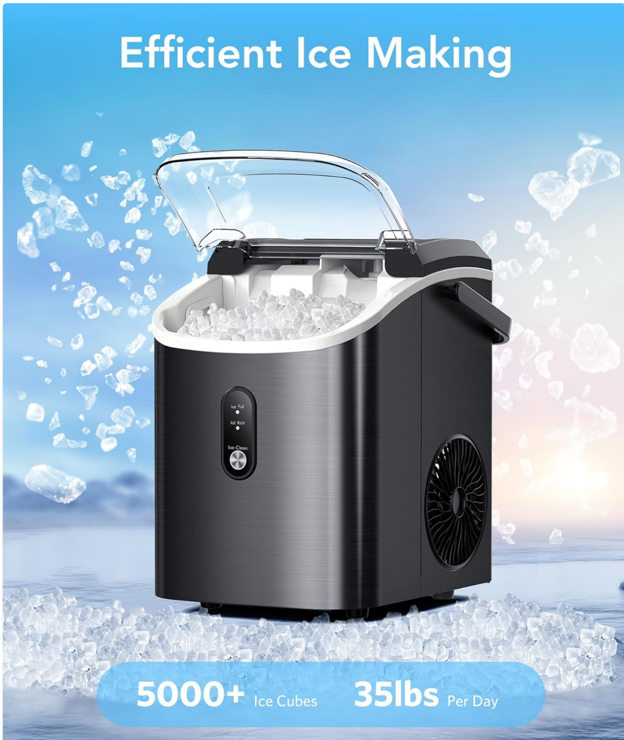
Figure 5.1: The ice maker's efficient production capabilities.