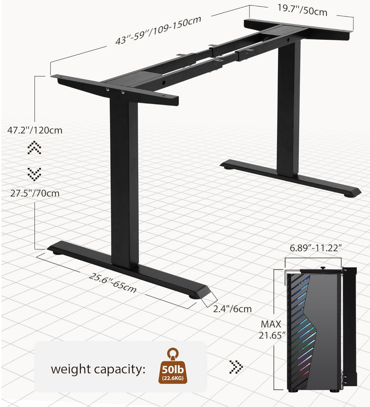
Image: Technical diagram illustrating the adjustable height range (27.5"-47.2") and width (43"-59") of the desk frame.