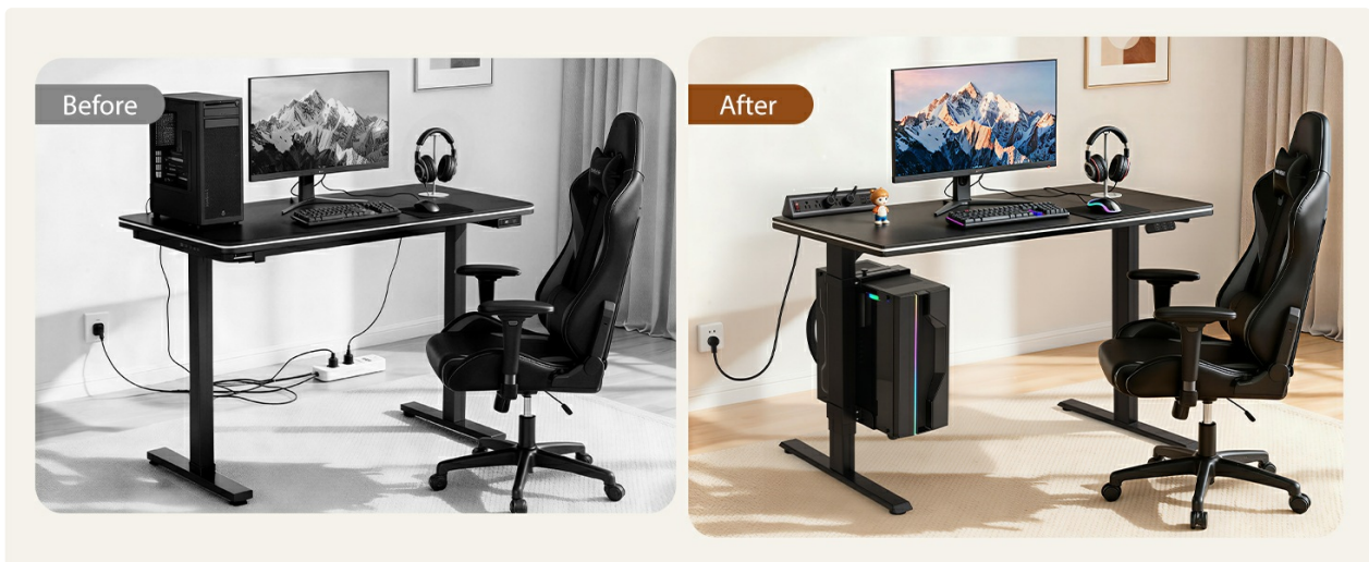
Image: Adjustable Under-Desk PC Mount attached to the desk leg, holding a computer tower.

The adjustable under-desk PC mount helps save space and protect your computer. No drilling is required for installation.