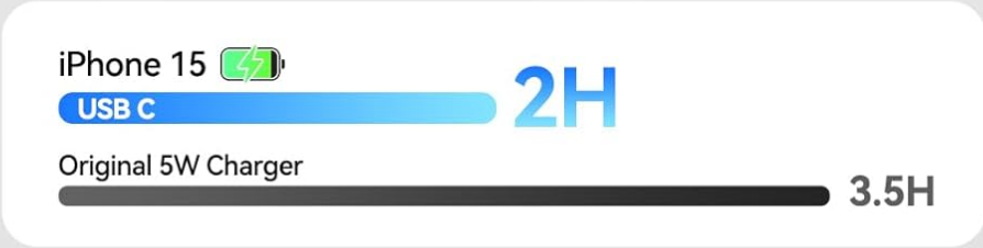
Image: Illustration of the fast charging capabilities of the ORICO Power Strip Tower, showing 20W USB-C and 18W USB-A outputs, capable of charging an iPhone 15 in 2 hours compared to 3.5 hours with a standard 5W charger.