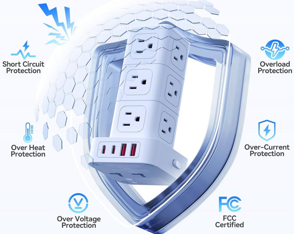
Image: Diagram highlighting the multiple safety protections of the ORICO Power Strip Tower, including 1080J surge protection, short circuit protection, overload protection, over-heat protection, over-current protection, and over-voltage protection, with FCC certification.