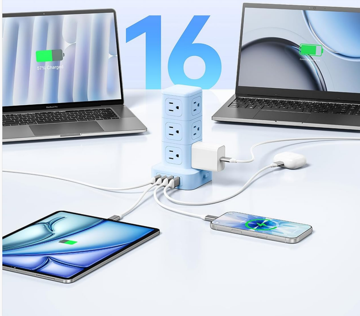
Image: The ORICO Power Strip Tower providing power to 16 devices simultaneously, including laptops, tablets, and smartphones, via its 12 AC outlets, 2 USB-C ports, and 2 USB-A ports.