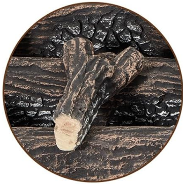
7 Handcrafted Ceramic Logs