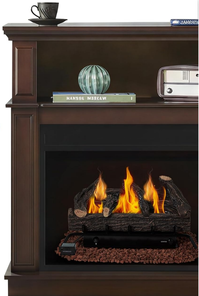
Image: Close-up view of the EROMMY fireplace logs set, highlighting the natural appearance of the handcrafted ceramic logs and the strengthened steel grate.