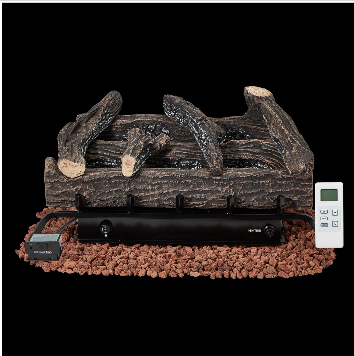
Image: The EROMMY 27 Inch Ventless Fireplace Logs Set with remote control and lava rock, ready for use in a fireplace setting.