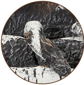
7 Handcrafted Ceramic Logs