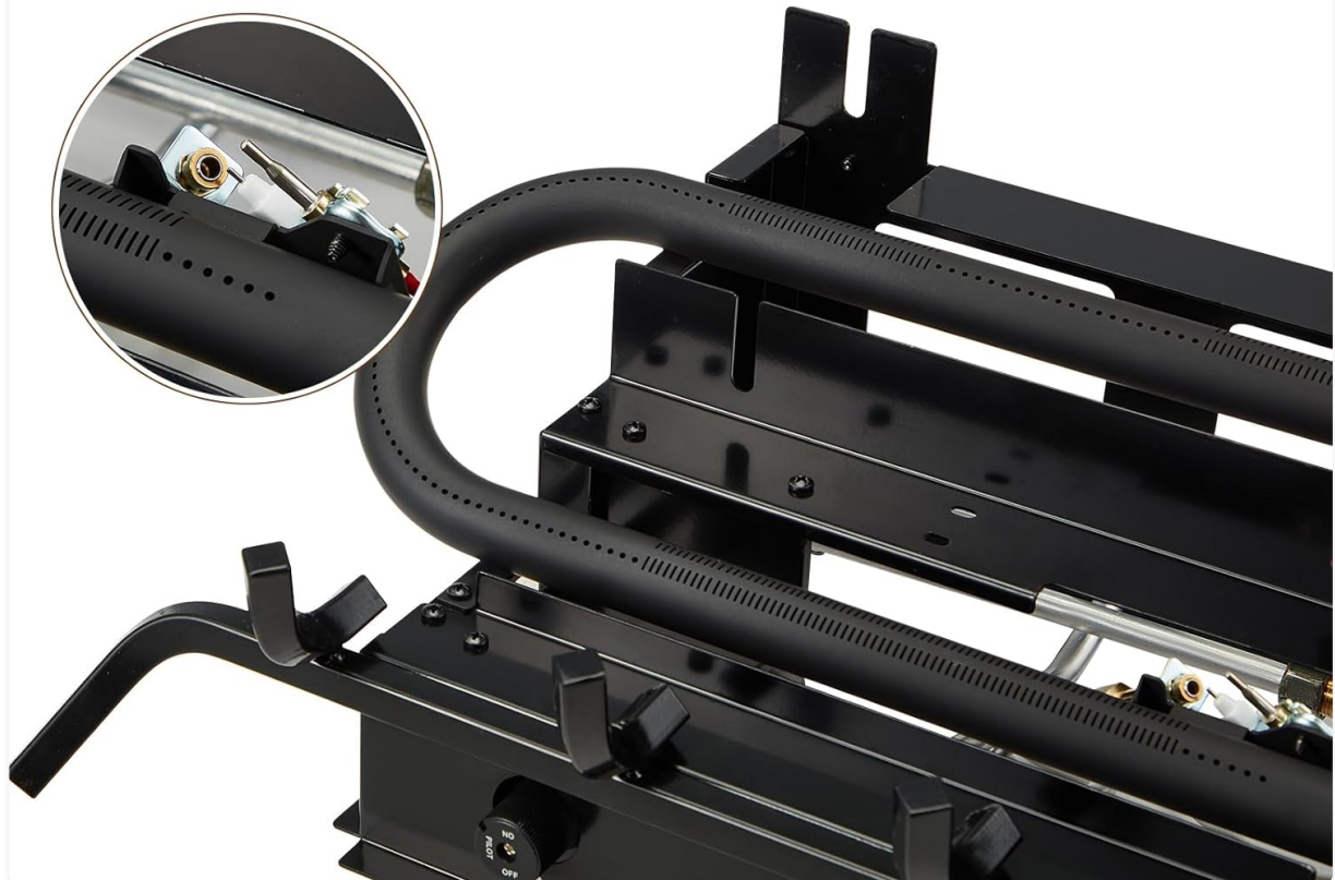
Image 3.1: Visual representation of the main components included in the package.