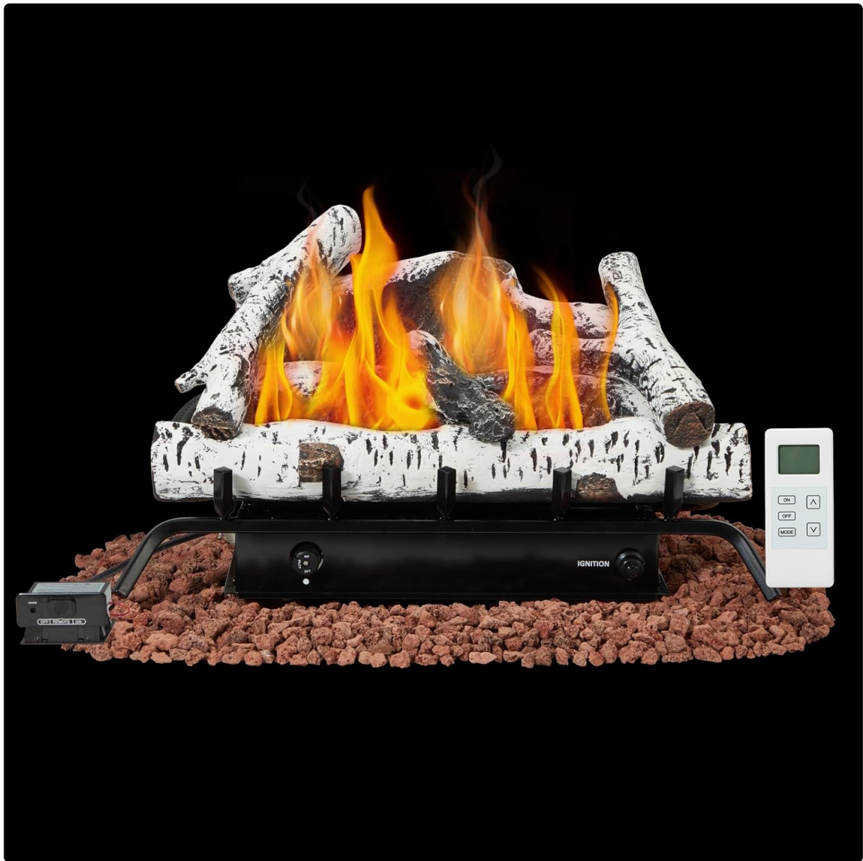
Image 1.1: The EROMMY 24 Inch Ventless Natural Gas Fireplace Logs Set, including the burner assembly, ceramic logs, lava rocks, and remote control.