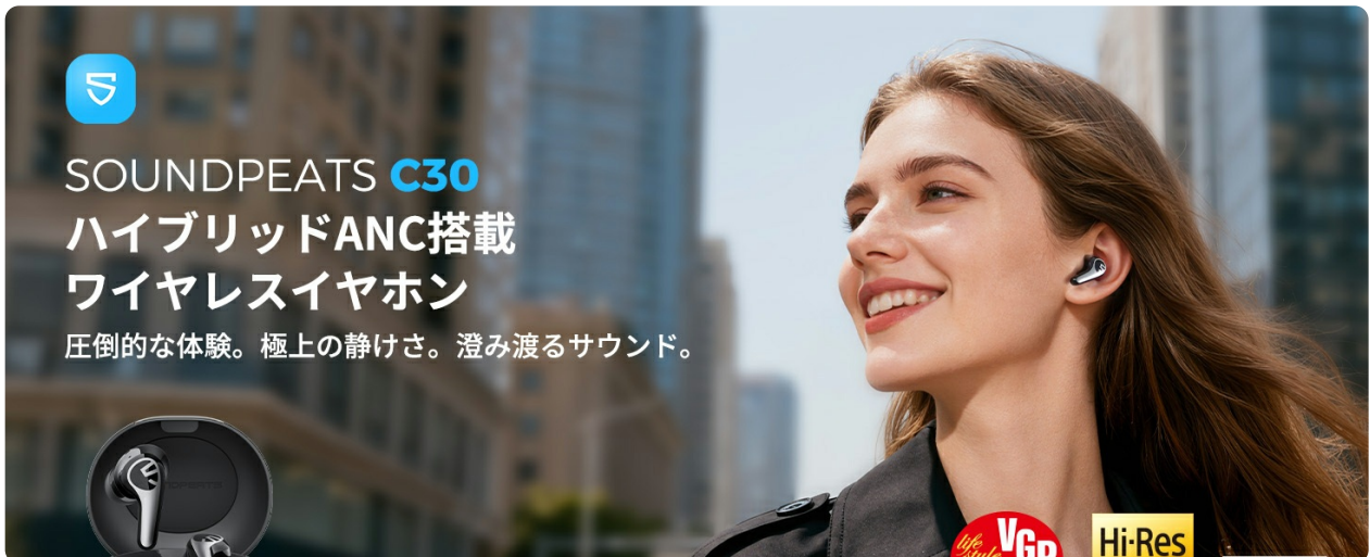
Image: Overview of SOUNDPEATS C30 earphones showcasing key features like Hybrid ANC, 12mm driver, 6 mics, Bluetooth 6.0, 52-hour playback, IP54, and app support.

The SOUNDPEATS C30 Hybrid ANC Wireless Earphones offer an immersive audio experience with advanced noise cancellation and high-resolution sound. This manual provides essential information for optimal use.