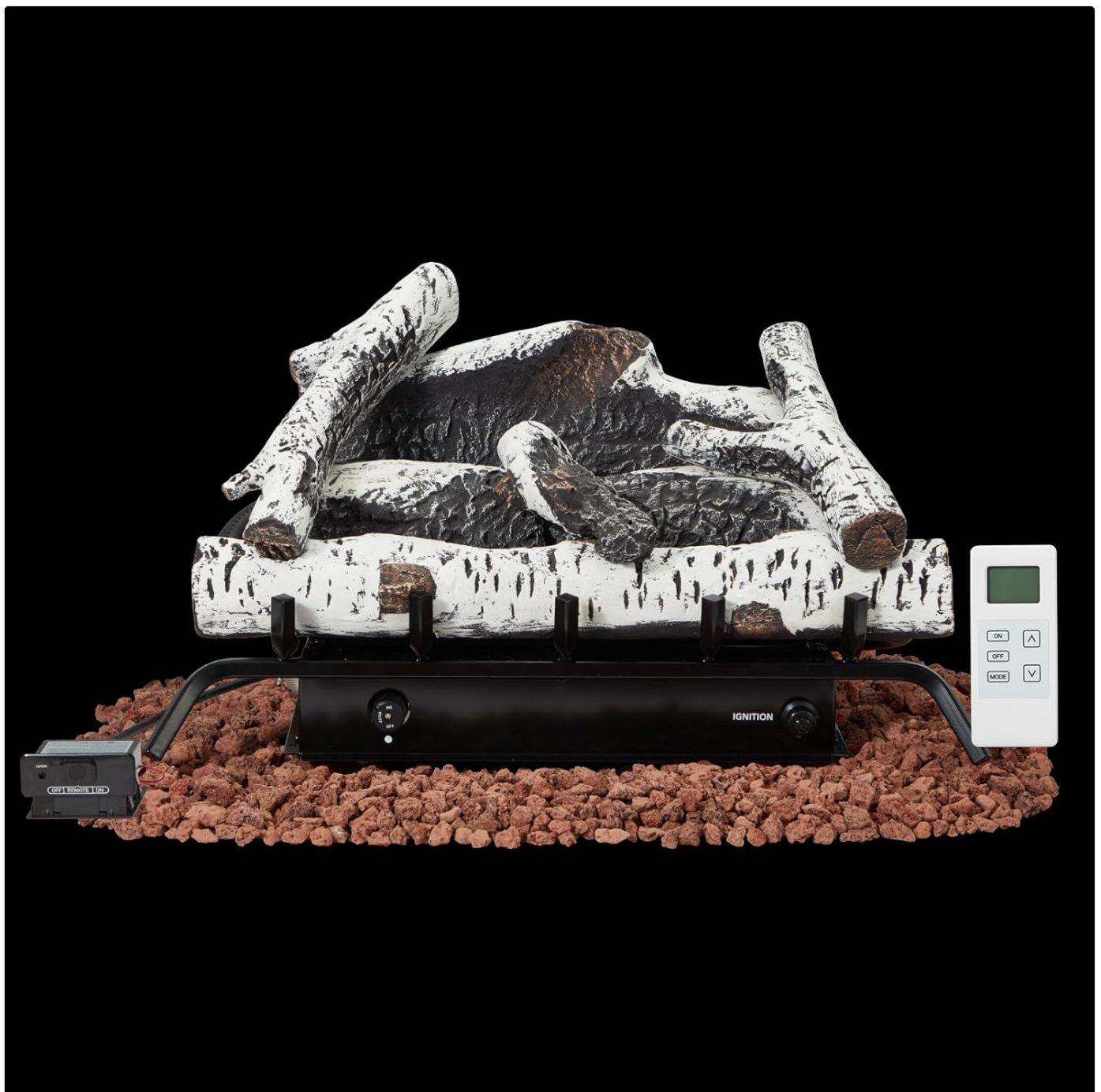
Image 3.5: Illustration of connecting the receiver to the main fireplace unit, ensuring the receiver is in the OFF position.