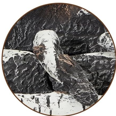
7 Handcrafted Ceramic Logs