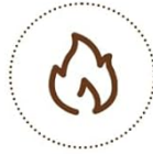
Handcrafted Ceramic Logs