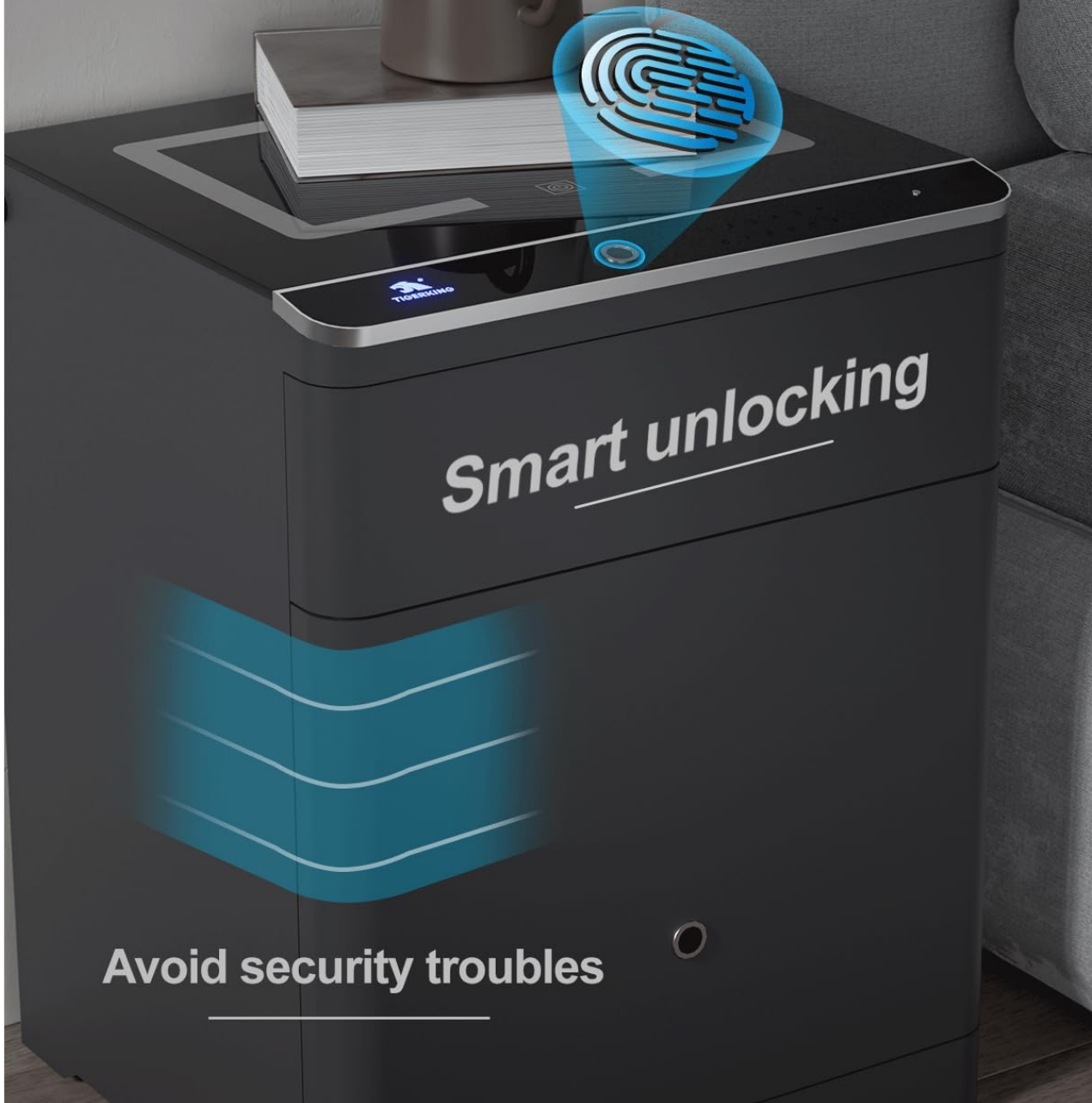
Image: Close-up of the biometric fingerprint sensor on the safe's top panel, highlighting the smart unlocking feature.