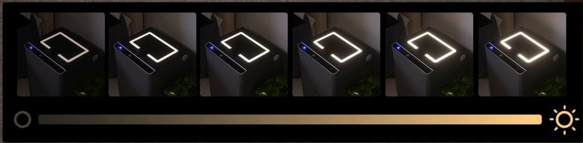
Image: Demonstrates the three adjustable lighting modes (cool white, neutral, warm white) and the brightness adjustment slider on the safe's top panel.