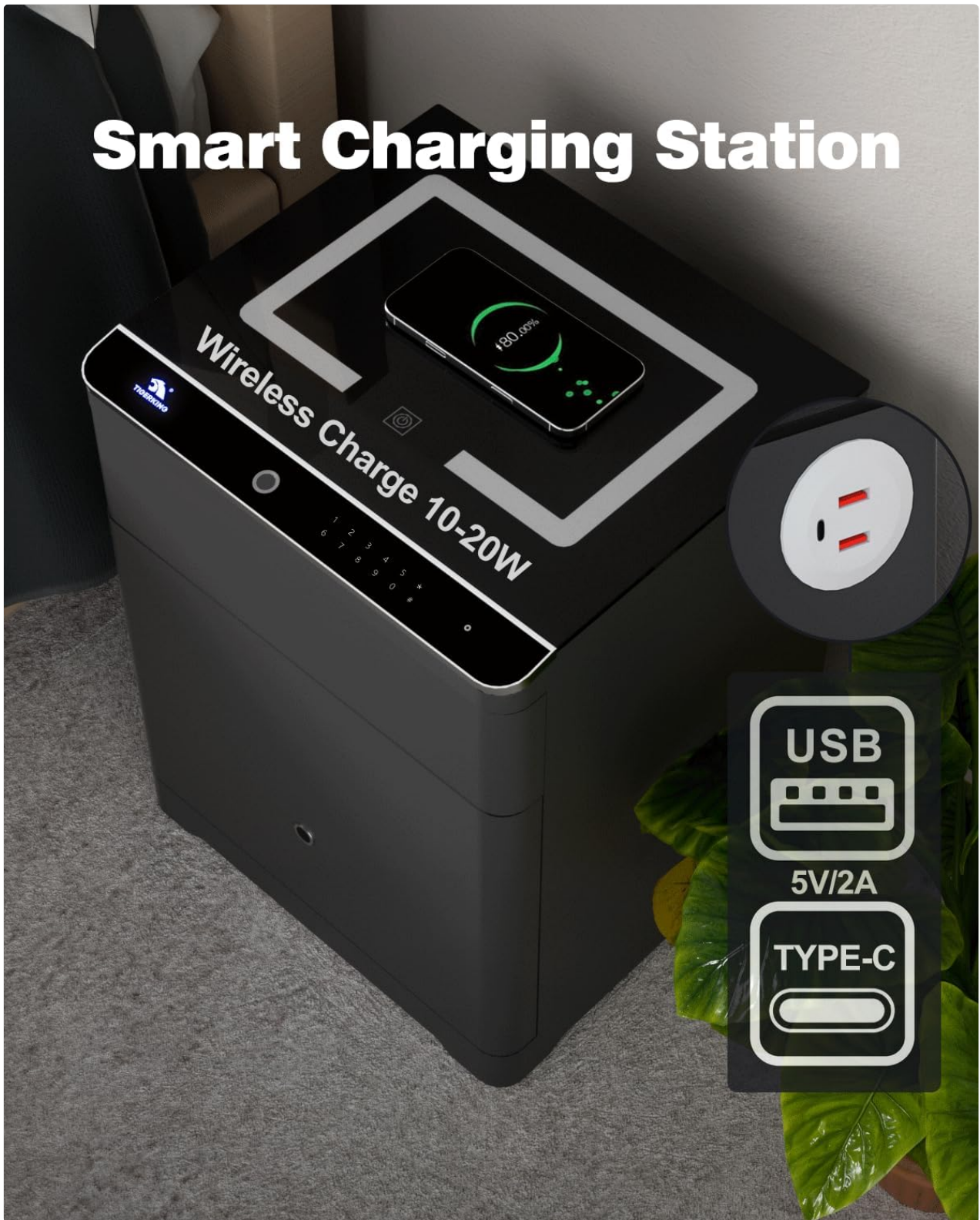
Image: The smart charging station on the safe's top surface, showing a phone wirelessly charging, along with USB and Type-C ports.