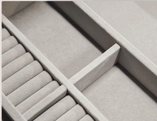
Soft and comfortable velvet

Resist moisture and protect jewelry from damage