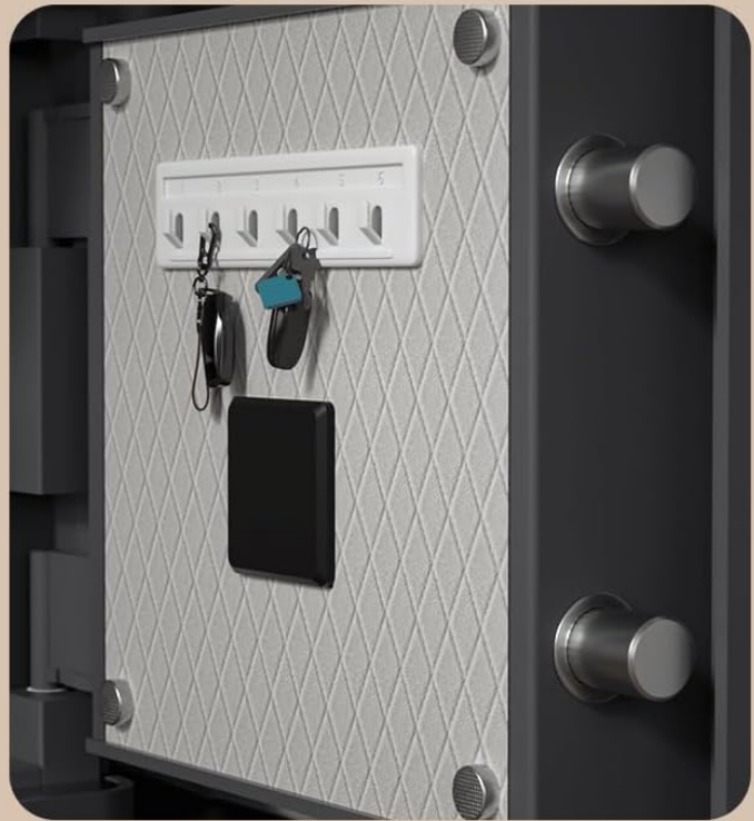
Image: Shows the hidden secret compartment at the bottom of the main safe and the small hooks on the inside of the safe door for keys or other small items.