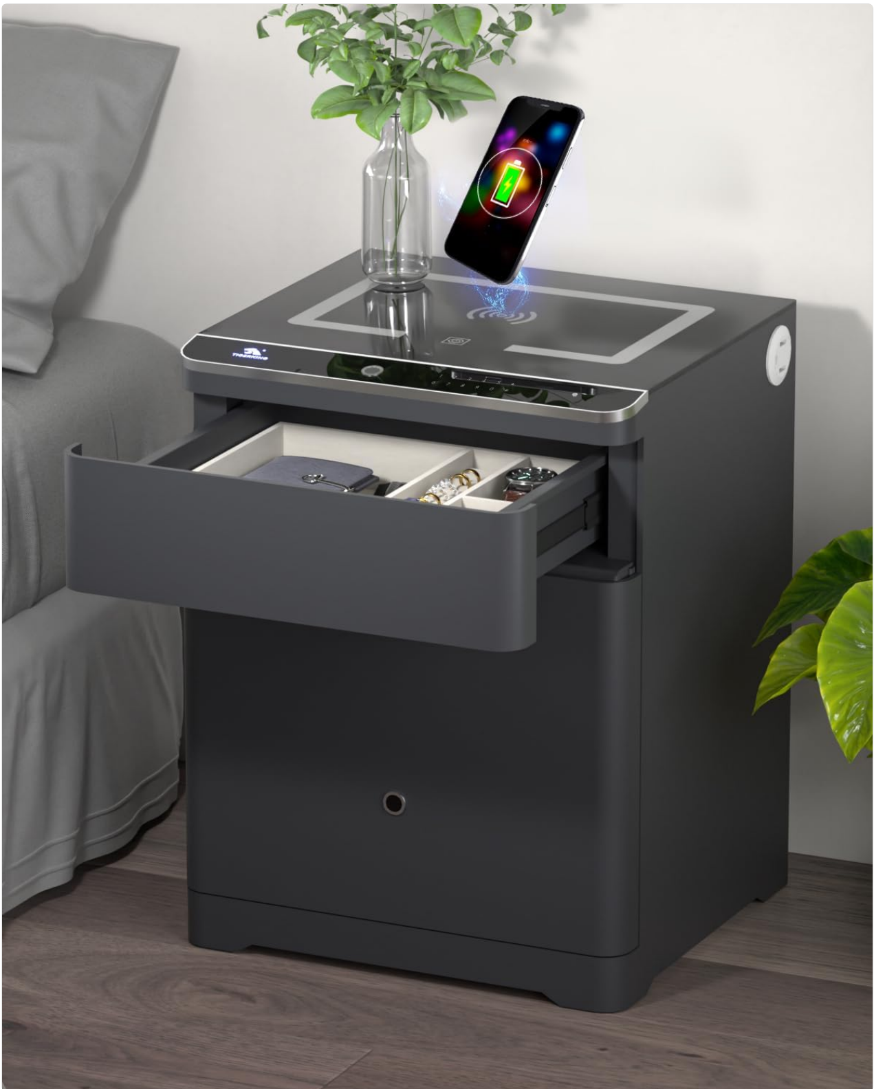
Image: The TIGERKING G-Wireless Charging 3-in-1 Biometric Heavy Duty Safe, showcasing its sleek design and integrated features.