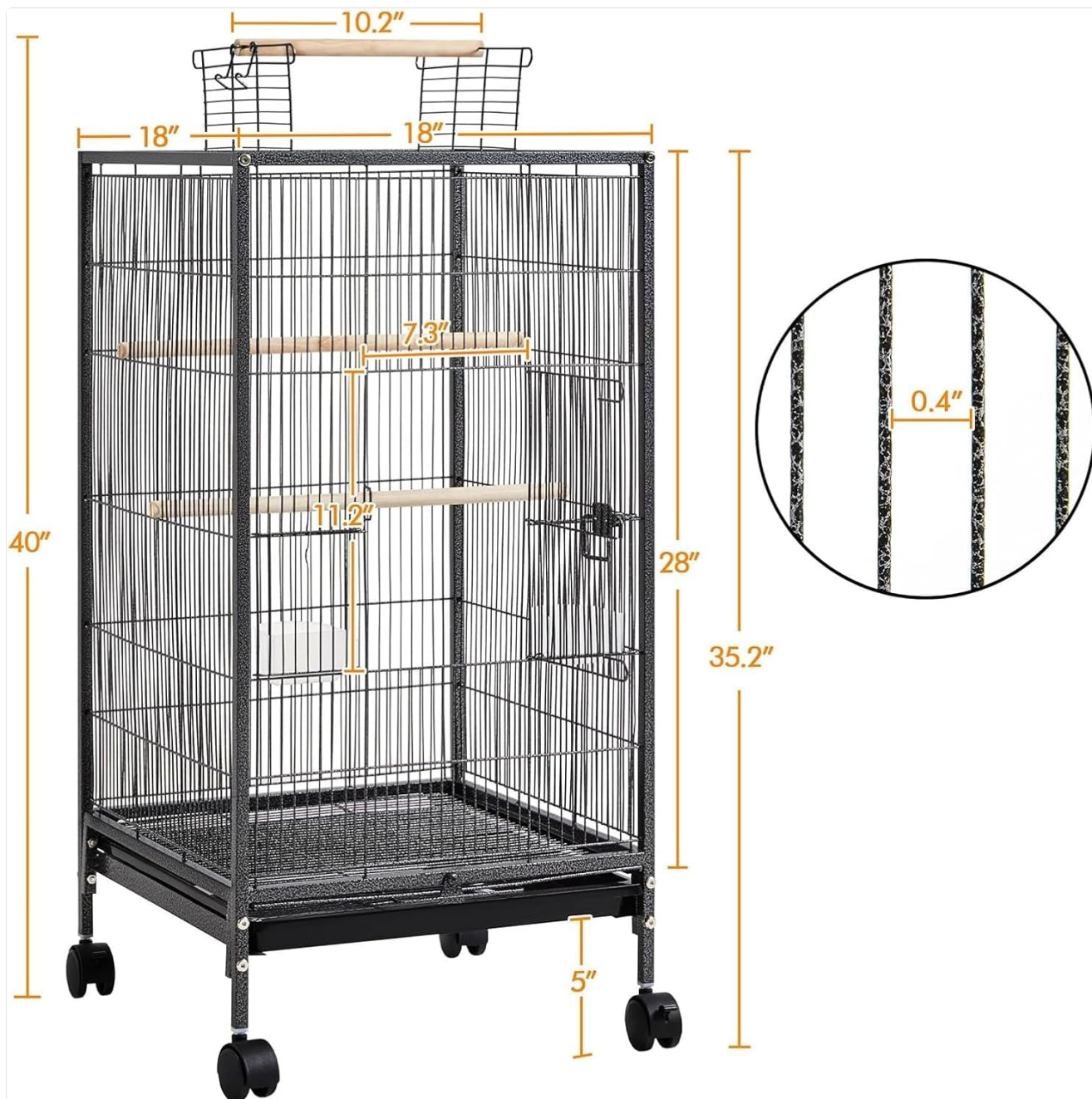
Image: Detailed diagram showing the dimensions of the Garvee 40 Inch Bird Cage, including height, width, and bar spacing.