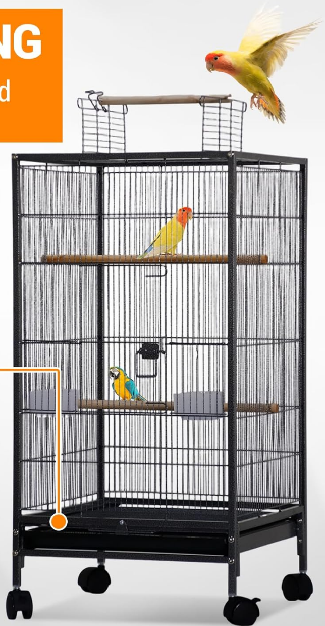
Image: The Garvee 40 Inch Bird Cage demonstrating the easy-to-clean slide-out bottom tray.