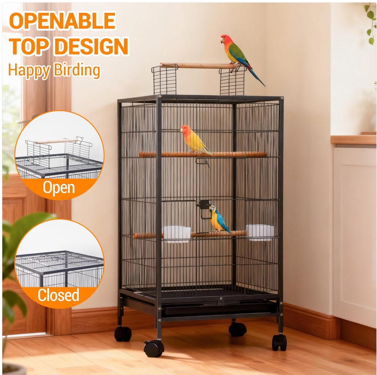
Image: Garvee 40 Inch Bird Cage showcasing its openable top design. The image highlights the cage's overall structure and the functionality of the top opening.

Carefully unpack all components and verify against the parts list in your manual. Ensure all pieces are present and undamaged before proceeding.