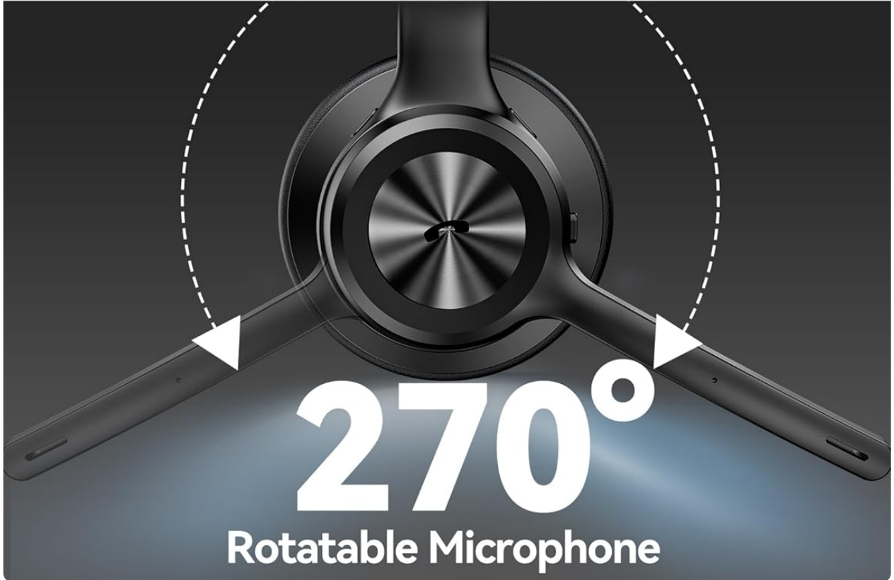
Figure 3: The headset featuring a 270-degree rotatable microphone for flexible positioning and an easily accessible mute button.