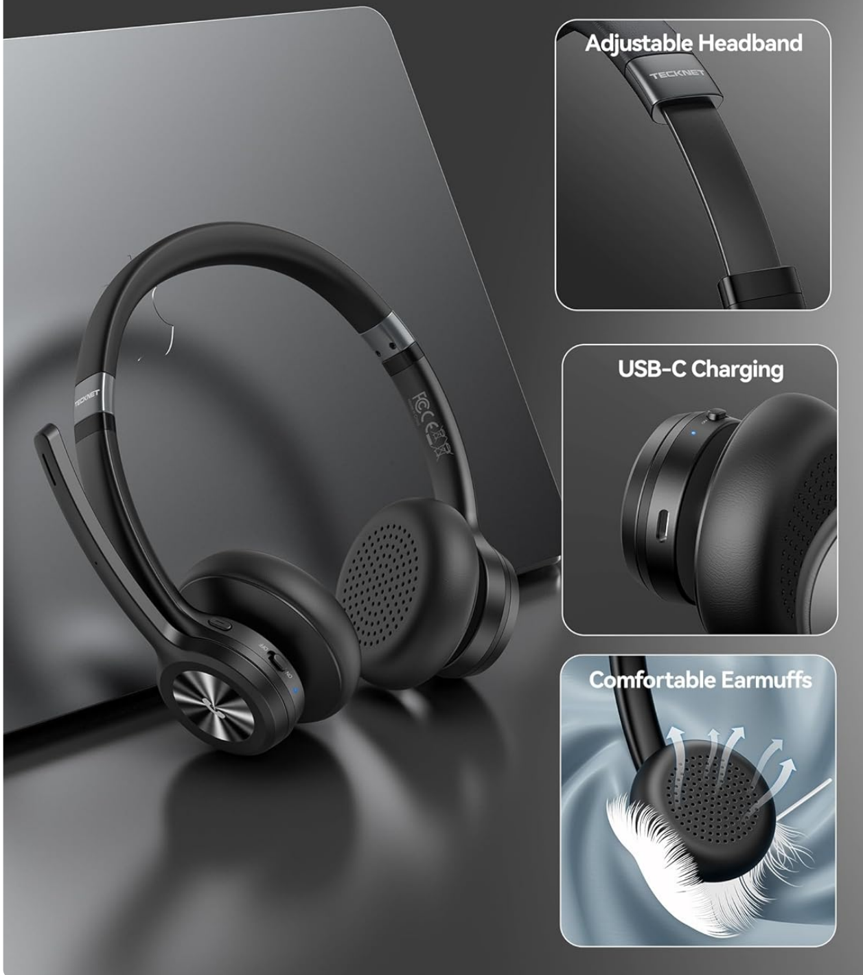
Figure 2: Close-up of the headset highlighting its adjustable headband, USB-C charging port, and comfortable earmuffs designed for extended wear.