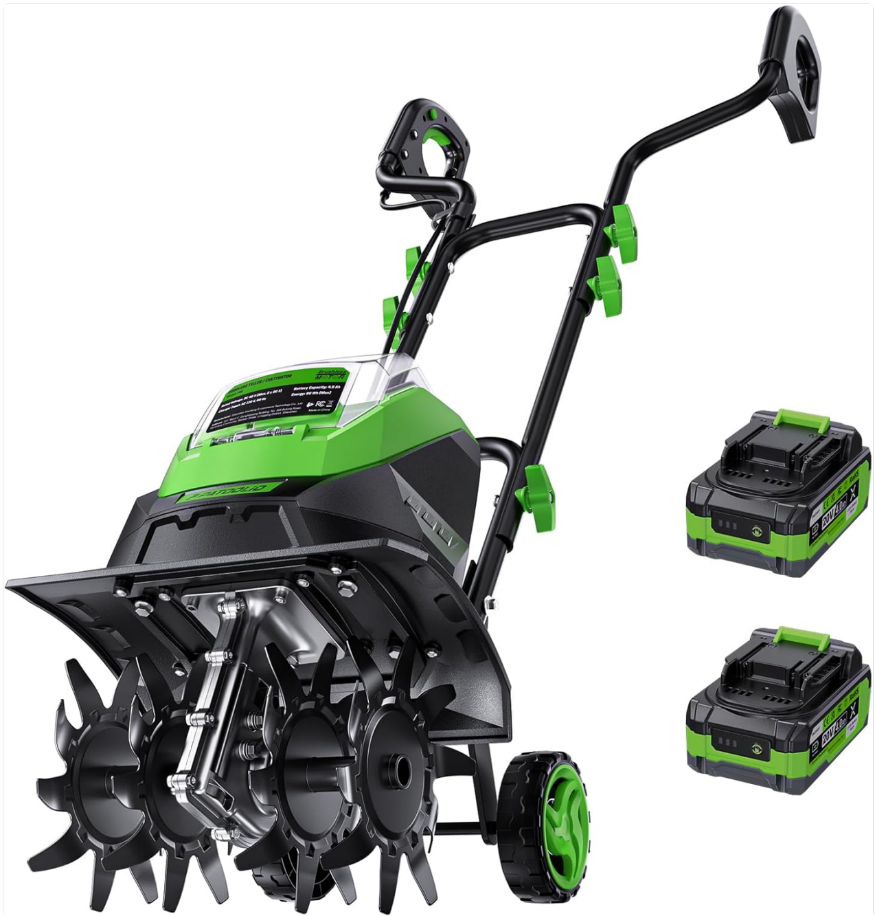
Figure 6: Wide Tilling Coverage

This image shows the tiller in action, highlighting its 14-inch tilling width and 8.7-inch depth capability.