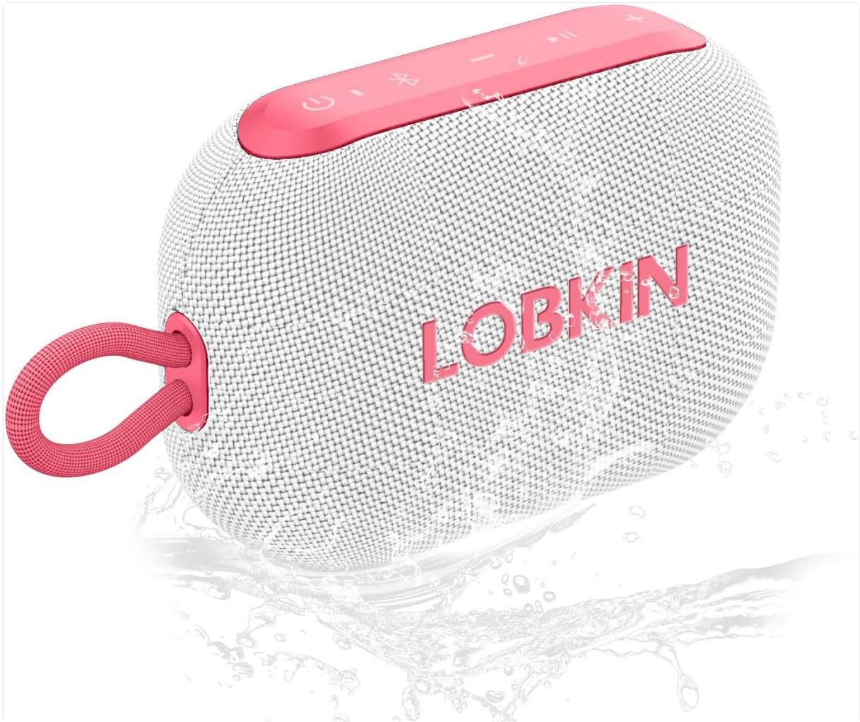
Image: The LOBKIN Portable Bluetooth Speaker 4GO, featuring a white fabric grille and pink control panel, demonstrating its waterproof capability with water splashes.