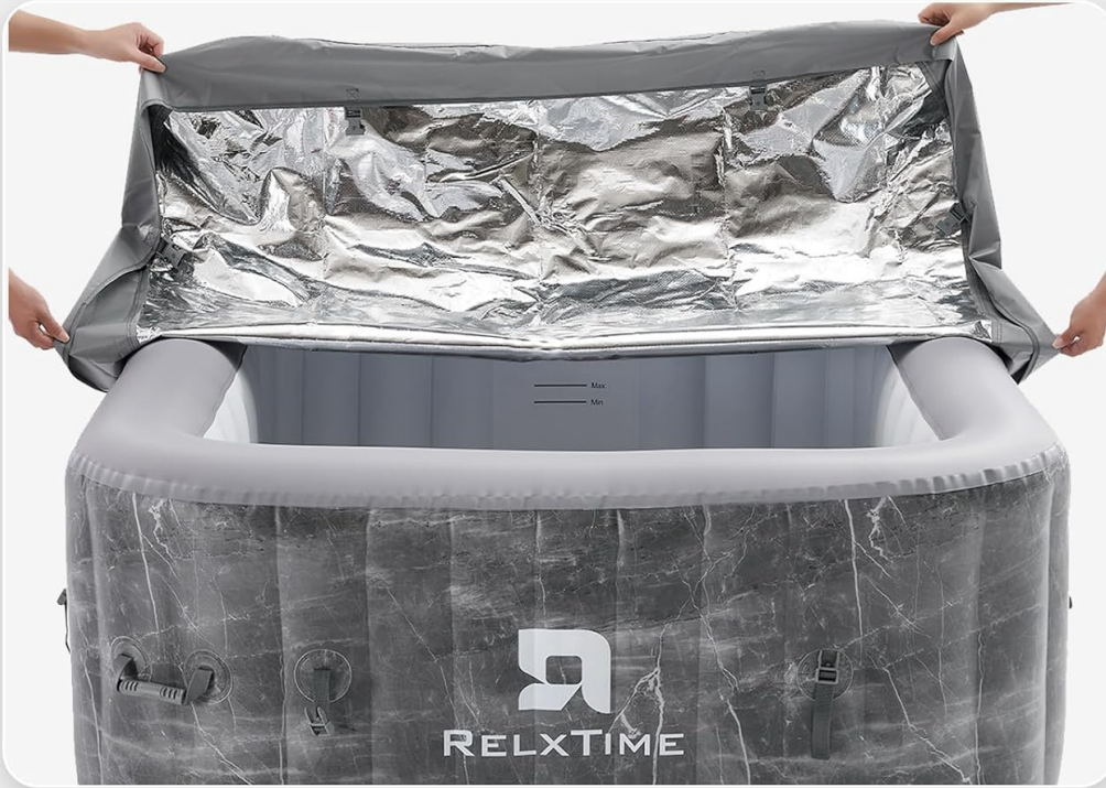
Image: Hot tub with its insulated cover for thermal retention.