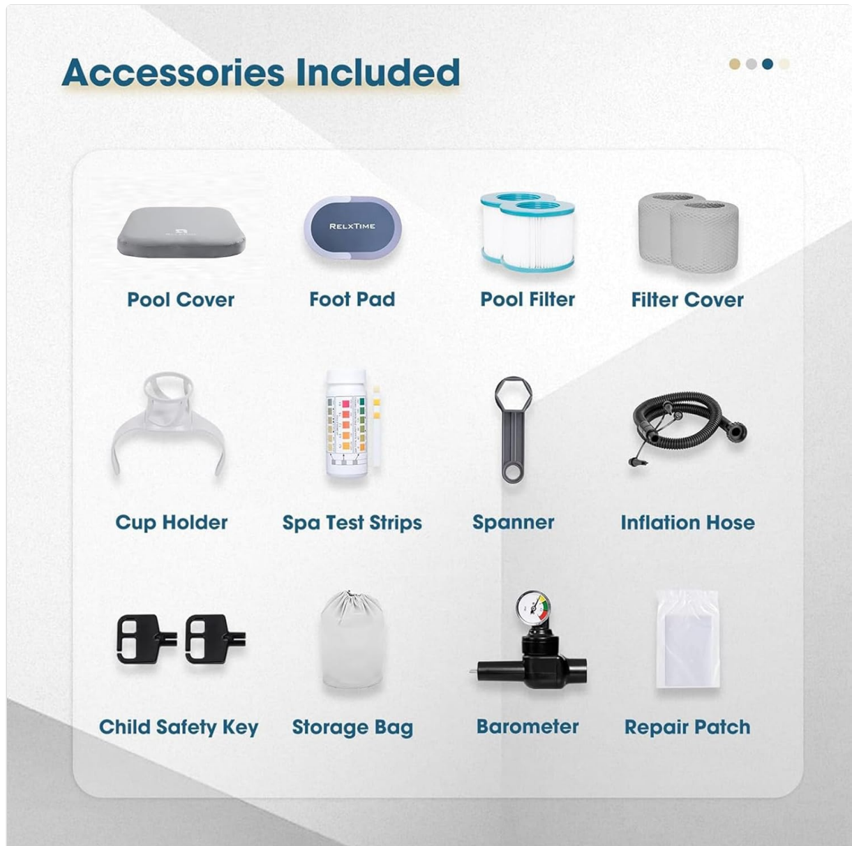
Image: Product information and dimensions.