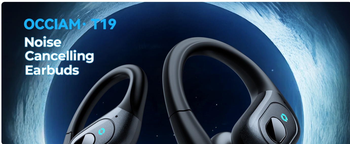
Image: occiam T19 Active Noise Cancelling Earbuds with charging case.

The occiam T19 Active Noise Cancelling Earbuds are designed to provide a high-quality audio experience with enhanced comfort and durability. Featuring active noise cancellation, these wireless Bluetooth headphones are suitable for various activities including work, sports, and running. The earbuds come with over-ear hooks for a secure fit and are IPX7 waterproof, making them resistant to sweat and splashes.