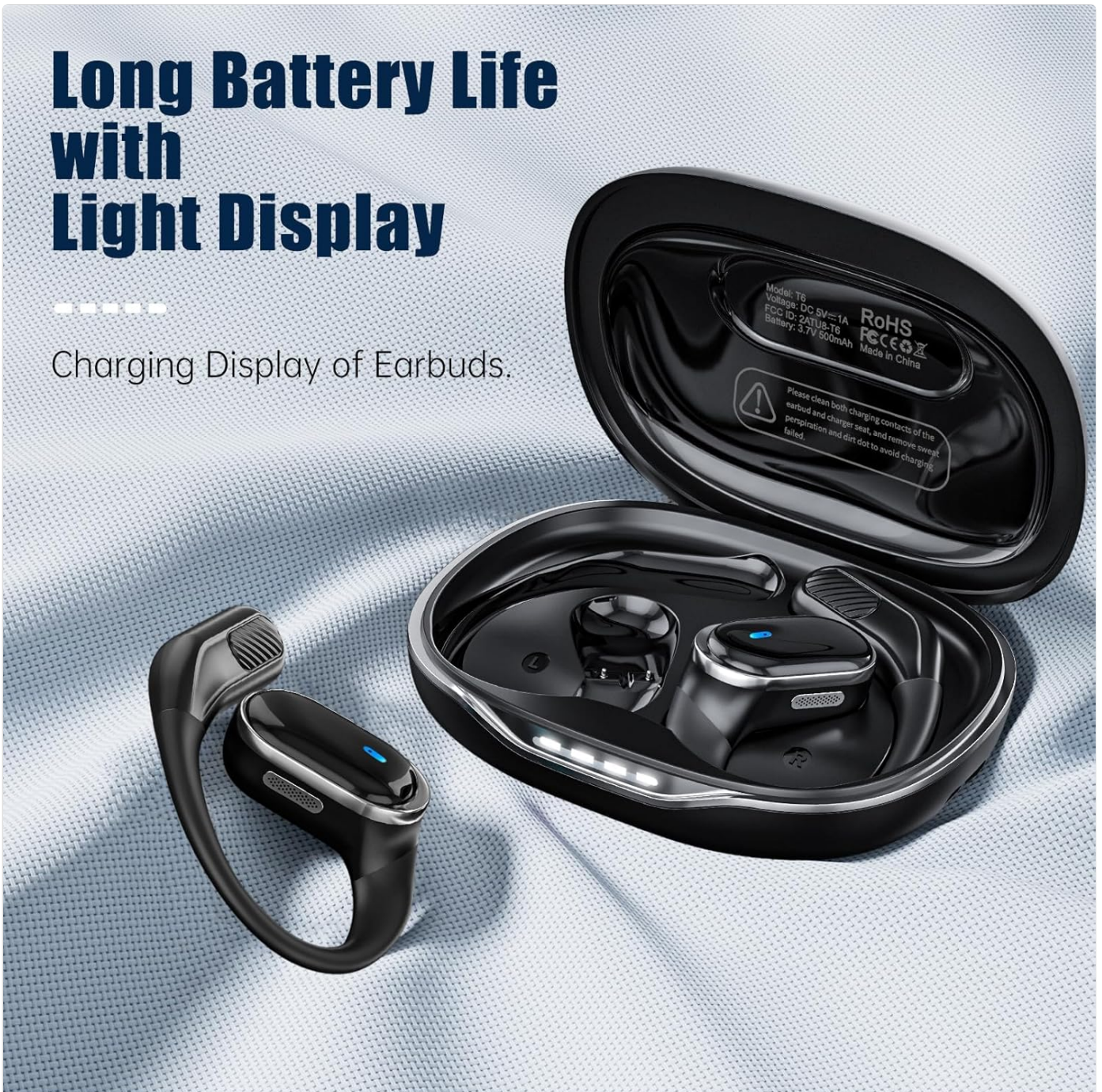
Image: The TRAUSI T6 charging case displaying battery life indicators, with an earbud placed inside.