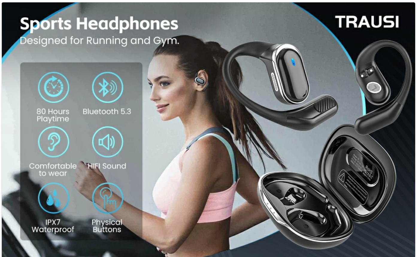
Image: Overview of TRAUSI T6 sports headphones features, including 80 hours playtime, Bluetooth 5.3, comfortable wear, HiFi sound, IPX7 waterproof, and physical buttons.