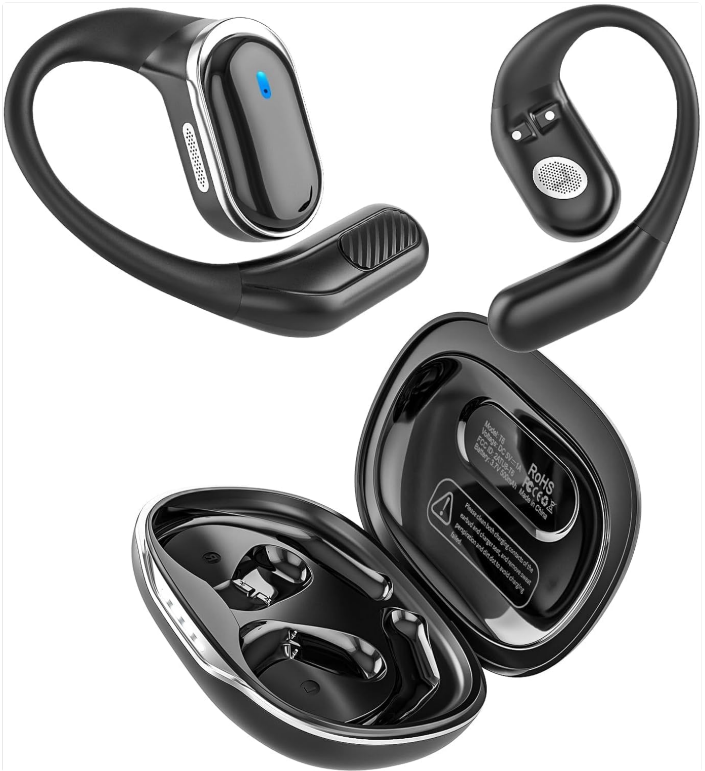
Image: The TRAUSI T6 Open Ear Wireless Earbuds shown with their charging case, highlighting the design and components.