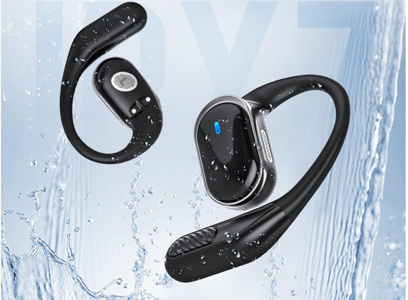
Image: The TRAUSI T6 earbuds shown with water splashing, illustrating their IPX7 waterproof and sweat-resistant capabilities.

Thanks to its advanced IPX7 water resistance, the HD65 wireless earbuds can withstand exposure to sweat and rain without any damage, making them the perfect companion for sports.