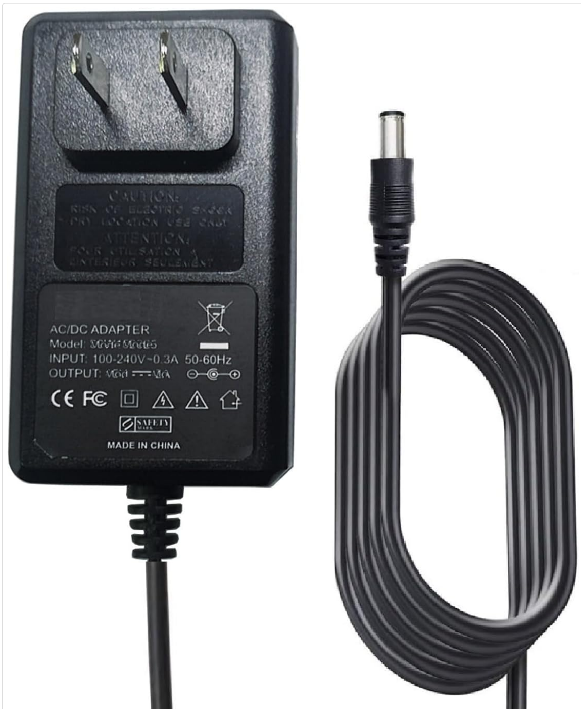
Figure 2.1: The eeTao HL-36000500 36V Charger. This image displays the charger unit with its standard US two-prong plug and the DC barrel connector cable.