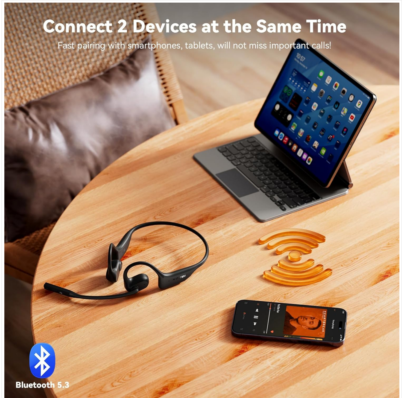
Image 2: NOUUI NU-HS012 Headphones demonstrating dual connection. The headphones are shown wirelessly connected to both a smartphone and a tablet, illustrating the ability to pair with two devices simultaneously.

Note: The effective Bluetooth range is up to 15 meters (49 feet).