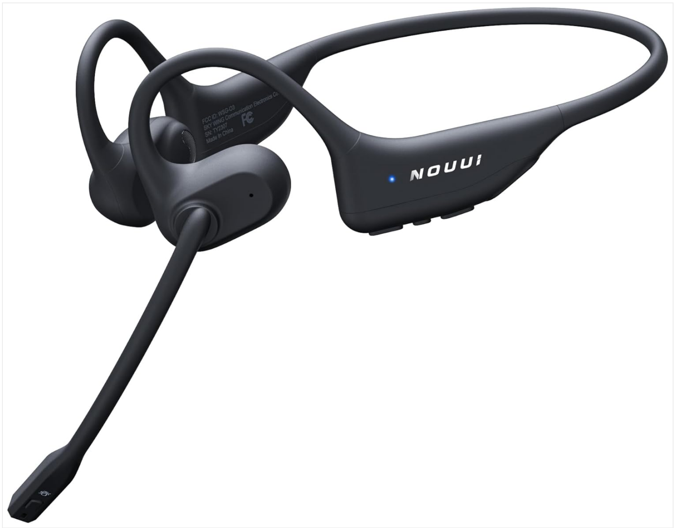
Image 1: NOUUI NU-HS012 Open Ear Headphones. This image displays the overall design of the headphones, highlighting the open-ear hooks and the adjustable microphone boom.