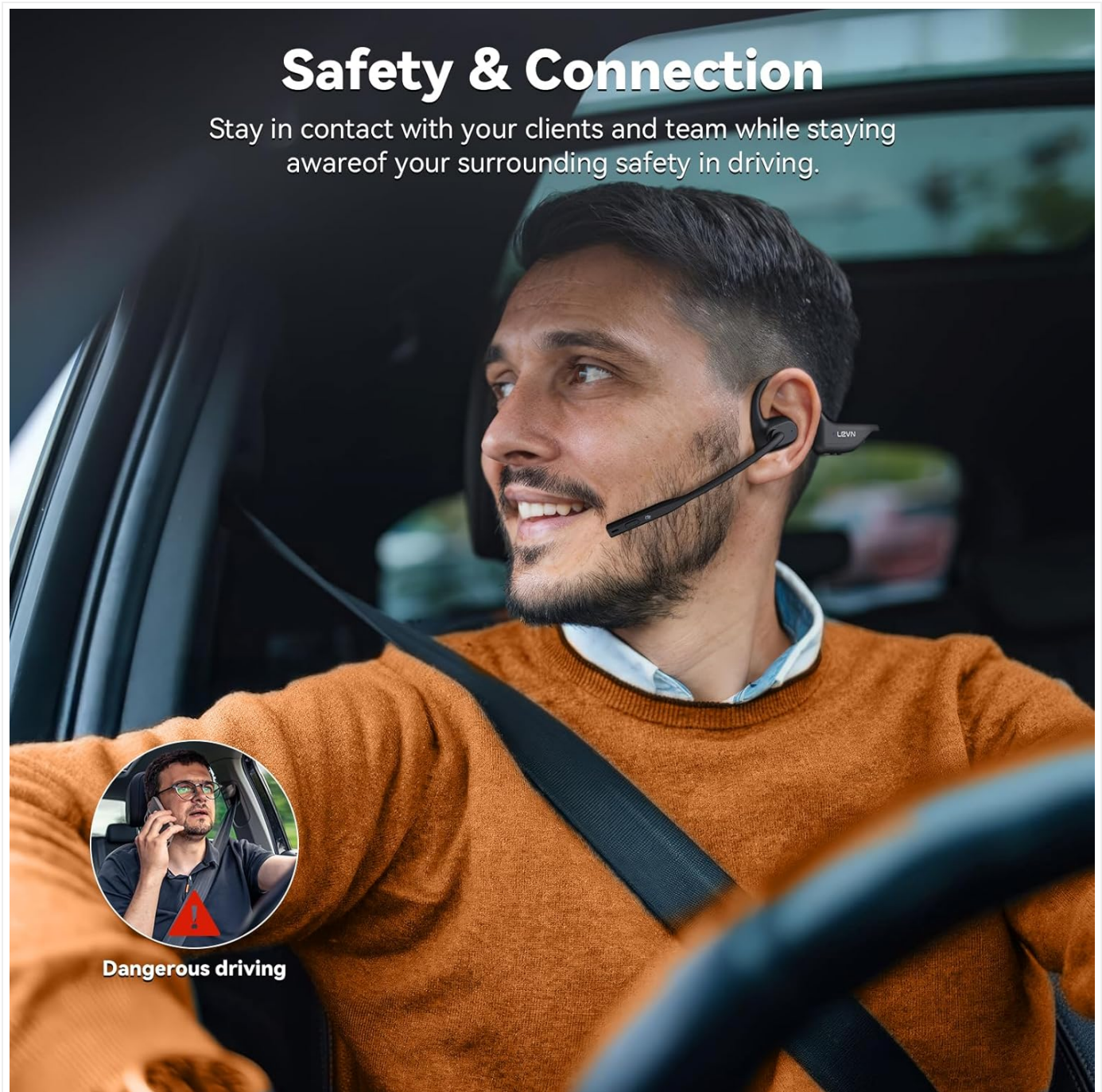
Image 4: A man driving a car while wearing NOUUI NU-HS012 headphones. This image emphasizes the importance of maintaining situational awareness, especially when driving, even with open-ear headphones.