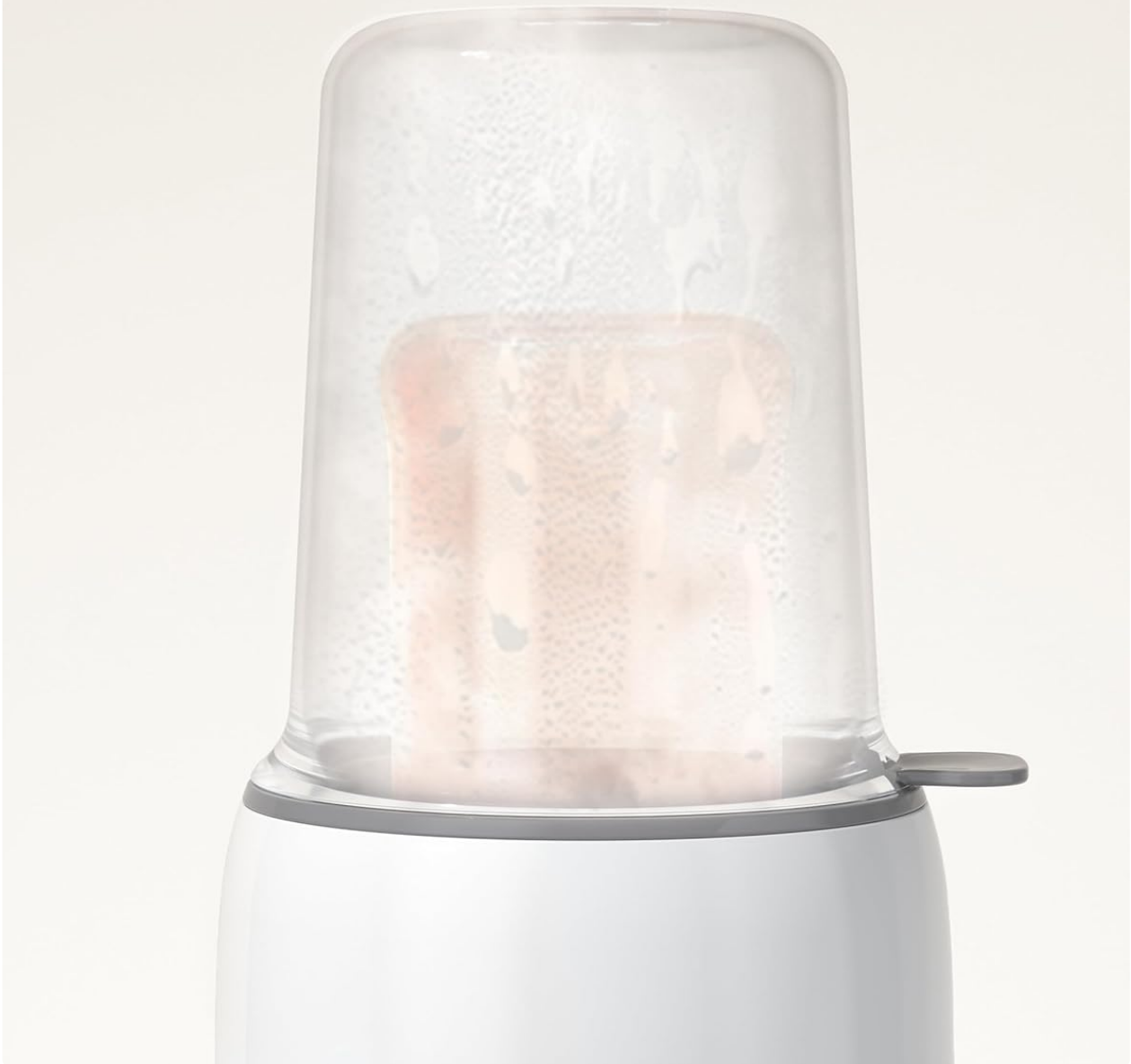
Image: The bottle warmer actively steaming, demonstrating its effectiveness in eliminating up to 99.9% of bacteria.