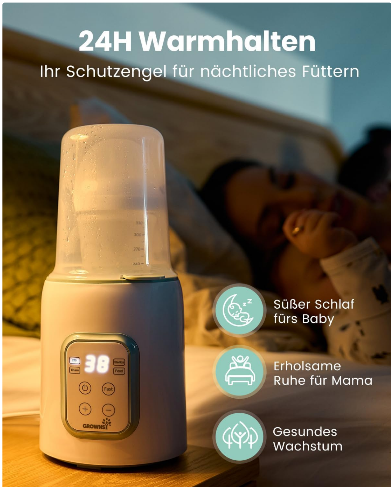
Image: The Growsy bottle warmer positioned on a bedside table, illustrating its 24-hour warm-keeping function for convenient nighttime feedings, promoting better sleep for the family.