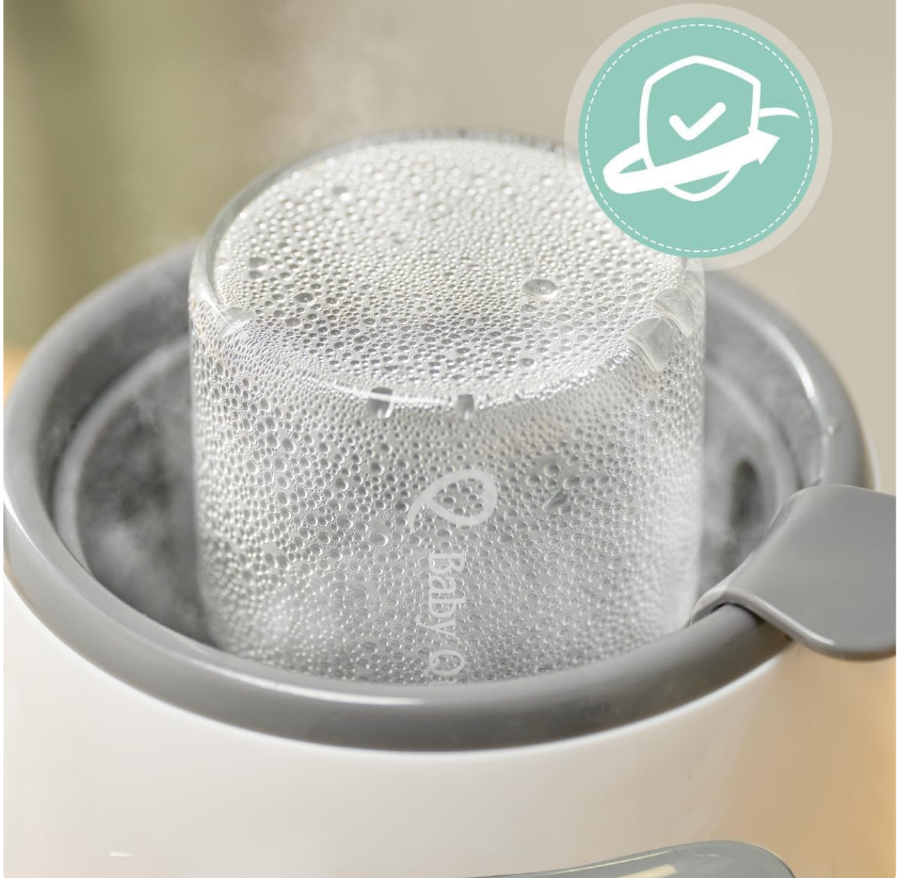
Image: A close-up view of steam rising within the bottle warmer, illustrating its high-temperature sterilization capability that kills 99.99% of germs.