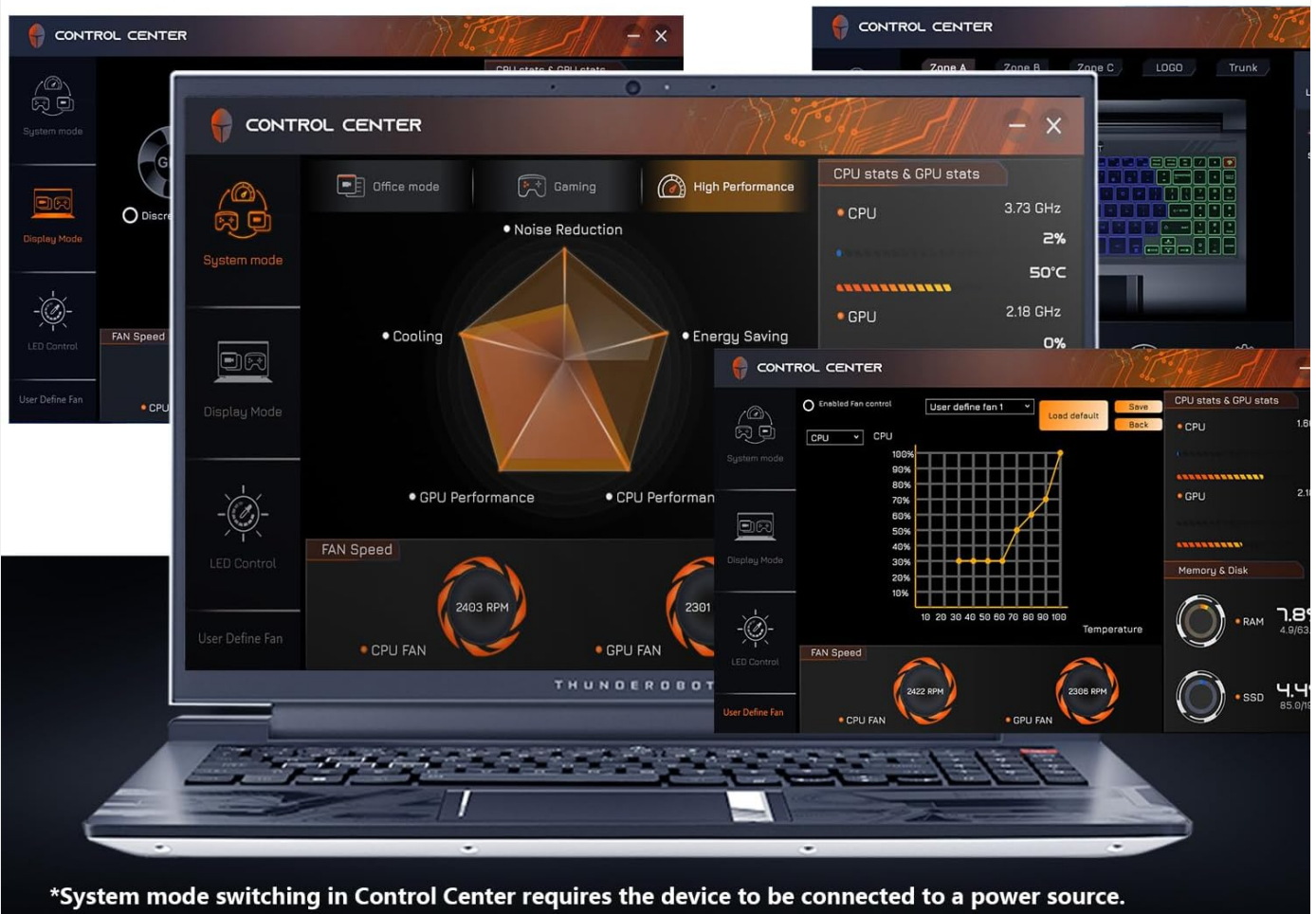
Image: Screenshots of the Thunderobot Control Center interface, showing options for performance modes, fan control, and system monitoring.