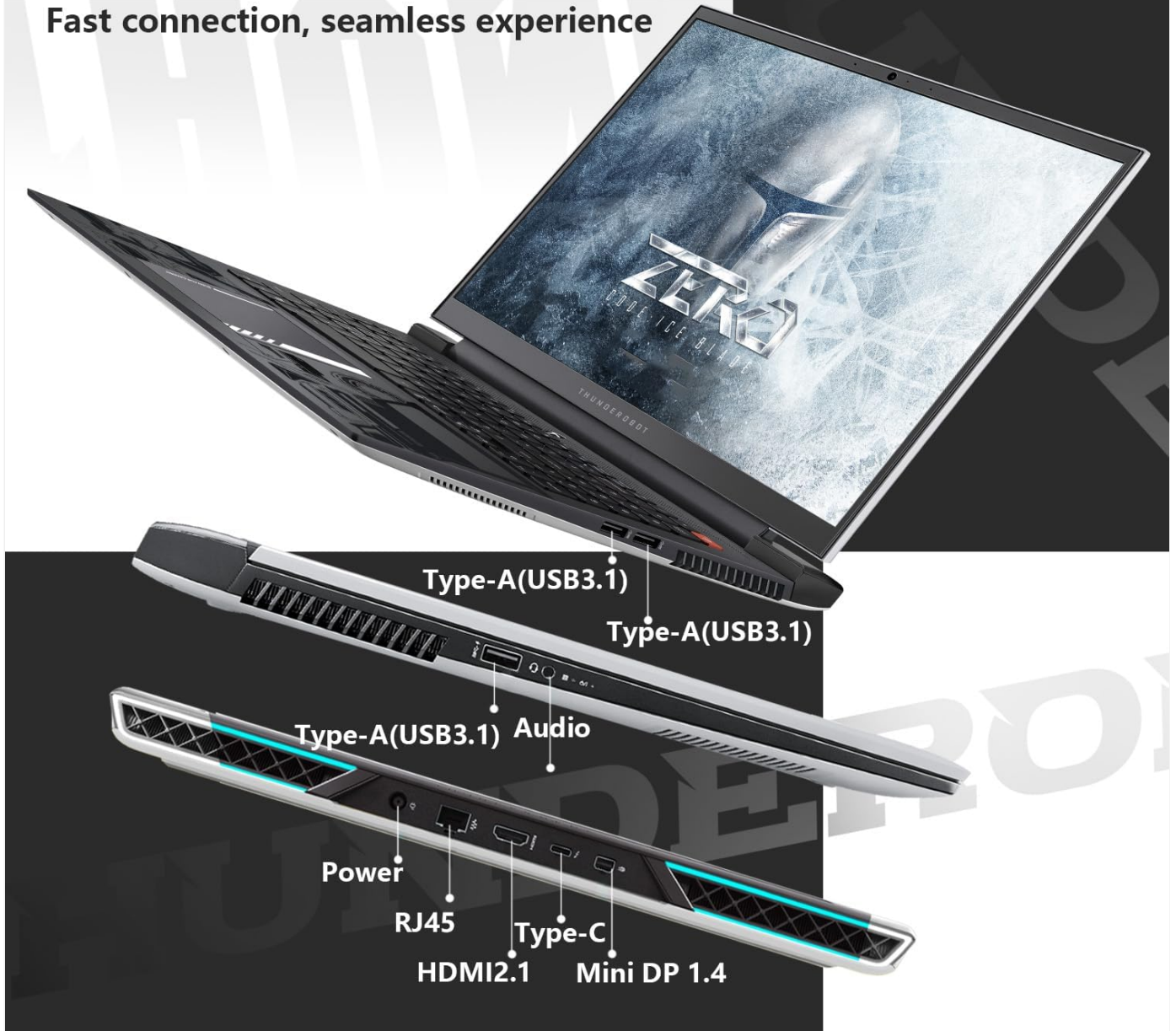
Image: Diagram illustrating the various ports available on the Thunderobot Zero 16 laptop, including USB, HDMI, RJ45, and Mini DP.