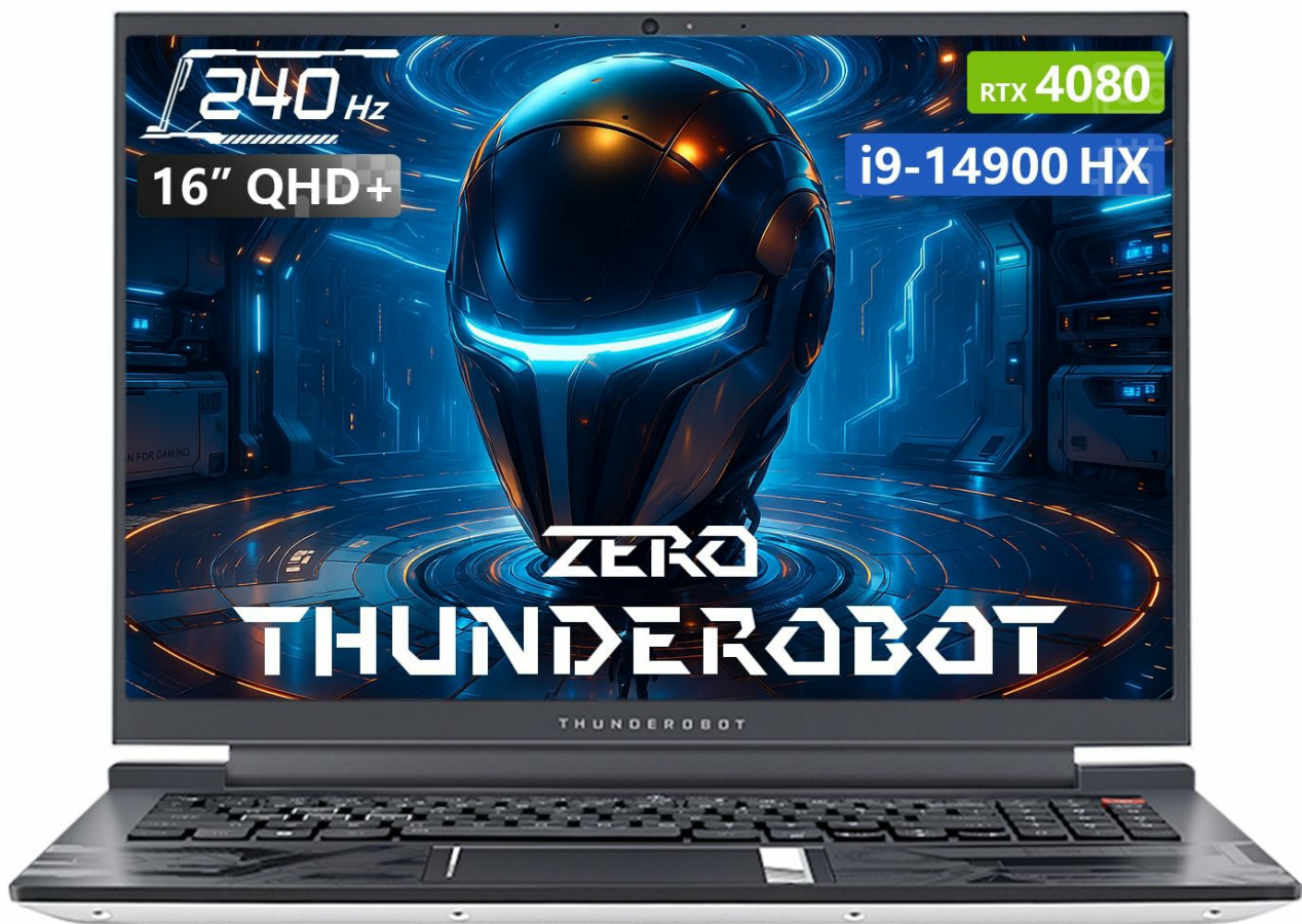
Image: The Thunderrobot Zero 16 Gaming Laptop, showcasing its sleek design and display.