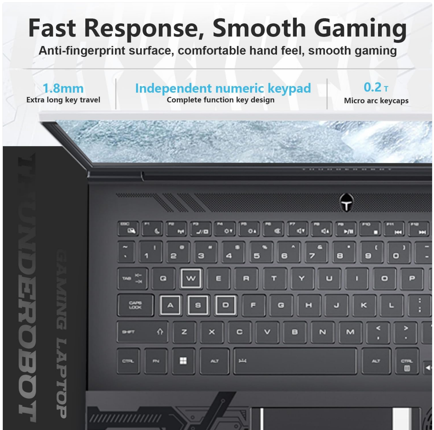
Image: View of the laptop's RGB backlit keyboard and touchpad, showing the numeric keypad and key travel.

The laptop is equipped with an RGB backlit keyboard featuring an independent numeric keypad. The keys have a 1.8mm travel distance for comfortable typing and gaming. The touchpad provides precise cursor control.