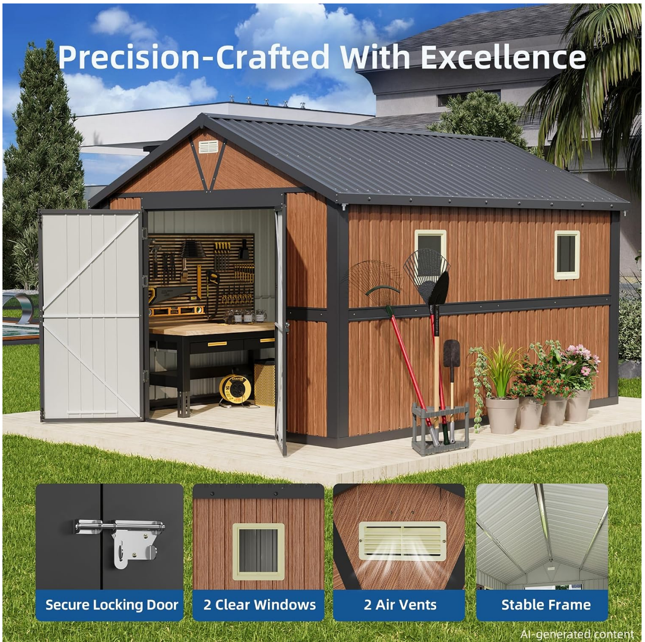
Figure 4: Exterior details of the shed, including the secure locking door, two clear windows, built-in air vents, and the stable frame construction.