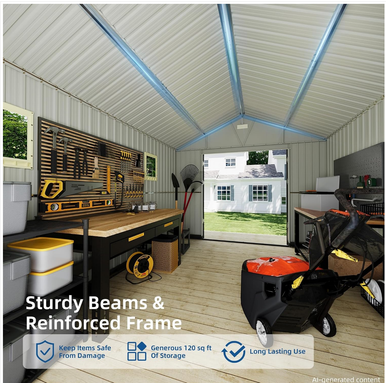
Figure 2: Interior view highlighting the sturdy beams and reinforced frame of the shed, designed for durability and storage.

Refer to the detailed manual provided in your package for step-by-step instructions and diagrams for each component.