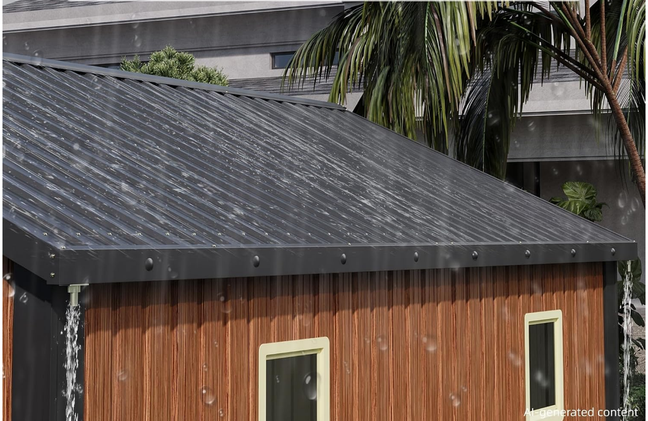
Figure 6: The slanted roof design ensures efficient drainage, providing rain protection, snow protection, rust prevention, and windproof performance.