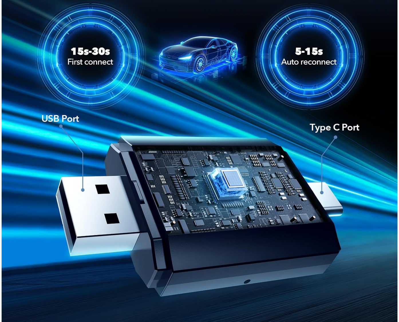
Figure 3.2: Internal components and connection speed.