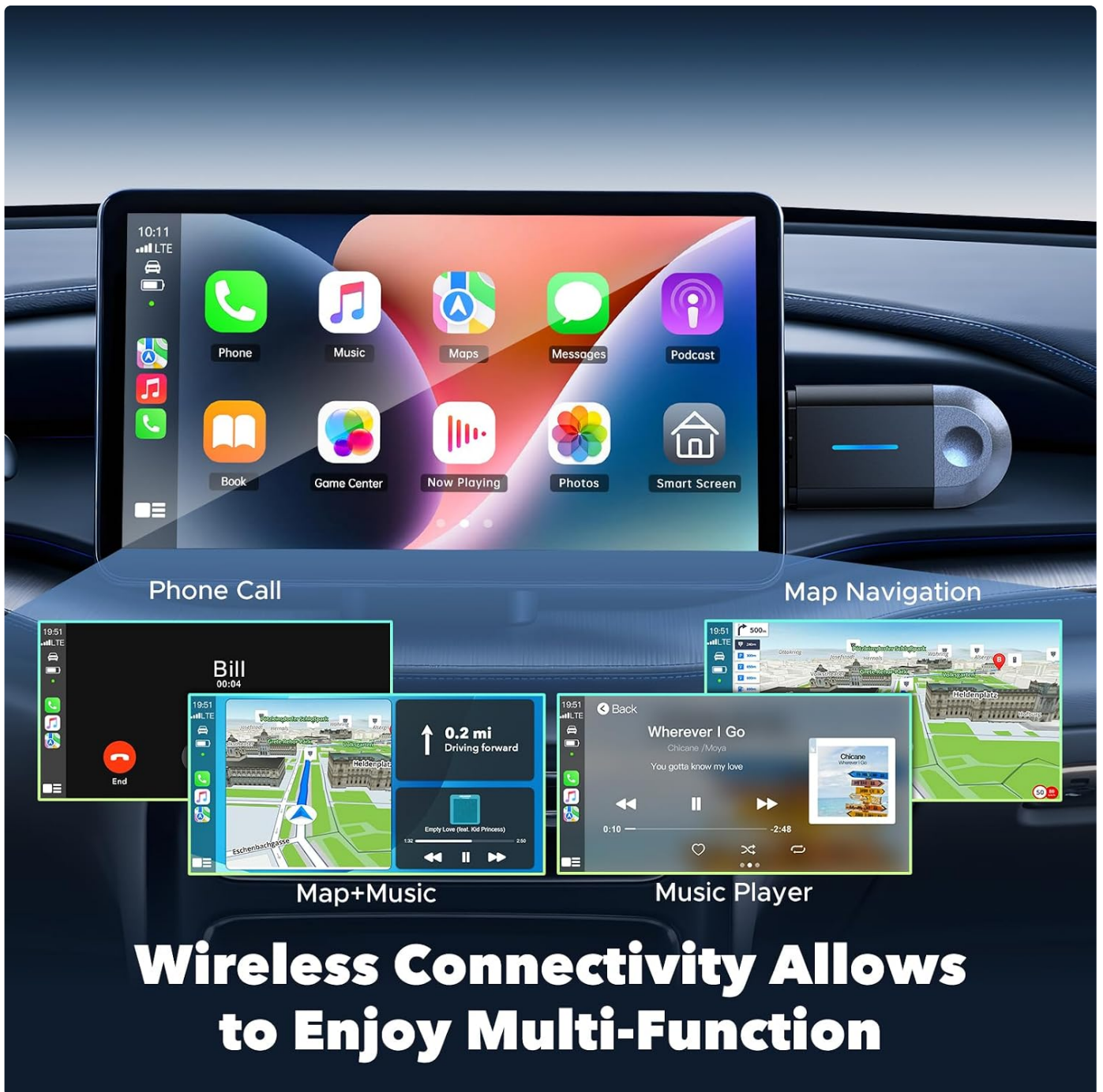
Figure 5.1: Wireless multi-function display on car screen.