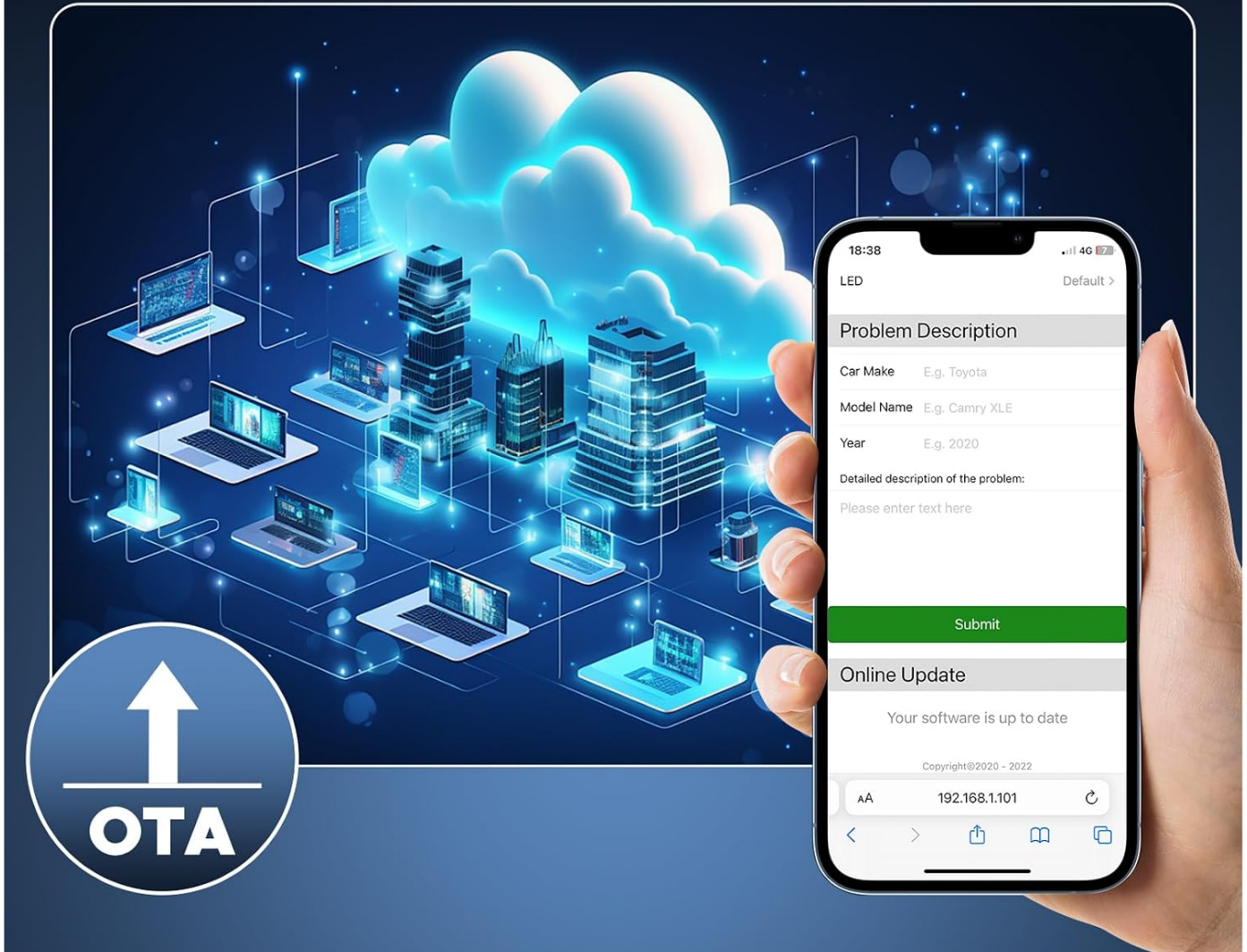
Figure 6.1: OTA firmware update interface.