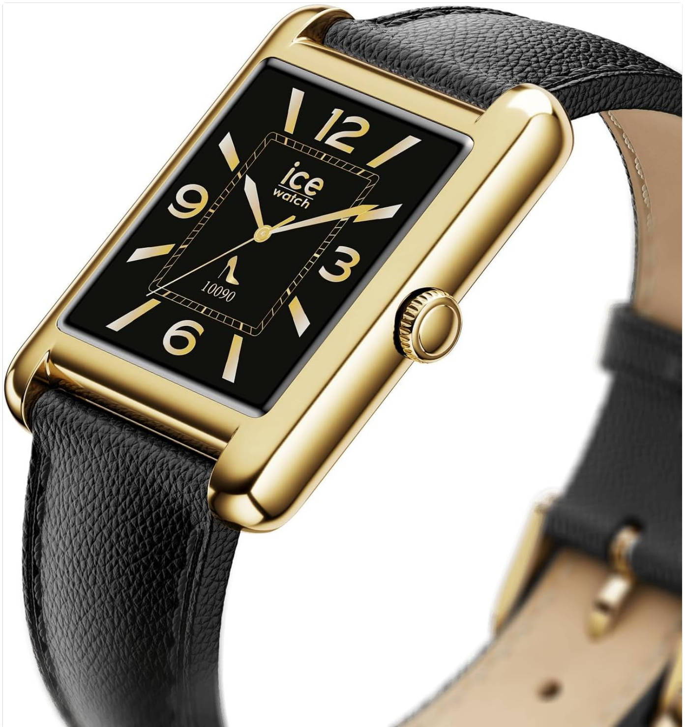
The side of the smartwatch, featuring the functional crown for navigation and interaction.