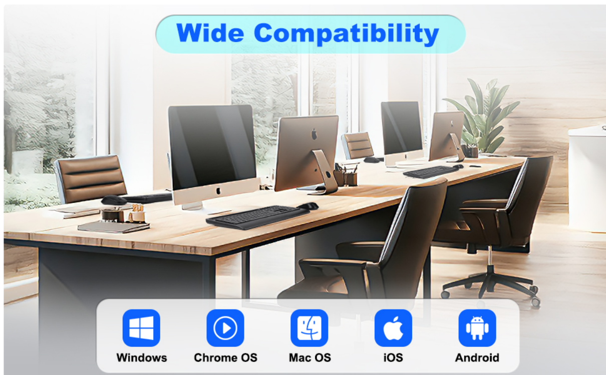
Image: A graphic displaying the logos of Windows, Chrome OS, Mac OS, iOS, and Android, signifying the broad operating system compatibility of the keyboard and mouse combo.