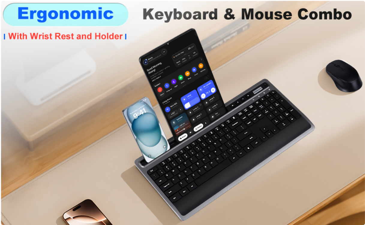
Image: A user operating the keyboard, with a smartphone and tablet placed in the integrated holder, demonstrating its utility for multitasking.