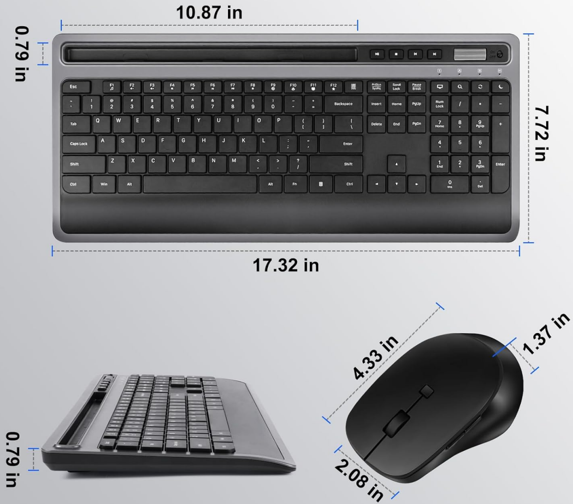
Image: Technical drawing illustrating the precise dimensions of both the keyboard and the mouse.