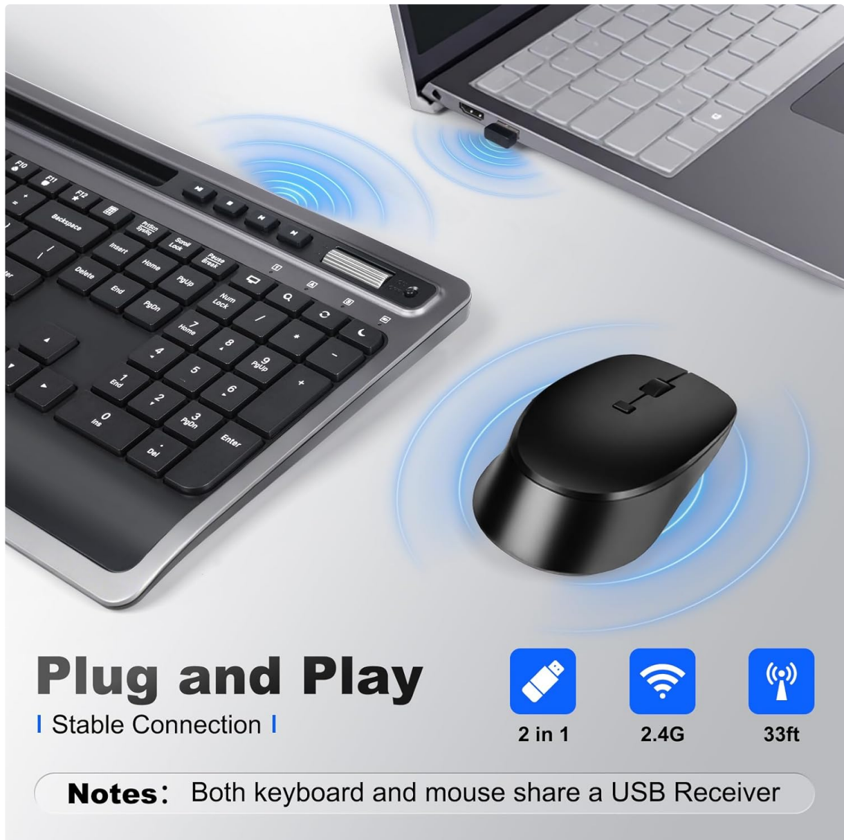
Image: A close-up of the keyboard and mouse, showing the USB receiver plugged into a laptop, indicating a stable 2.4G wireless connection.