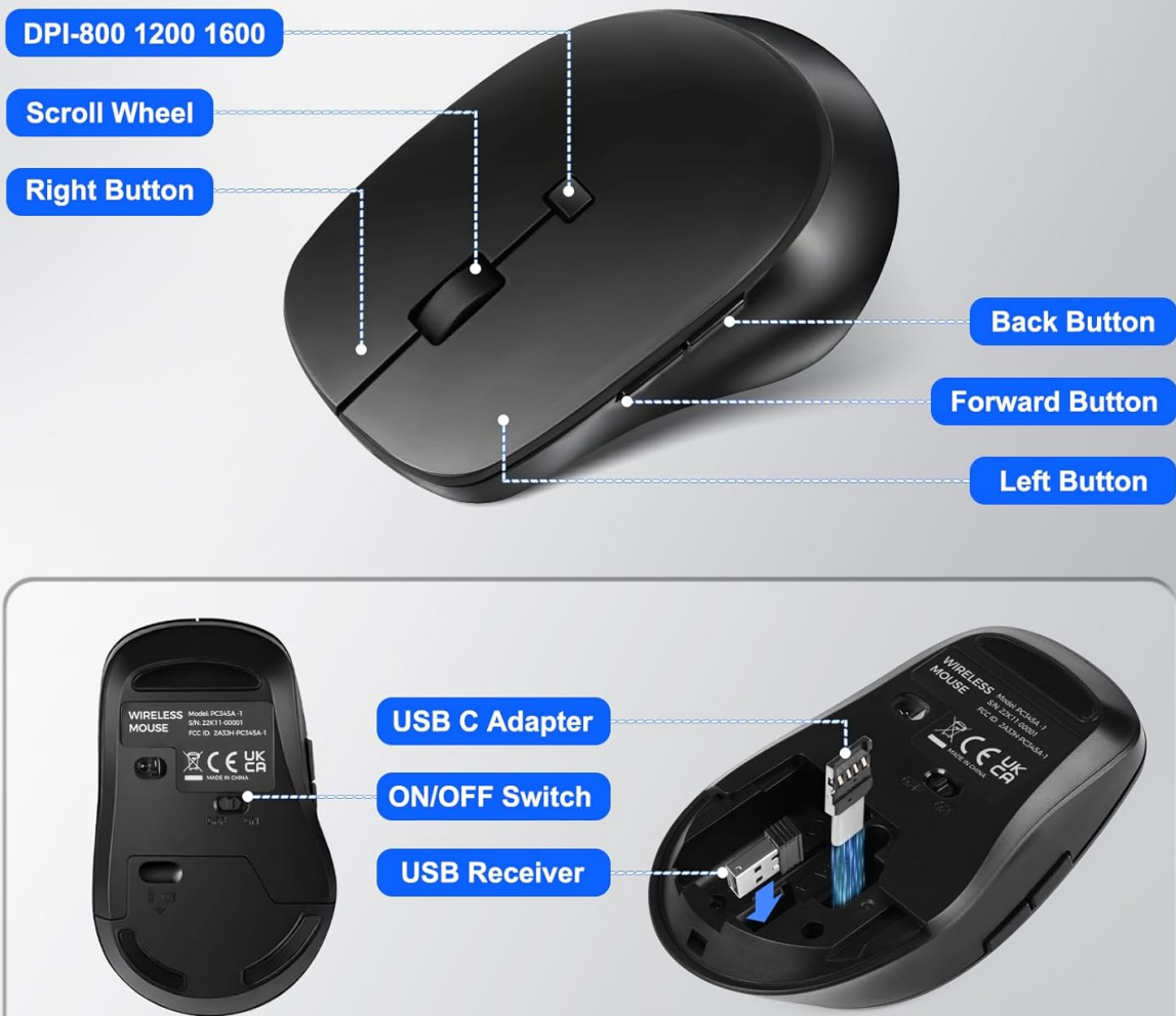
Image: An exploded view diagram of the mouse, labeling its six buttons (Left, Right, Scroll Wheel, DPI, Forward, Back) and indicating the adjustable DPI settings (800, 1200, 1600).