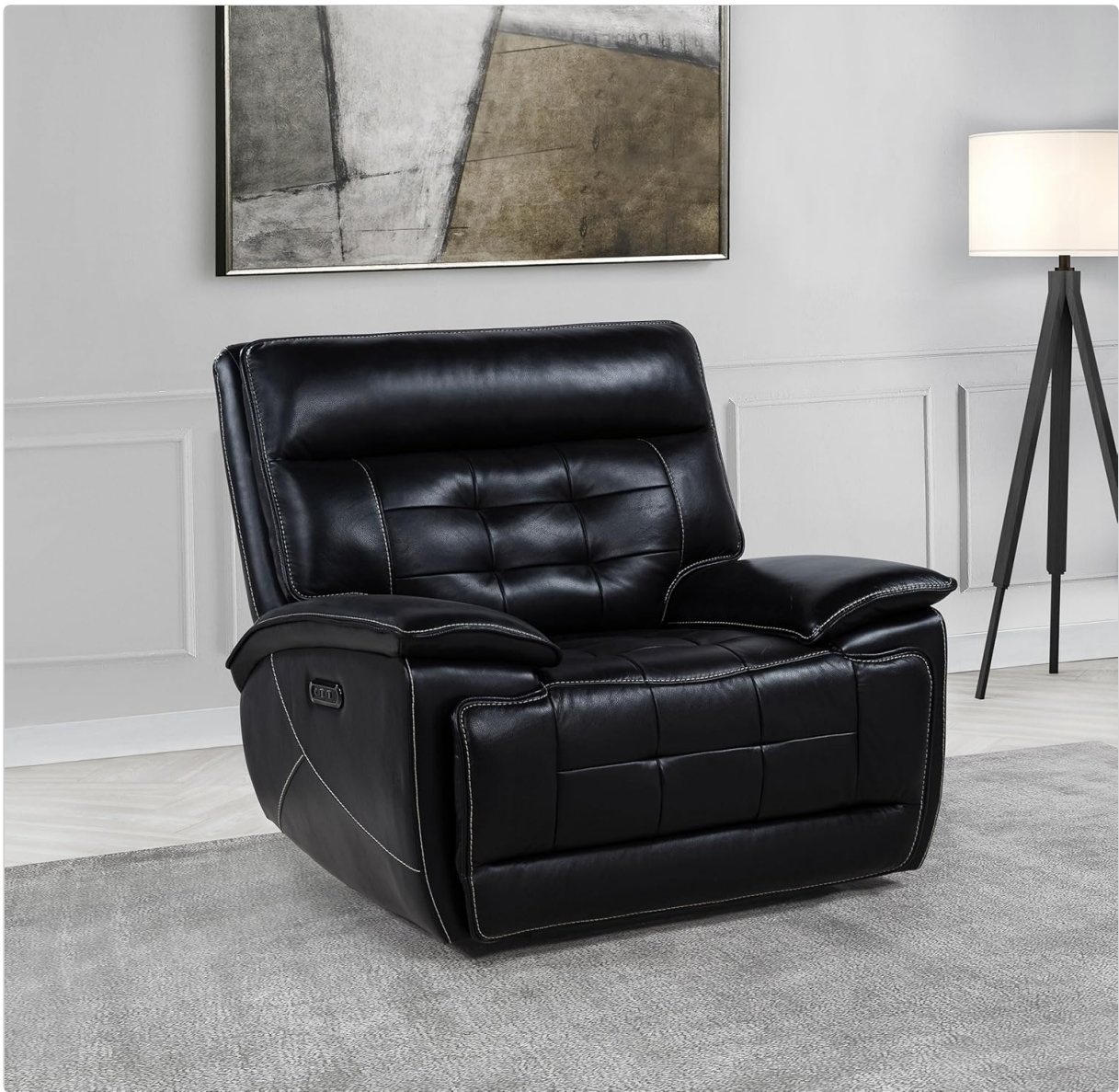
Image: The Hewitt Dual Power Recliner Chair, showcasing its design and black leather finish.