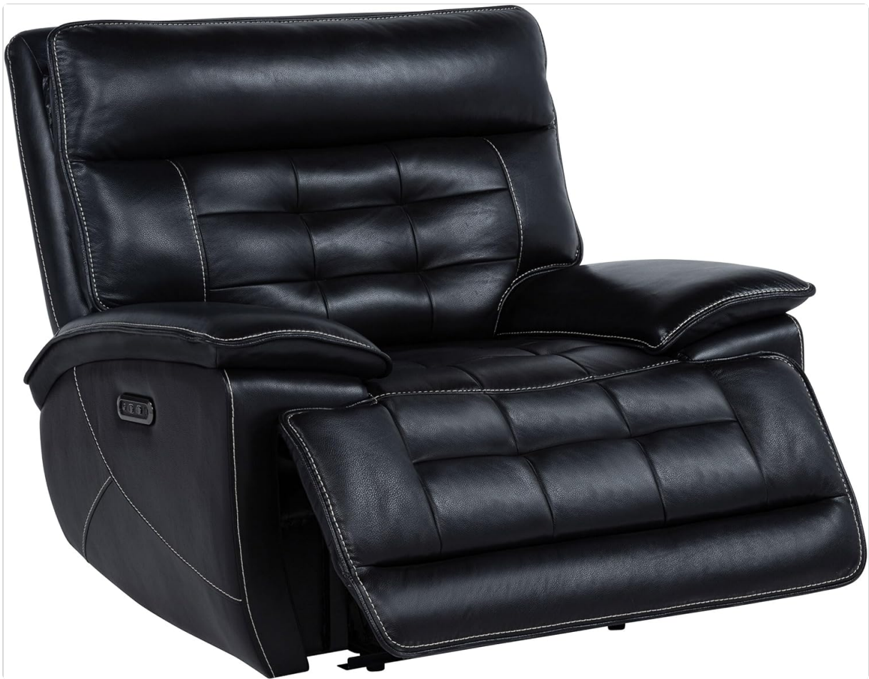
Image: The recliner in a partially reclined position, demonstrating the footrest extension.