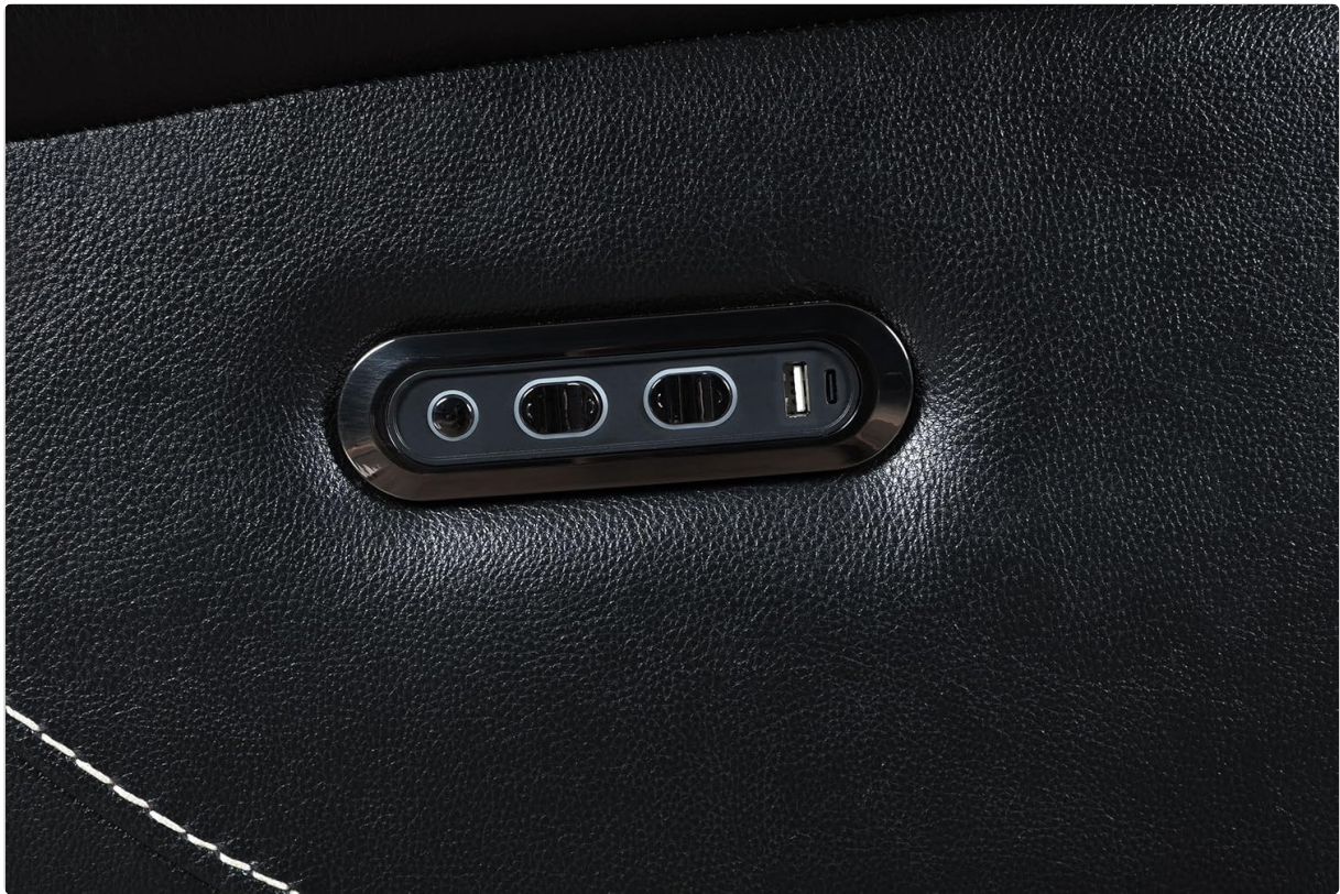
Image: Detailed view of the control panel, showing recline buttons and USB ports.