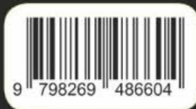
Image 3.1: Back Cover. This image shows the back cover of the manual, which includes a summary of its content and the ISBN-13 barcode.

Knowledge is power— and influence is its sharpest weapon.