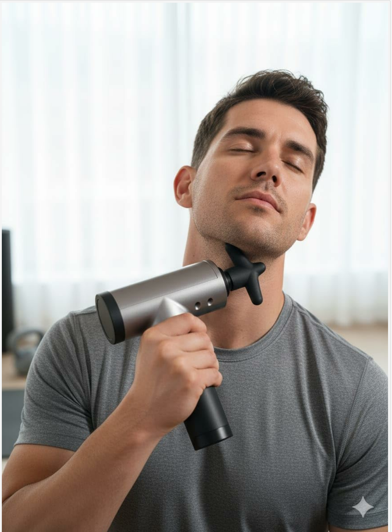
Figure 6.1: Man applying the massage gun to his neck, demonstrating targeted relief.