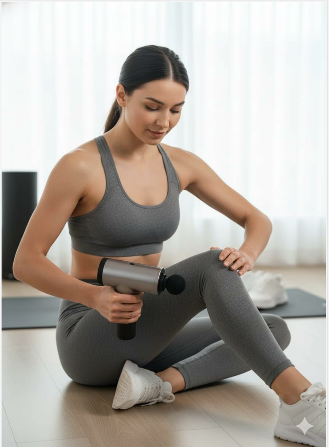
Figure 6.2: Woman using the massage gun on her knee, showing versatility for different body parts.