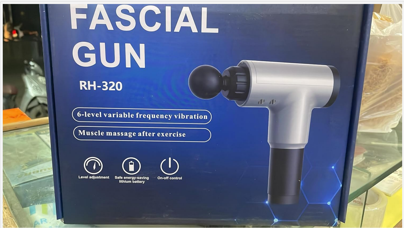
Figure 5.1: The product packaging highlighting the device's features and controls, including level adjustment, battery, and on-off switch.