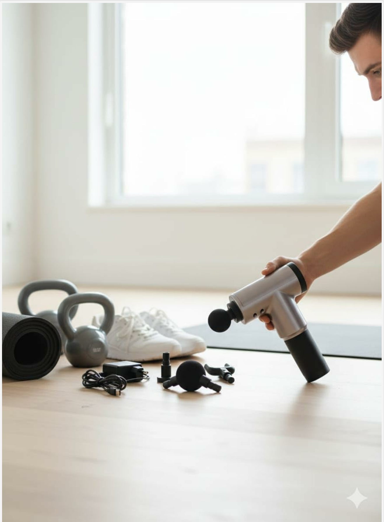
Figure 3.1: The Fascial Gun RH-320 with its various attachments and charging cable, ready for use. Kettlebells and a yoga mat are visible in the background.