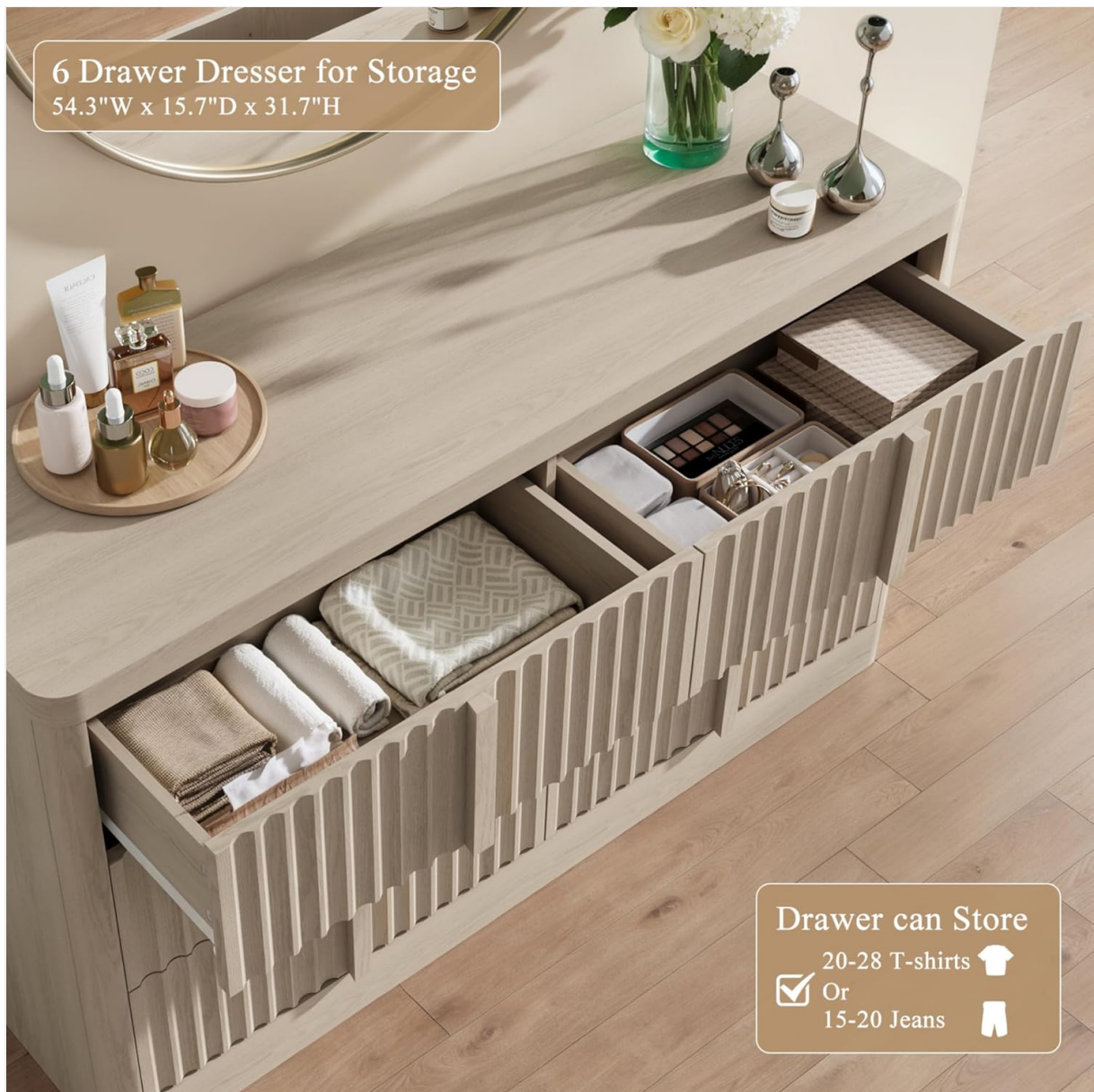
Figure 3: Drawer interior demonstrating storage capacity for various items.