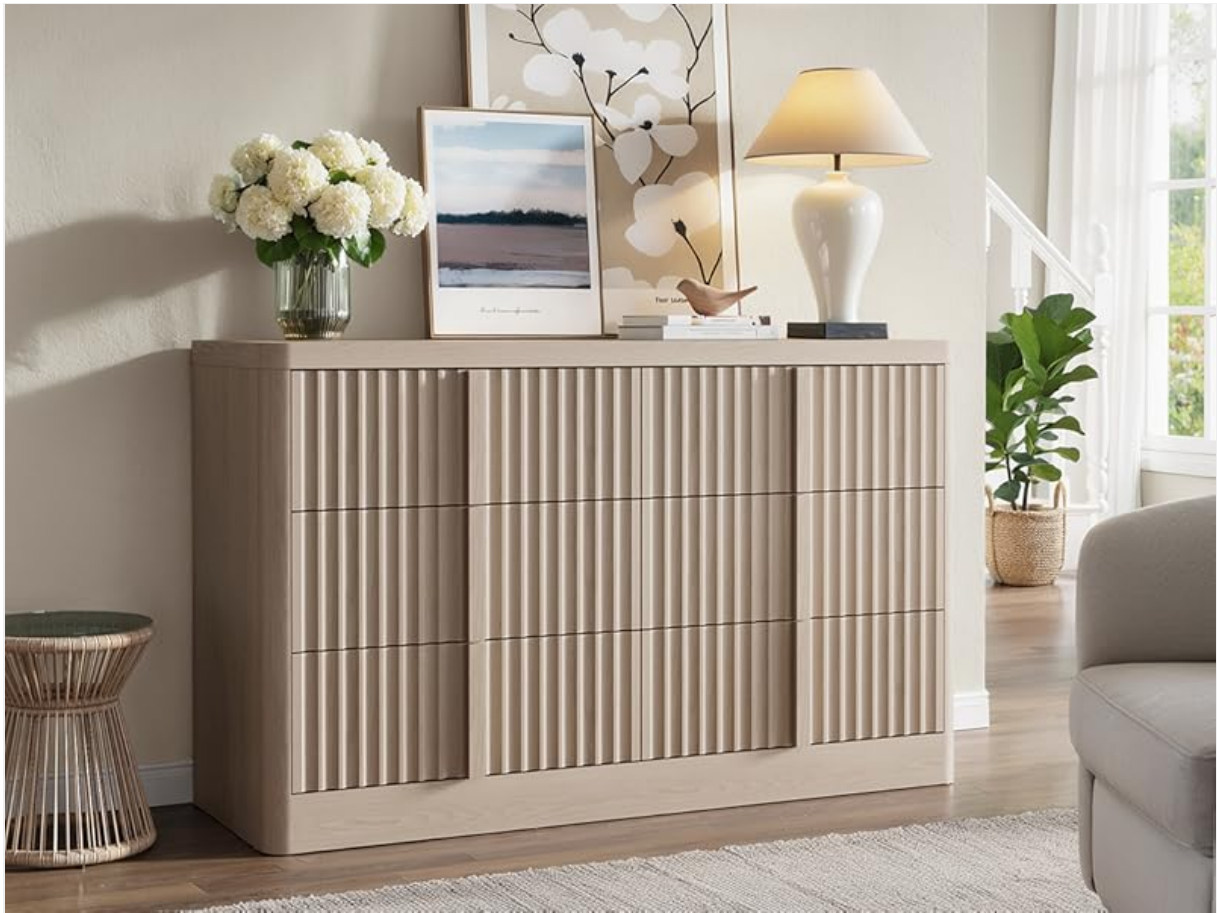
Figure 2: Assembled Harpaq Fluted Dresser in a bedroom environment.