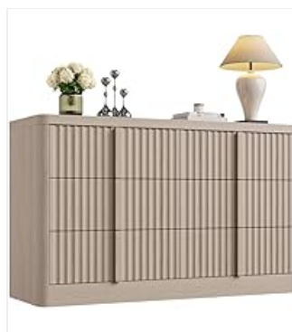
Figure 4: Estimated storage capacity per drawer for common items.

Video 1: Official Harpaq video showcasing the Modern Fluted Dresser for Bedroom, highlighting its design and features.