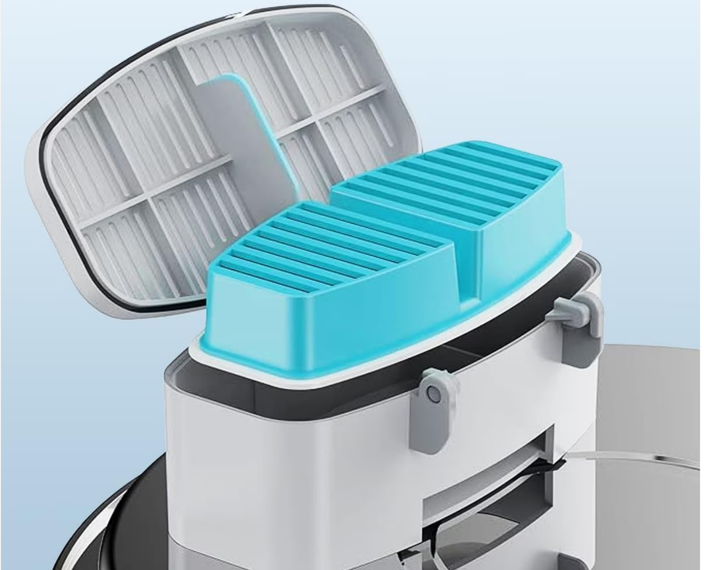
Image: Fixed position design for filter installation.