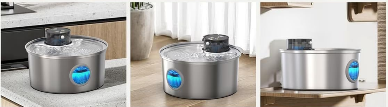
Image: Pet using the water fountain with installed filters.