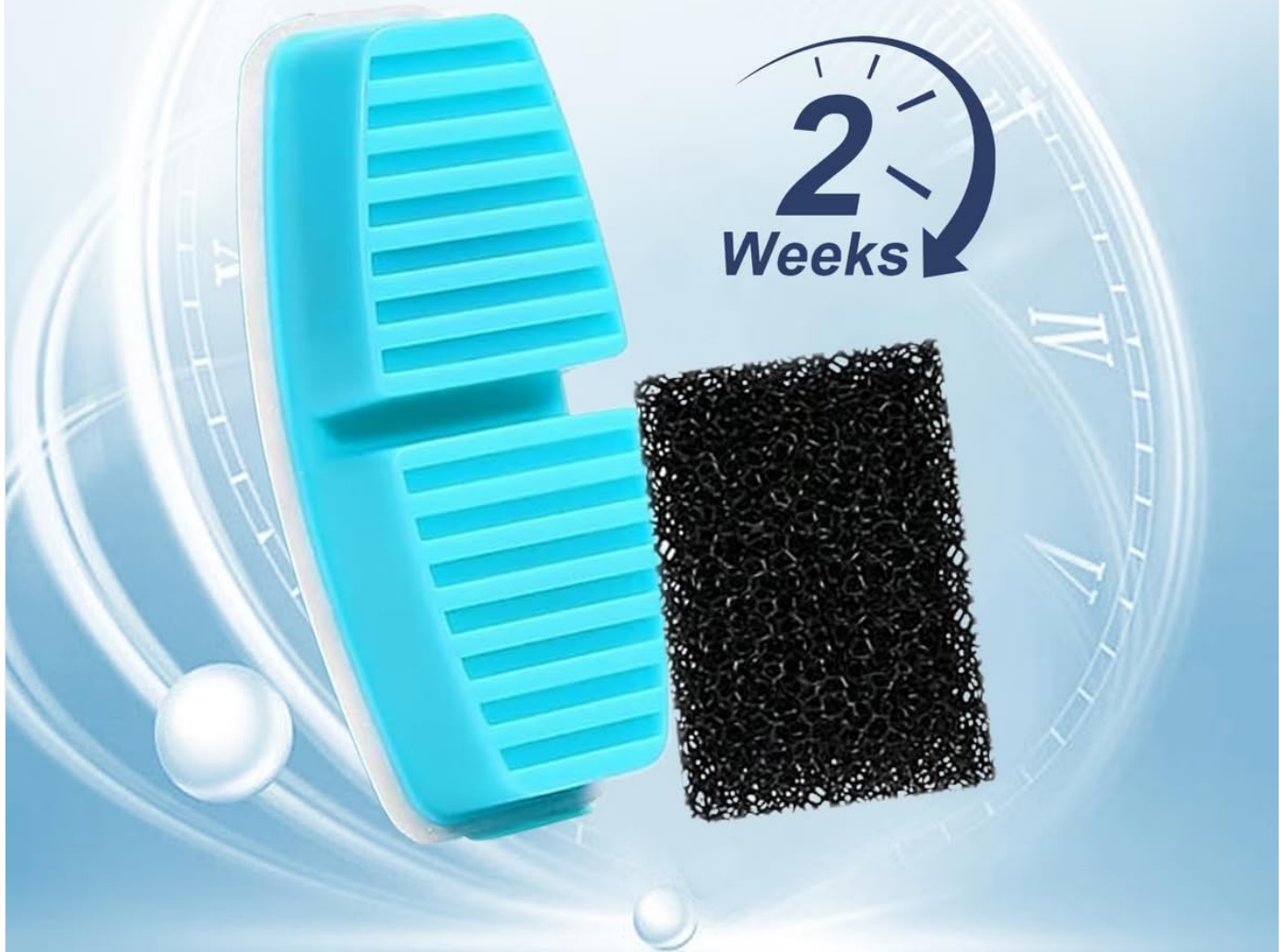
Image: Recommended filter replacement schedule.

For your pet's health, we recommend replacing the filter every 2-4 weeks based on usage