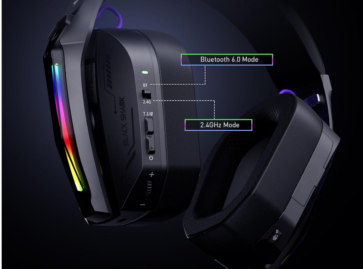
Image: The Black Shark Goblin X8 headset displayed with a graphic indicating 7.1 channel surround sound and deep bass for immersive gaming.

Lossless audio for low-latency wireless gaming. Easily switch between wireless and Bluetooth with the push of a button.