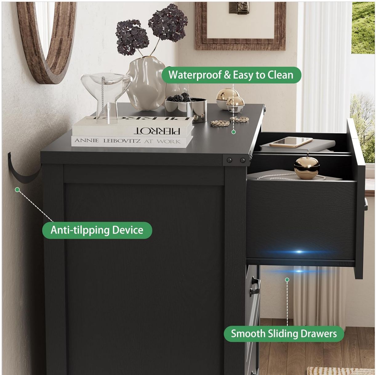
Image: Detailed view of the drawer construction, showing the bottom support beams.