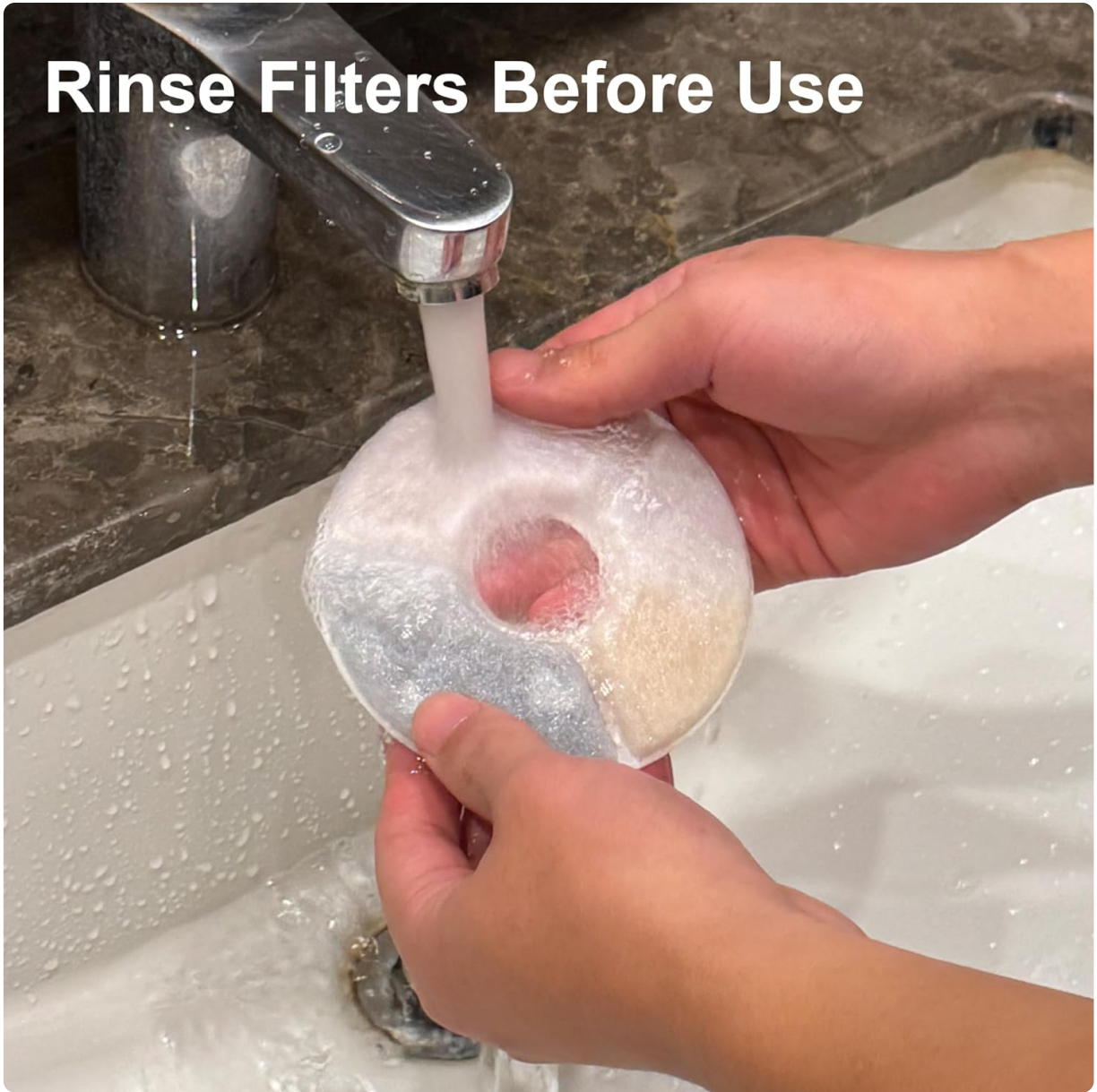
Image: Hands rinsing a Casfuy pet water fountain filter under a faucet to remove charcoal dust.