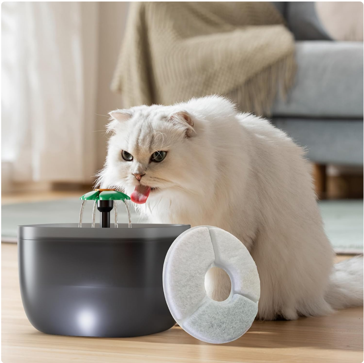
Image: A cat drinking from a pet water fountain, demonstrating the product in use.