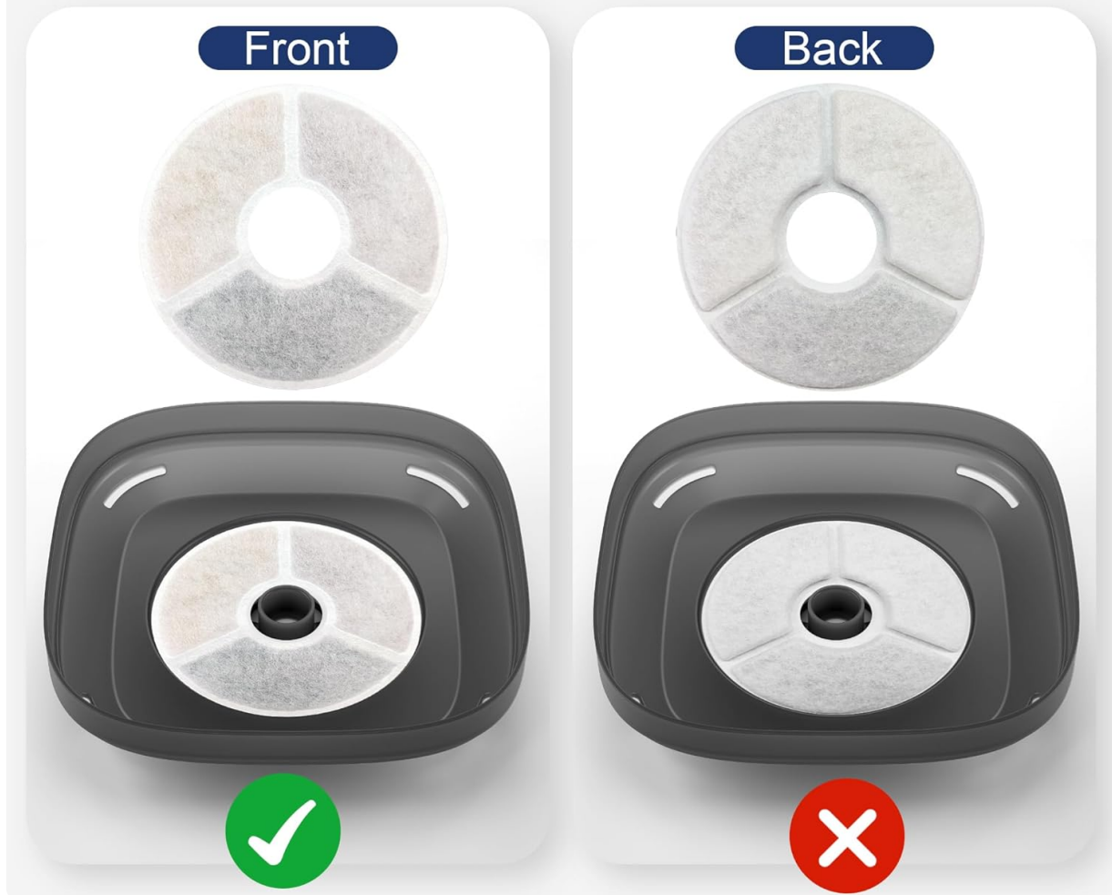
Image: Diagram illustrating the correct installation of the filter with the flat side up, and an incorrect installation example.