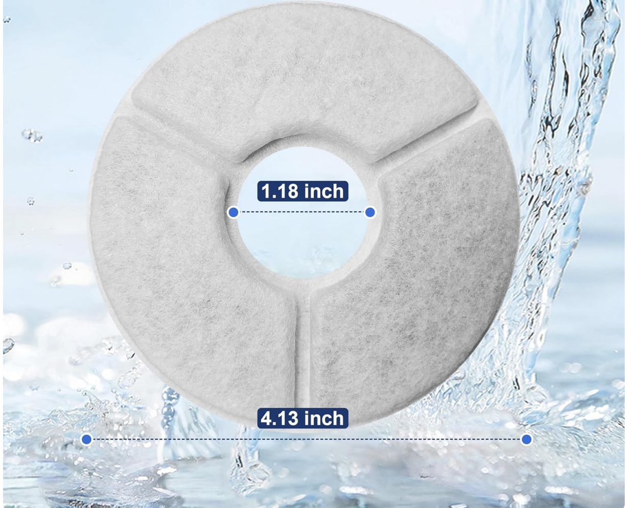
Image: Dimensions of the filter, indicating a 4.13-inch diameter and a 1.18-inch center hole.