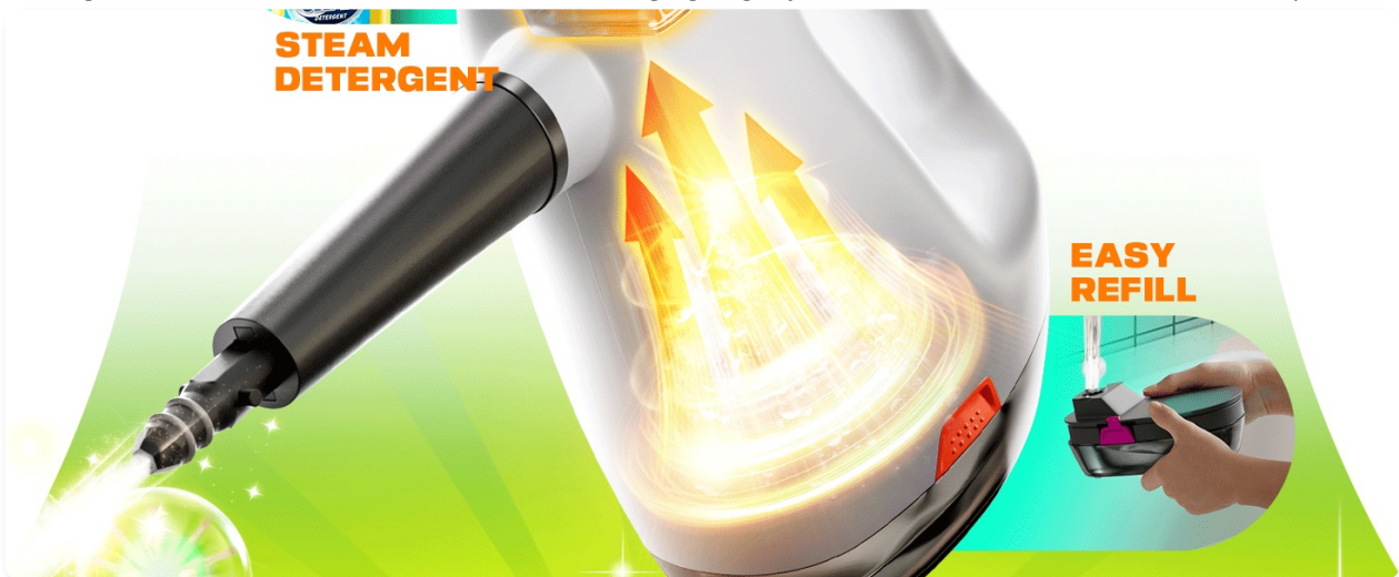
Image: Illustration showing the detachable and visible water tank for easy refilling.