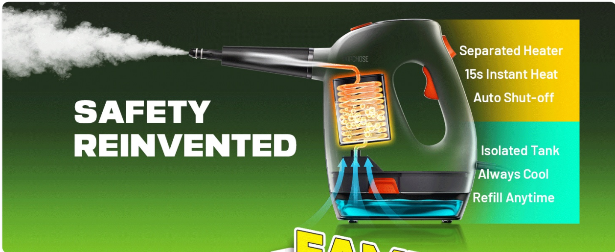
Image: Visual representation of the steam cleaner's dual modes for powerful and gentle cleaning.

Press the steam level button to toggle between low and high modes.