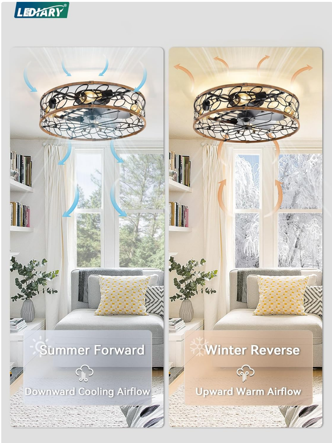
Image: Seasonal airflow modes.