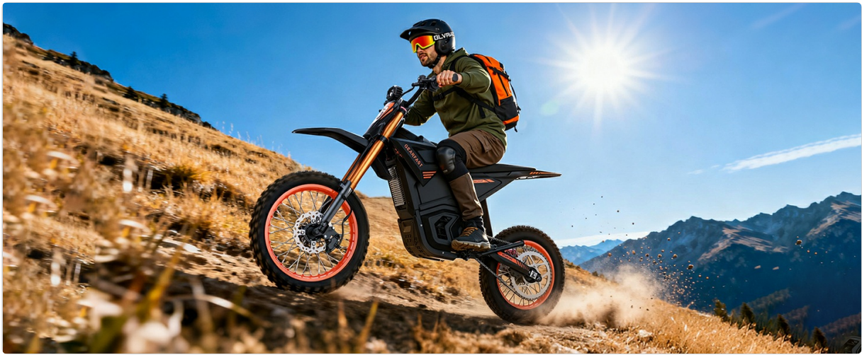
Image: The dual hydraulic disc brakes of the PILLCASE Electric Dirt Bike Zero 7, providing strong and reliable stopping power.