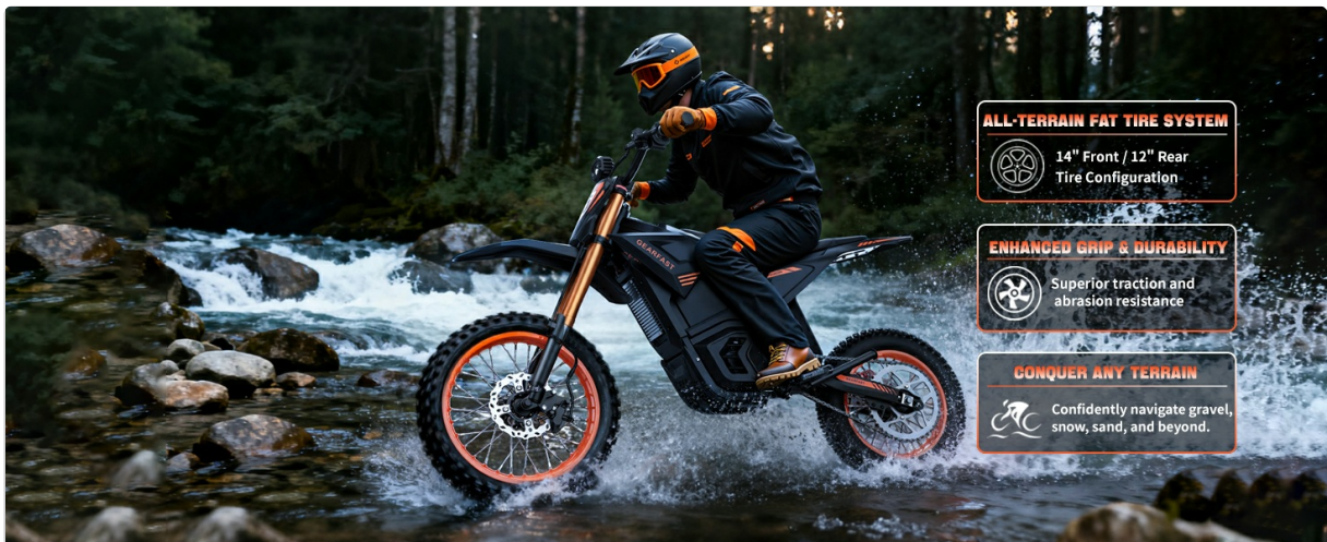
Image: The PILLCASE Electric Dirt Bike Zero 7 in action, emphasizing its 2500W brushless hub motor and high torque.

Video: Demonstrating the PILLCASE Electric Dirt Bike Zero 7 in action, highlighting its performance and handling.