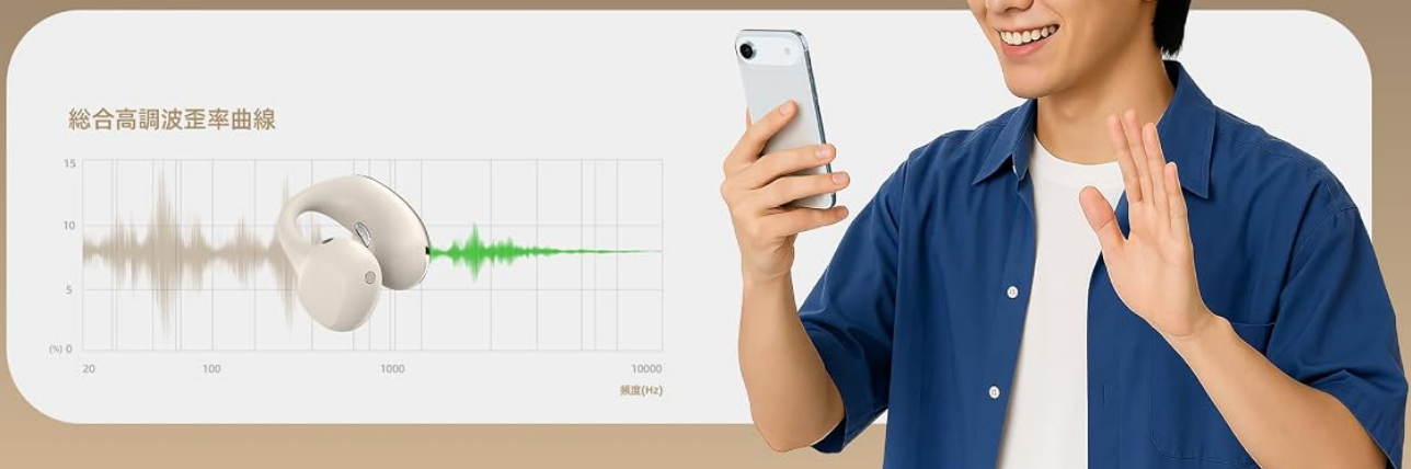
Image: Detailed view of the ACEFAST ACECLIP Pro earphones and their charging case.