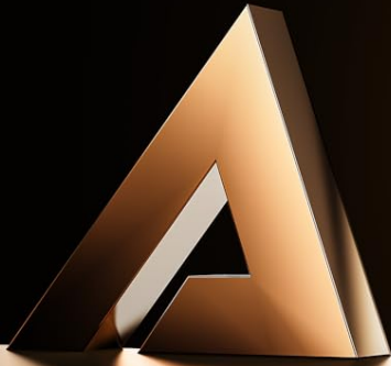
Image: ACEFAST customer support details, including 18-month warranty and dedicated support team.