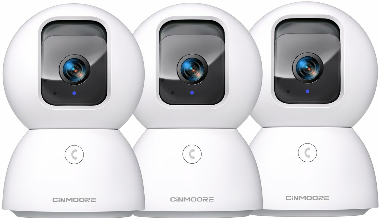
Figure 1: CINMOORE CM-C2U 3K Indoor Security Camera