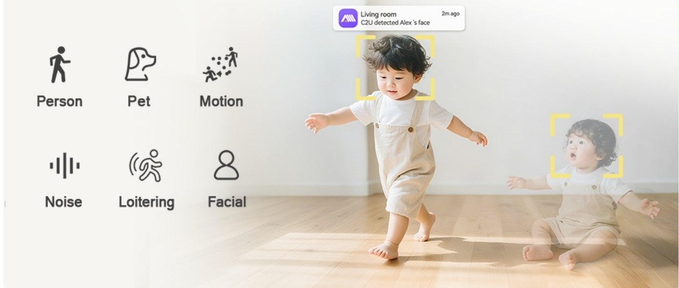
Figure 4: Highlights the camera's no-subscription local AI detection features, including recognition of up to 5 faces and 6 types of detections (person, pet, motion, noise, loitering, facial) while ensuring 100% privacy.