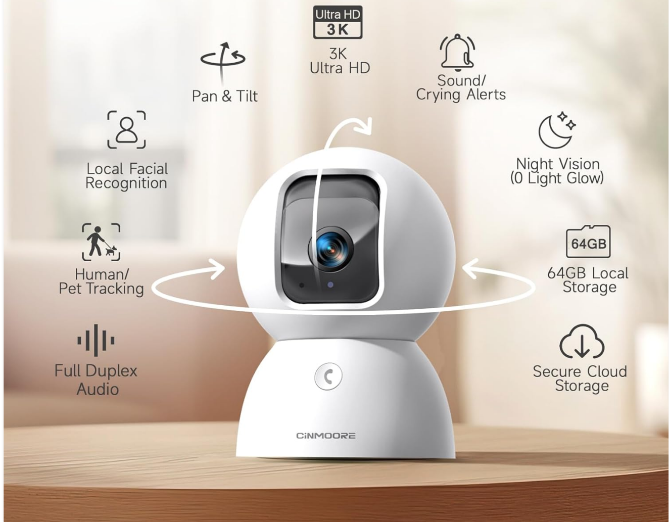
Figure 3: Illustrates the camera's comprehensive 360° pan and tilt capabilities, along with other key features like 3K Ultra HD, sound/crying alerts, and local facial recognition.