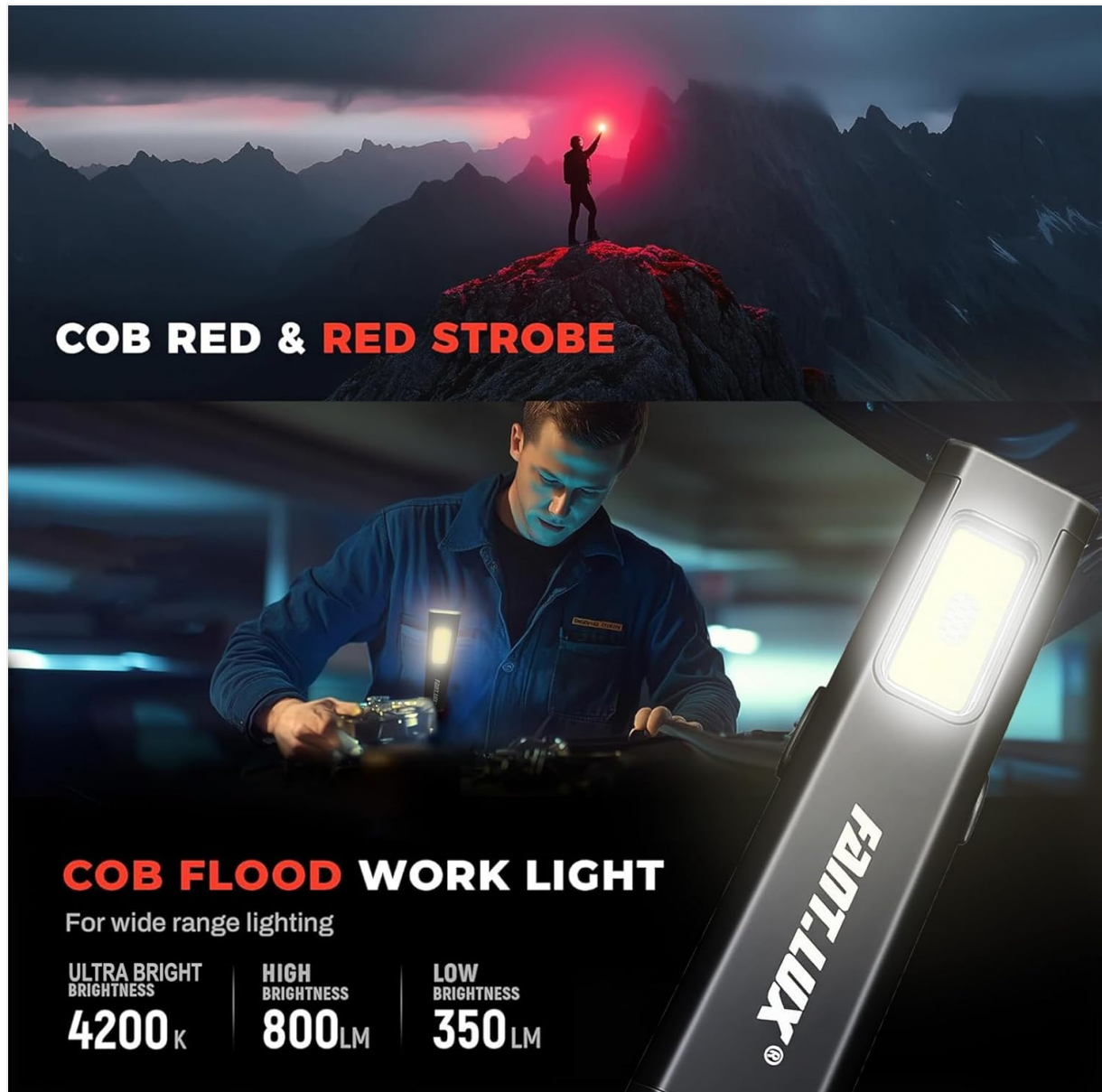
Figure 4.2: Flashlight attached via magnetic base.

The flashlight is equipped with a strong magnet at its base. This allows for hands-free operation by attaching the flashlight to any suitable metallic surface, such as car hoods, metal shelves, or electrical panels.