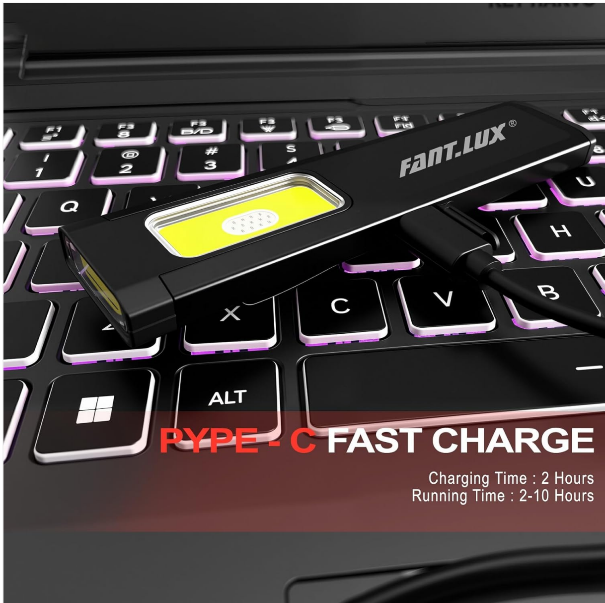
Figure 3.1: Charging the flashlight via USB-C.