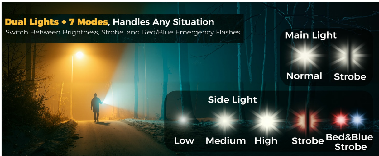
Figure 4.1: Overview of main and side light modes.

Switch Between Brightness, Strobe, and Red/Blue Emergency Flashes