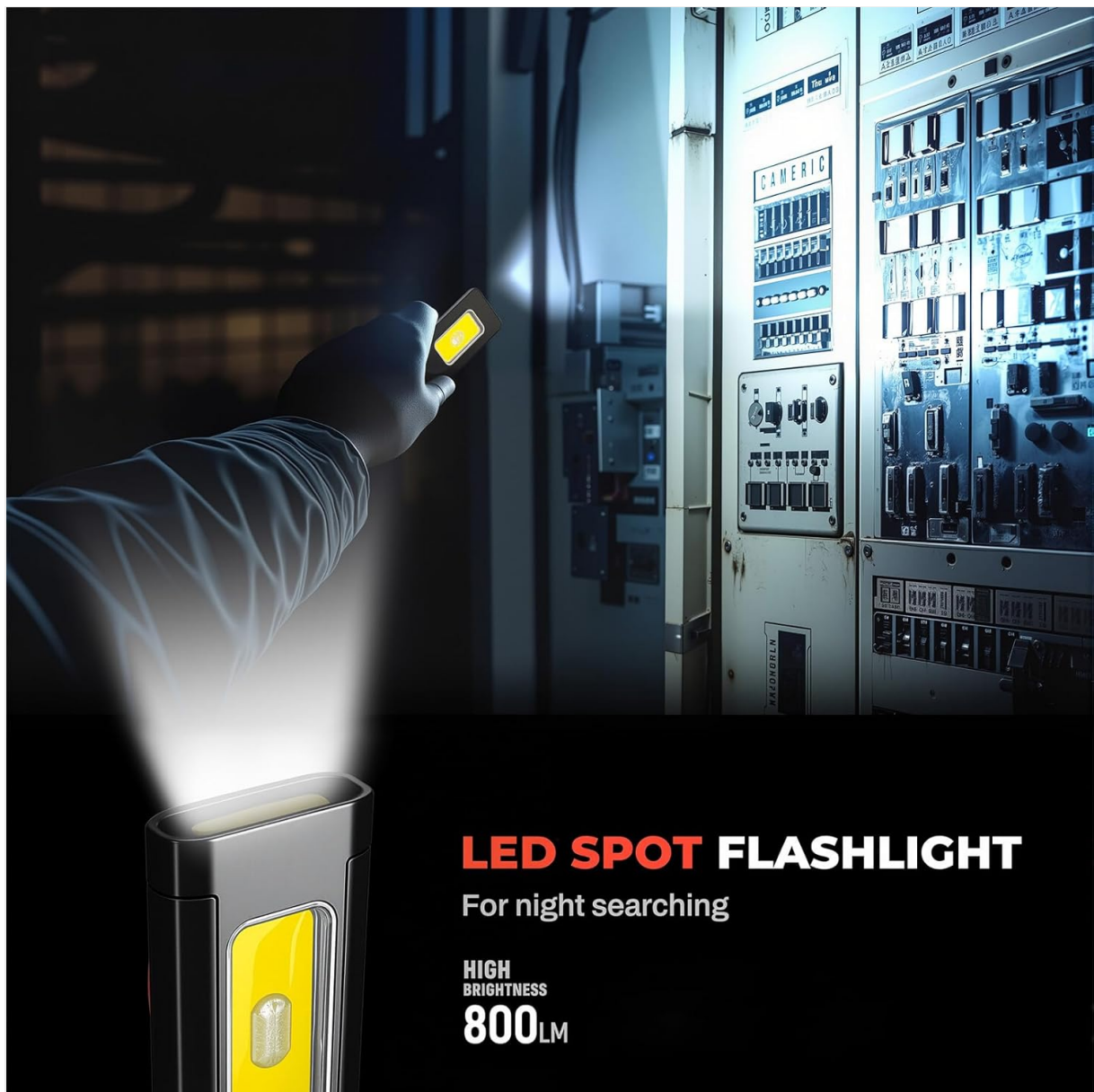
Figure 2.1: Overview of FANT.LUX T2509 Pocket Flashlight features.