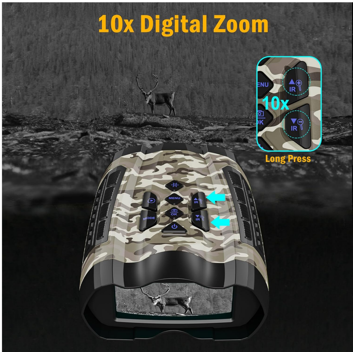
Figure 5.3: The 10x digital zoom feature, showing how to magnify distant subjects.