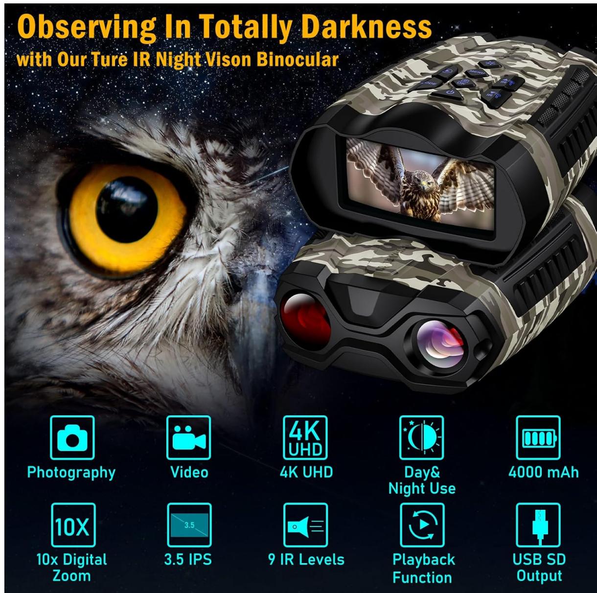
Figure 3.1: Top-down view of the WISHBETY Ja-50 Night Vision Binoculars, highlighting the control panel and integrated display.

The WISHBETY Ja-50 Night Vision Binoculars feature a robust design with intuitive controls for ease of use in the field. Key components include the objective lens, infrared illuminator, eyepiece, 3.5-inch HD display, and control buttons.