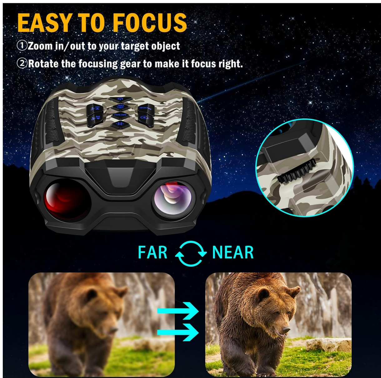
Figure 5.1: Adjusting the focus wheel for optimal image clarity.