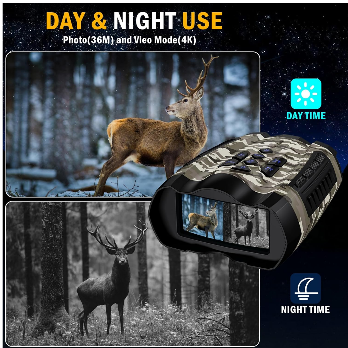
Figure 5.4: Day and night observation capabilities, demonstrating the device's ability to capture both photos and videos in varying light conditions.