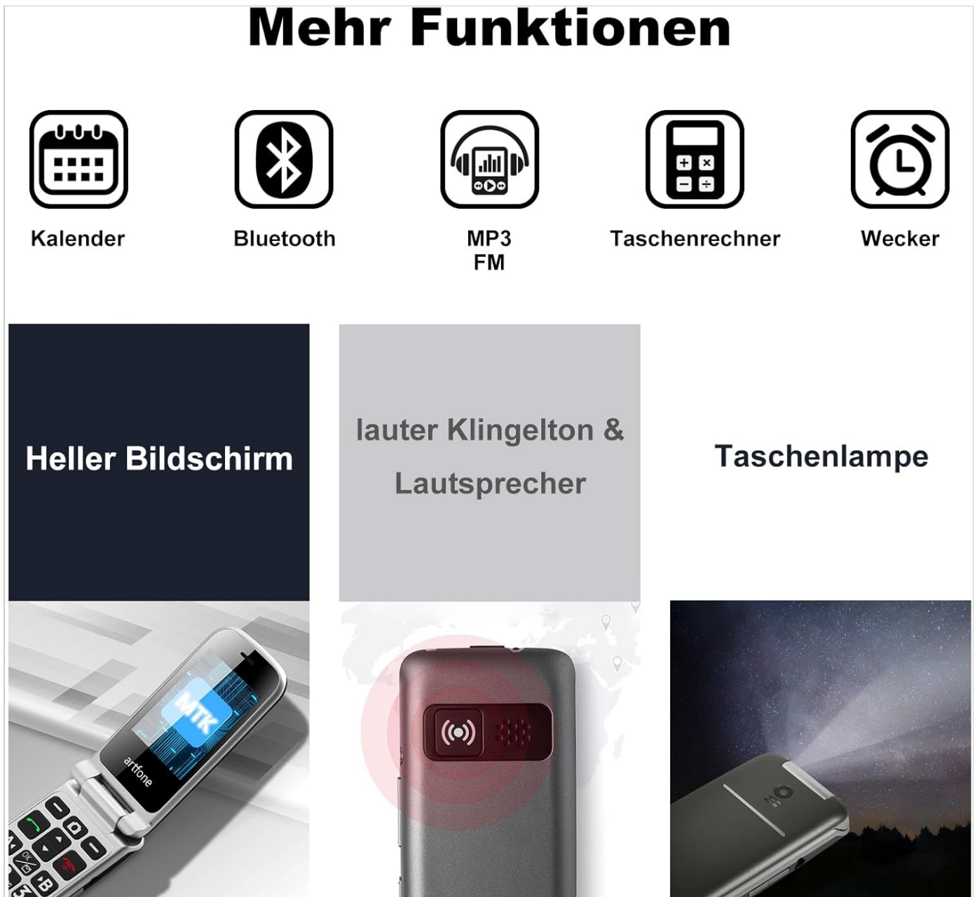
Image 4.7: Overview of additional functions including calendar, Bluetooth, FM radio, calculator, and alarm.