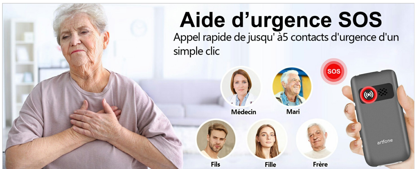
Image 4.3: Visual representation of the SOS emergency assistance feature.