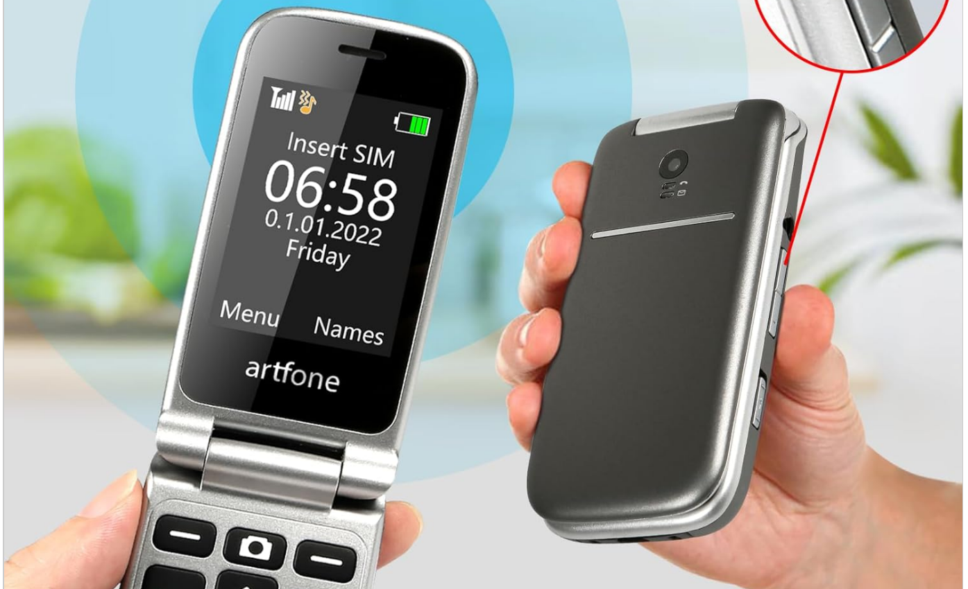
Image 4.5: The time announcement function, activated by pressing a specific button.