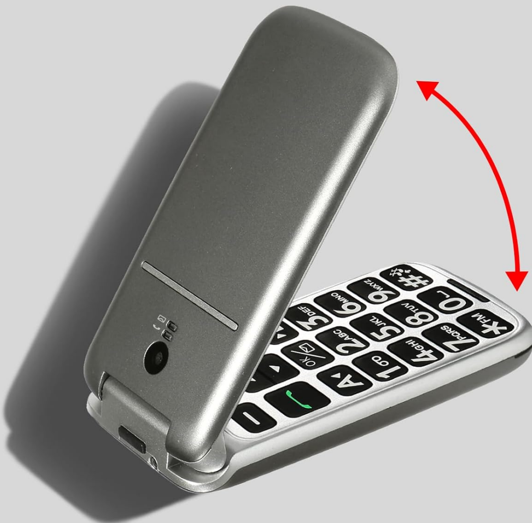
Image 5.1: The artfone G3 undergoing a reliability test, demonstrating its durable flip mechanism.