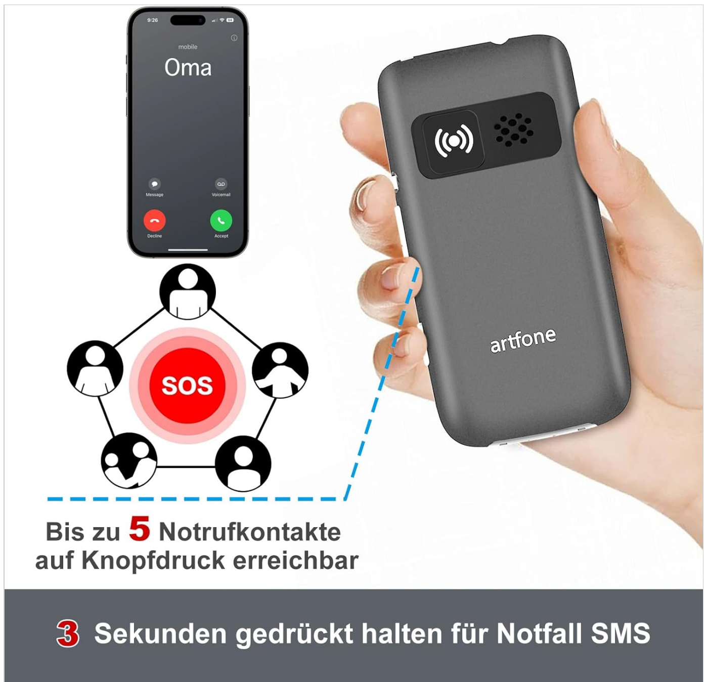
Image 4.2: The SOS emergency button and its function to contact up to five pre-set numbers.