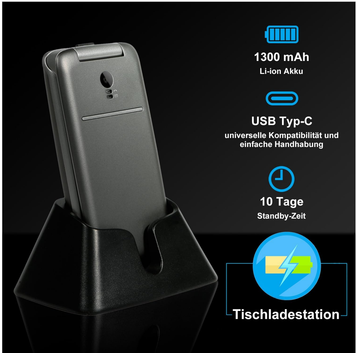
Image 3.2: The artfone G3 charging in its desktop cradle, highlighting battery capacity and USB-C compatibility.

A full charge typically takes a few hours. The phone features a 1300 mAh battery, providing approximately 5-6 hours of talk time and up to 10 days of standby time.