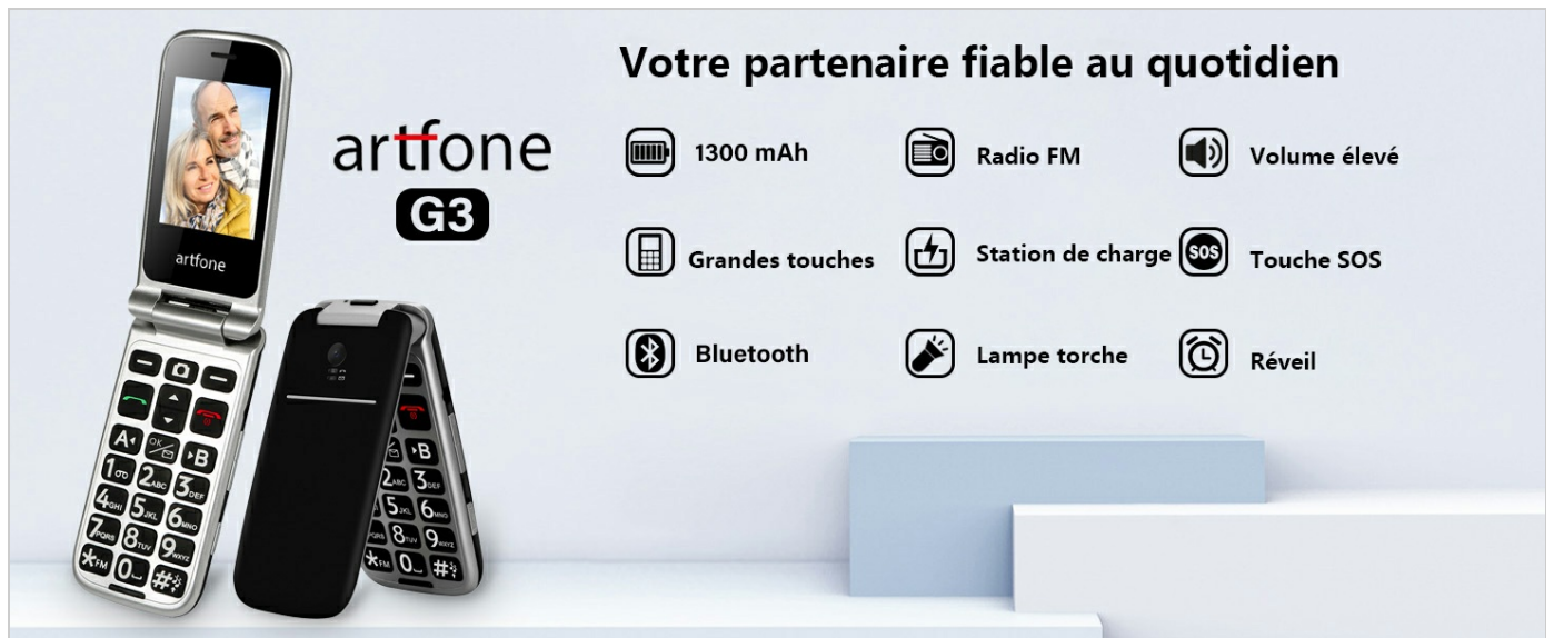
Image 1.1: The artfone G3 4G Senior Flip Phone, highlighting its 4G VoLTE capability.

This manual provides detailed instructions for the safe and efficient use of your artfone G3 4G Senior Flip Phone. Please read this manual thoroughly before using the device and keep it for future reference. The artfone G3 is designed with ease of use in mind, featuring large buttons, a clear display, and essential functions for seniors.