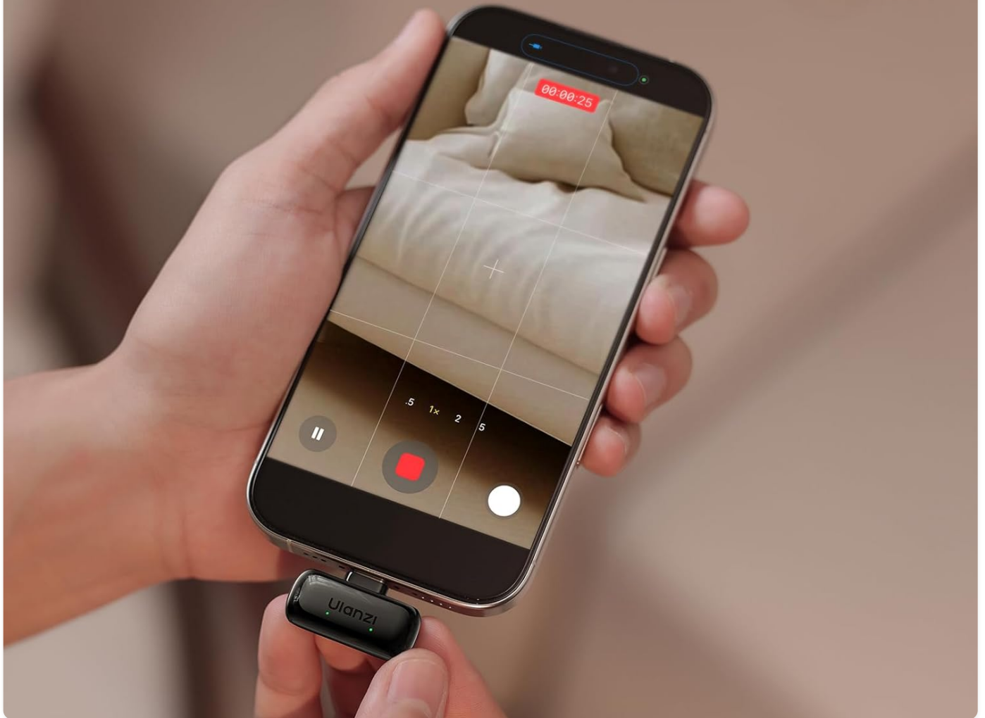
Image: The ULANZI A200 Mini Mic receiver connects directly to a smartphone's Type-C port for immediate use.

Featuring a button-free design, the A200 pairs automatically and records effortlessly, with smart noise cancellation delivering crisp, professional audio.