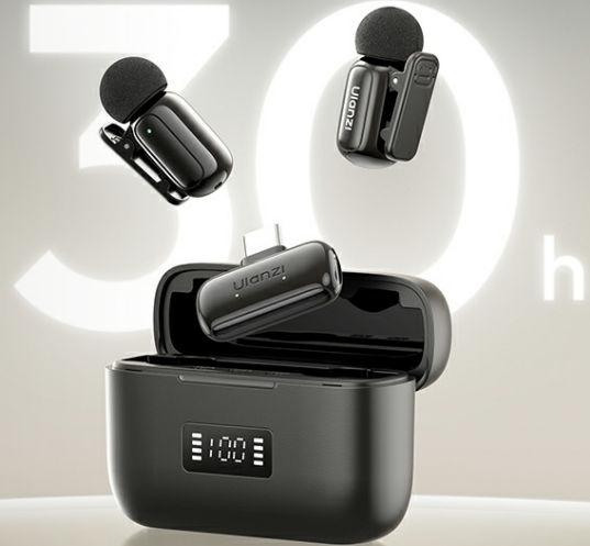
Image: The ULANZI A200 Mini Mic receiver allows simultaneous phone charging, ensuring continuous power during long recording sessions.

*Each transmitter lasts about 6 hours. Using both transmitters with 1.5 charges from the case gives a total runtime of around 30 hours.