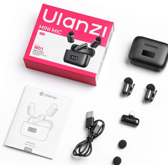
Image: Technical specifications and physical dimensions of the ULANZI A200 Mini Mic receiver.