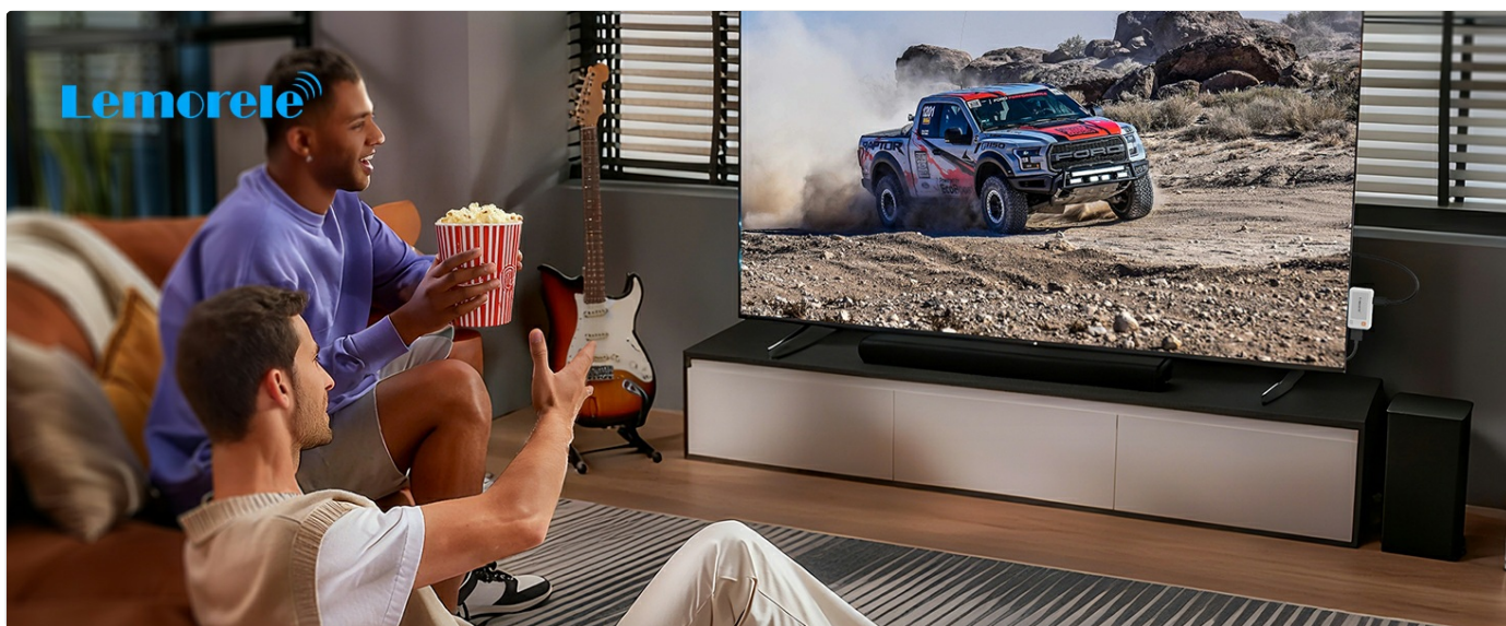
Image: A visual representation of the plug-and-play functionality, showing the transmitter connected to a laptop and the receiver connected to a TV, with a person watching content.

Image: A three-step visual guide showing how to connect the RX to a screen, plug the TX into a laptop/PC, and the automatic pairing process.