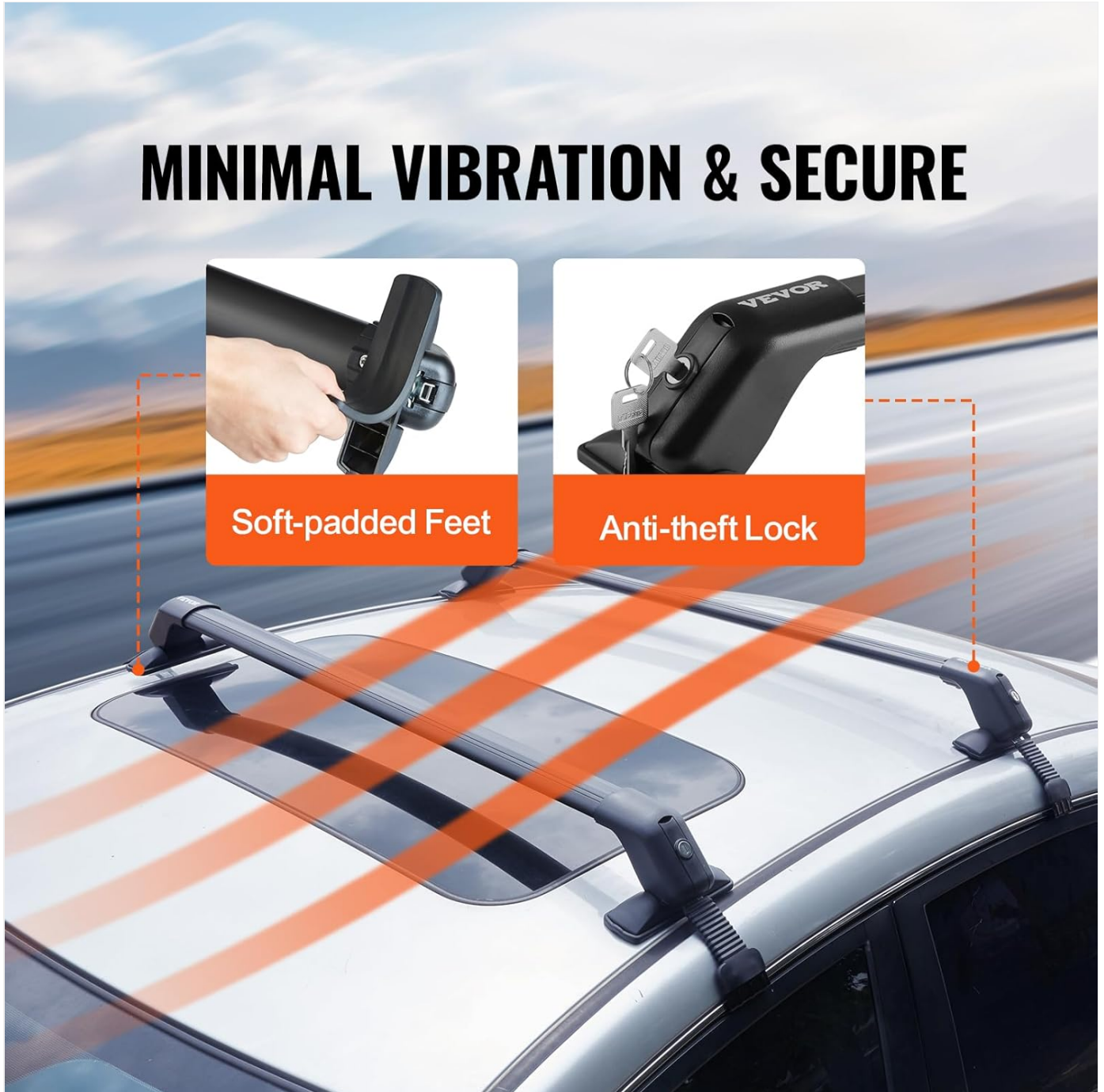
Image 5.3.1: Close-up view highlighting the soft-padded feet for vehicle protection and the anti-theft lock mechanism on the VEVOR roof rack.

The cross bars are equipped with an anti-theft lock system. Once installed and tightened, use the provided keys to lock the mounting feet. This secures the cross bars to your vehicle and prevents unauthorized removal.