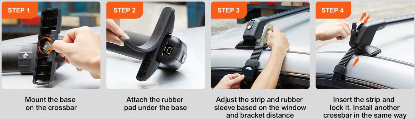
Image 4.3.1: Visual representation of the four installation steps: mounting the base, attaching rubber pads, adjusting the strap, and locking the crossbar.

After installation, ensure both cross bars are parallel and evenly spaced. Double-check all connections for tightness. The anti-theft lock system can then be engaged using the provided keys for added security.