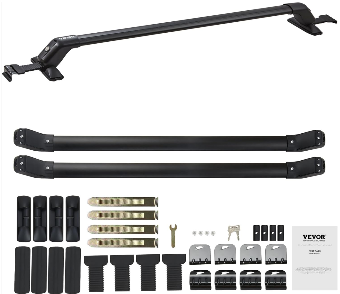
Image 3.1: All components included in the VEVOR Universal Roof Rack Cross Bars package, laid out for inspection.