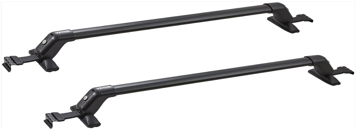
Image 1.1: VEVOR Universal Roof Rack Cross Bars, showing the two black aluminum cross bars with mounting feet and locking mechanisms.

This manual provides detailed instructions for the safe and effective installation, operation, and maintenance of your VEVOR Universal Roof Rack Cross Bars. Designed for vehicles with bare roofs, these cross bars offer a robust solution for transporting various items. Please read this manual thoroughly before installation and retain it for future reference.