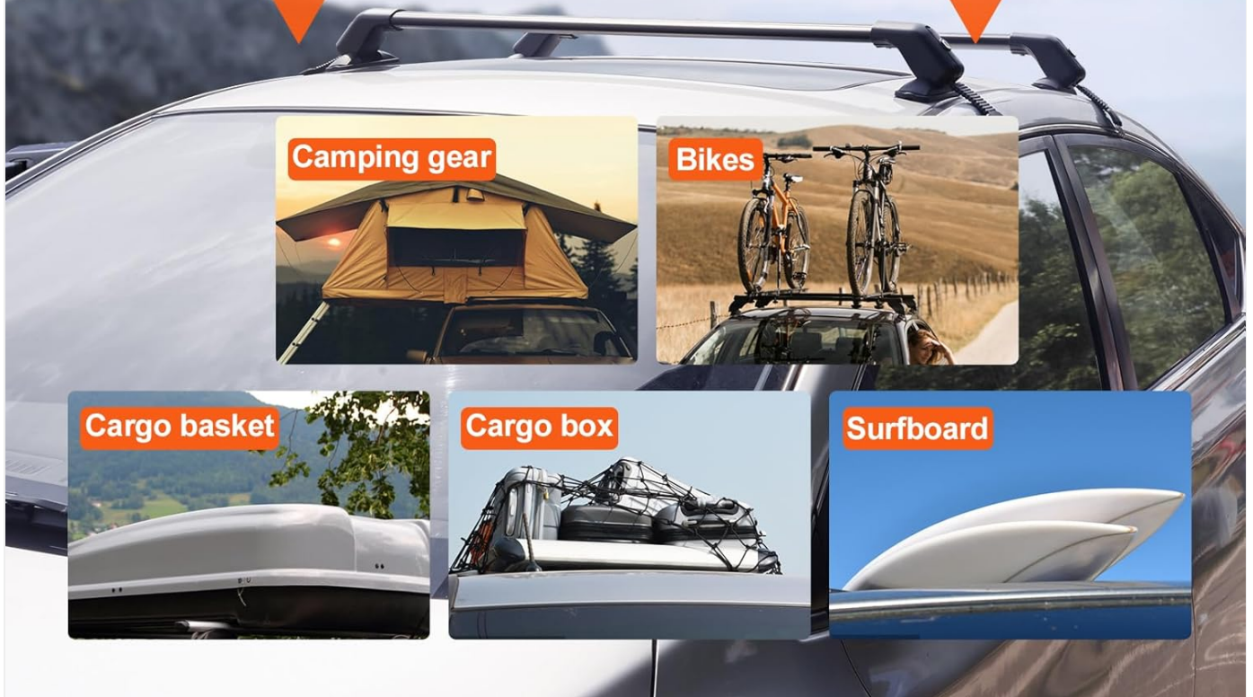
Image 5.1.1: Illustration of the roof rack carrying various items like camping gear, bikes, cargo baskets, cargo boxes, and surfboards, highlighting the 155 lbs load capacity.