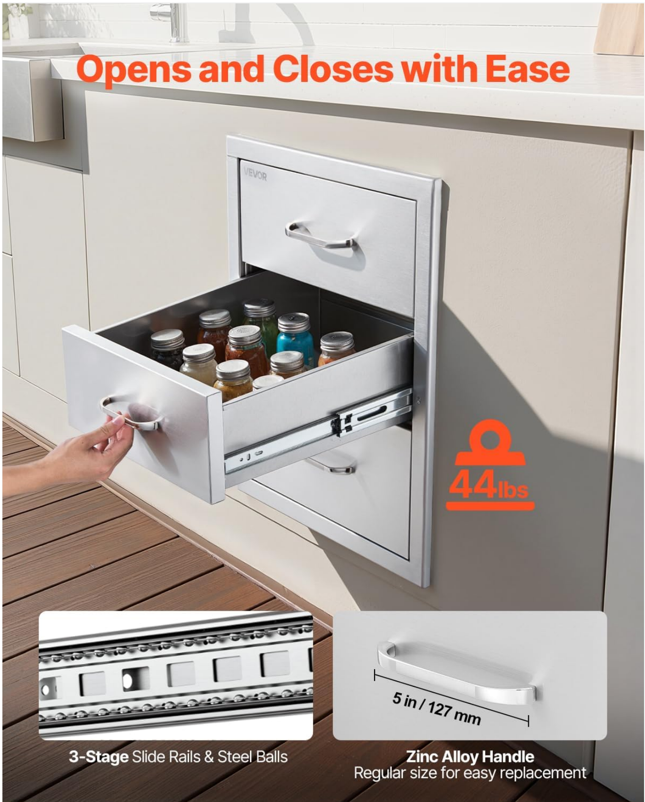
Image 5.2: Detail of the 5-inch zinc alloy handle and smooth 3-stage slide rails.