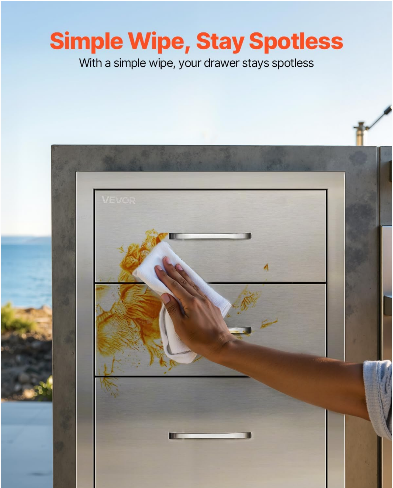
Image 7.1: Demonstrating simple cleaning of the stainless steel surface.

With a simple wipe, your drawer stays spotless