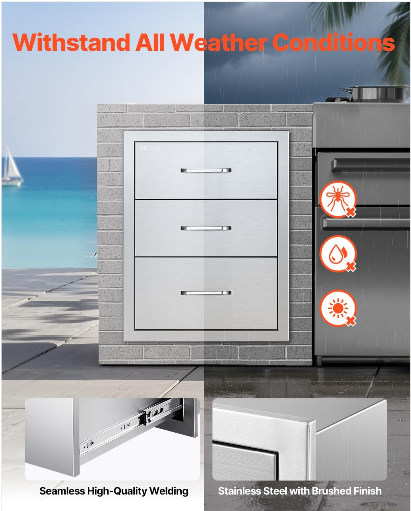
Image 7.2: The stainless steel construction is designed to withstand various weather conditions.

The drawers are constructed from waterproof stainless steel to withstand various weather conditions, including wind and rain. While designed for outdoor use, regular cleaning and inspection are recommended to maintain optimal condition.