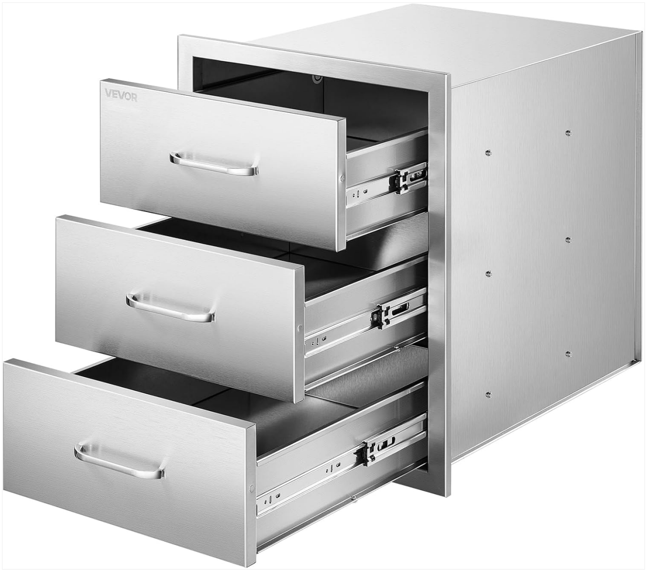
Image 1.1: VEVOR Outdoor Kitchen Drawers integrated into an outdoor kitchen environment.