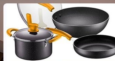
Kitchenware / Tableware