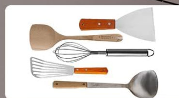
Spatulas & Grilling tools