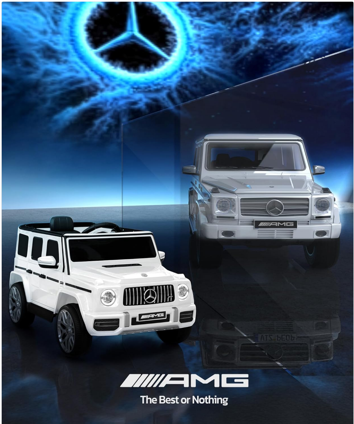
Image: Side view of the ELEMARA Mercedes-Benz AMG G63 Electric Ride-On Car in white, showcasing its realistic design.