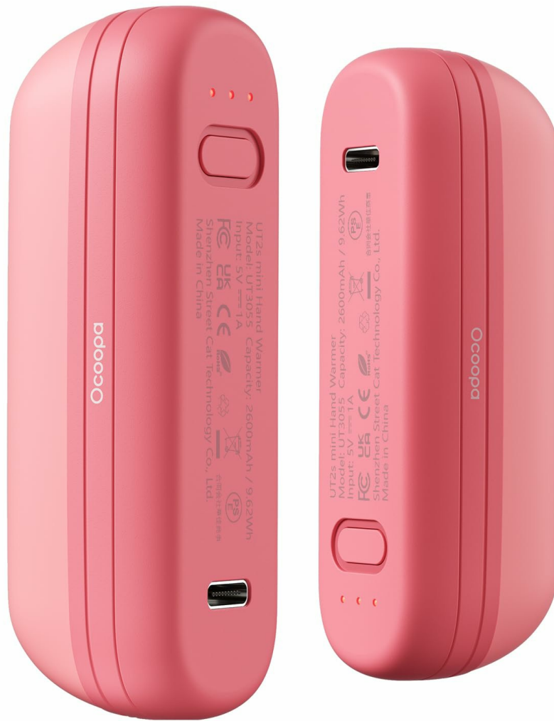
Image: OCOOPA UT2s Mini Hand Warmer in Barbie Pink, shown next to a lipstick for size comparison, highlighting its pocket-friendly size.