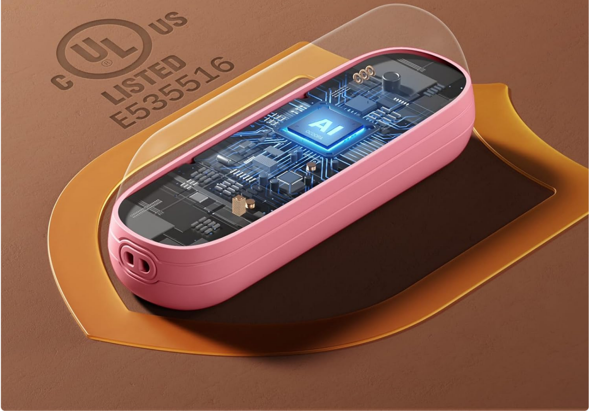
Image: An illustration highlighting the internal smart chip and UL certification of the OCOOPA UT2s Mini Hand Warmer, emphasizing its safety features.

Smart Constant Temperature with UL-certification ensure safety.