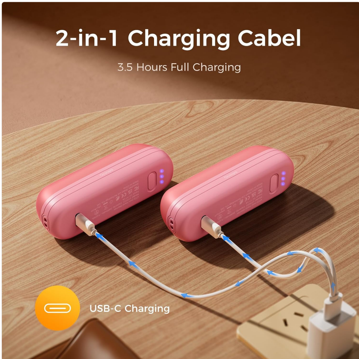
Image: Two OCOOPA UT2s Mini Hand Warmers being charged simultaneously with the dual USB-C cable, illustrating the convenient charging process.