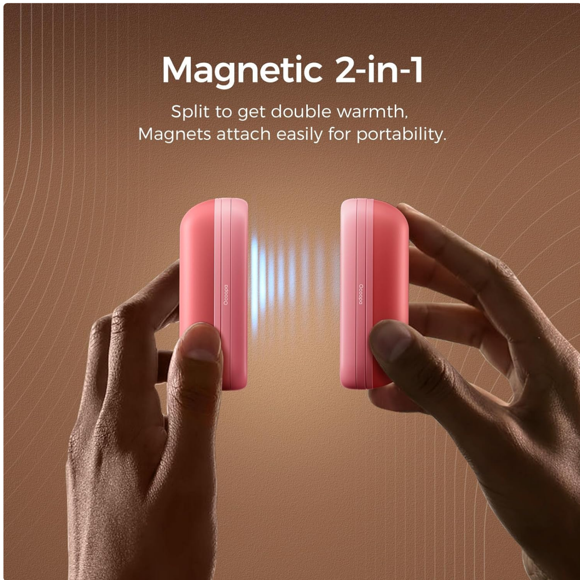
Image: Two OCOOPA UT2s Mini Hand Warmers magnetically attracting each other, demonstrating their 2-in-1 split type magnetic design for versatile use.