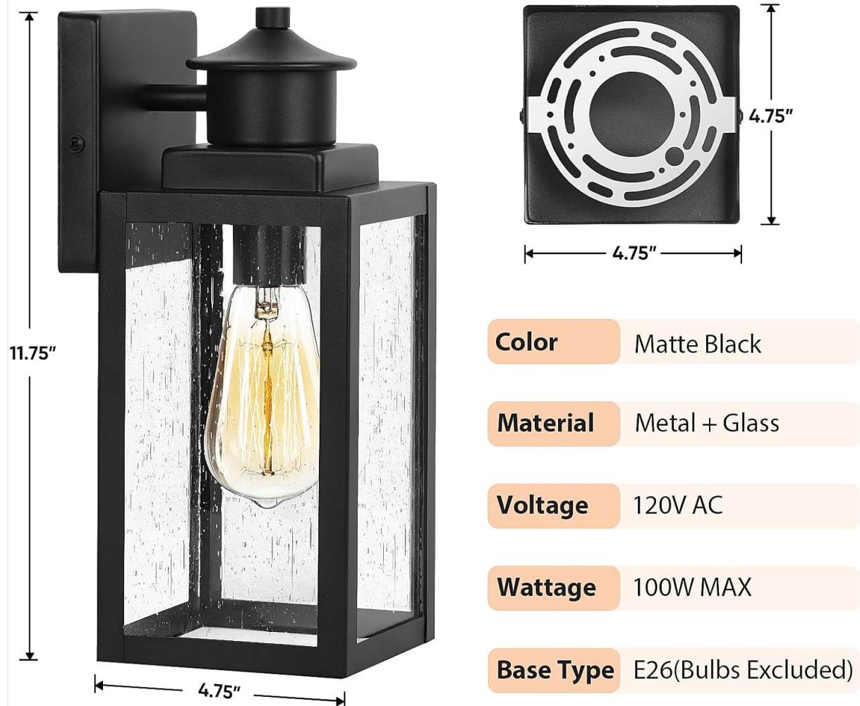
Image: Product dimensions and included components. The image displays the light fixture with measurements (11.75" H x 4.75" W x 4.75" D) and a separate view of the mounting bracket. Key specifications like color (Matte Black), material (Metal + Glass), voltage (120V AC), wattage (100W MAX), and bulb base (E26) are also listed.