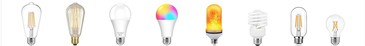
Image: A visual representation of different E26 base bulb types (LED, CFL, Incandescent, Halogen) that are compatible with the BesLowe outdoor wall lights. This helps users select appropriate bulbs.